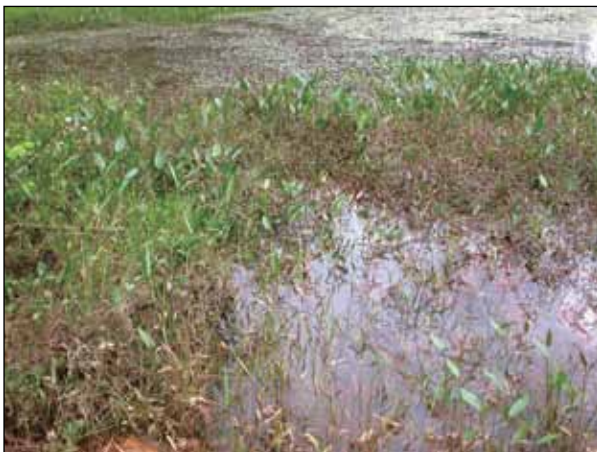
Ludwigia sedioides and Echinodorus spp., invading natural water bodies in the lowlands