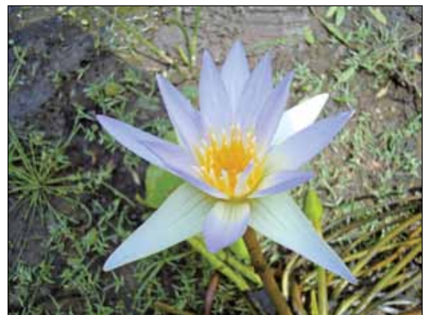
Native Nymphaea nouchali Burm. f. – at present is threatened by an exotic water lily

enable the conservation of vulnerable species in the habitat, (5) As a solution for the loss of vulnerable endemic ornamental aquatic plants due to over-exploitation, mass propagation of plants in demand must be encouraged, and (6) Monitoring of aquatic plant propagation units, and introduction of a code of conduct for aquatic plant nurseries will reduce the risk of plant propagules entering local water bodies.