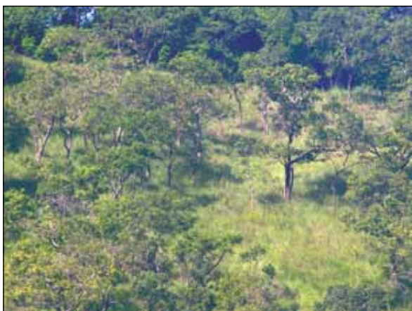
Figure 4. An upland savanna woodland at Belihuloya