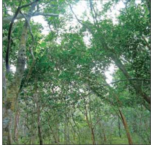
Figure 2. Tropical seasonal forest at the western part of the Wilpattu National Park