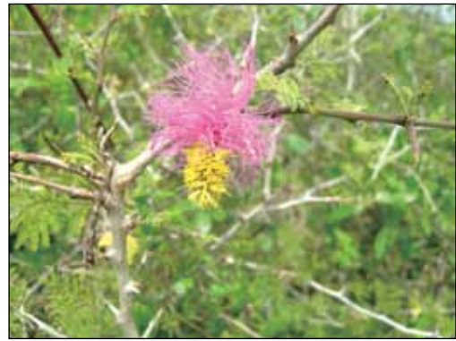
(b) Dichrostachys cinerea (Fabaceae)