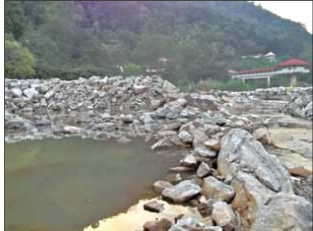
The rapids of the Mahaweli river at Gannoruwa-Hallolluwa area, Kandy – after being disturbed by the construction of the mini-hydropower plant.