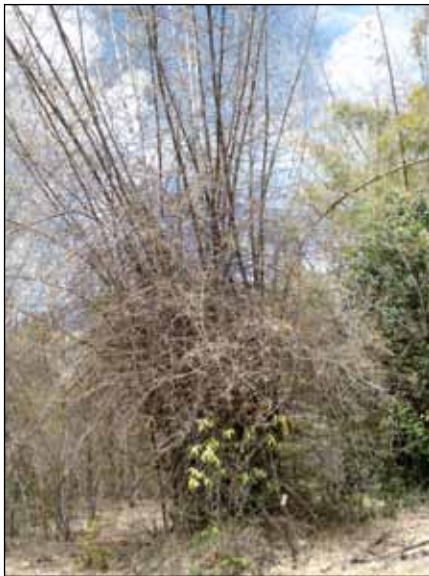
Figure 9. The dreadful invader: Bambusa bambos in Minneriya Forest