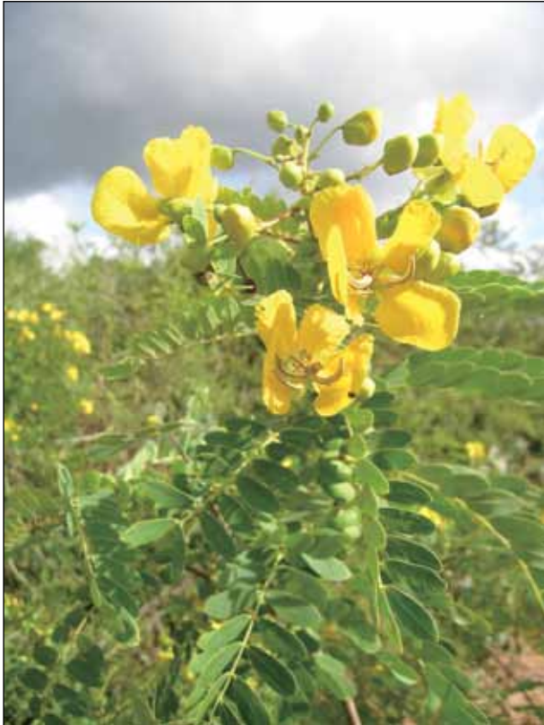
(a) Cassia auriculata (Fabaceae),