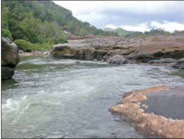
The rapids of the Mahaweli river at Gannoruwa-Hallolluwa area, Kandy - a site for many threatened aquatics, before being disturbed by the constructions of the a mini-hydropower plant. Note the members of the family Podostemaceae on the rock surface close to water.