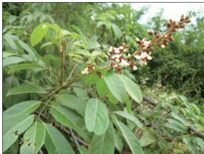
Figure 7 Derris parviflora , an endemic liana species with magnificent inflorescences

Forests in drier areas of the country possess comparatively a high taxic diversity in terms of plant genera which are mostly represented by a single species. For instance, 48 plant species were recorded from Bundala National Park which belongs to 47 plant genera. In contrast, the forests that grow in moist areas are rich in species but the diversity of plant genera decreases due to the presence of congeneric species. For instance, Dimocarpus gardneri and D. longan and Strychnos minor and S. trichocalyx grow in Kilinochchi forest which is comparatively wetter than the forests at Bundala.