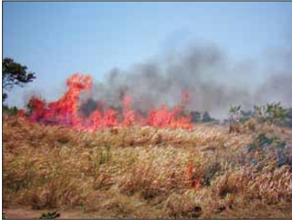
(a) Fire in a P. maximum dominated grassland at Mawuara, Udawalawe