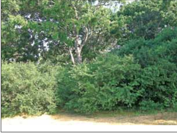
Figure 1. Tropical semi-deciduous forest in Bundala National Park with a single species ( Manilkara hexandra ) dominant canopy