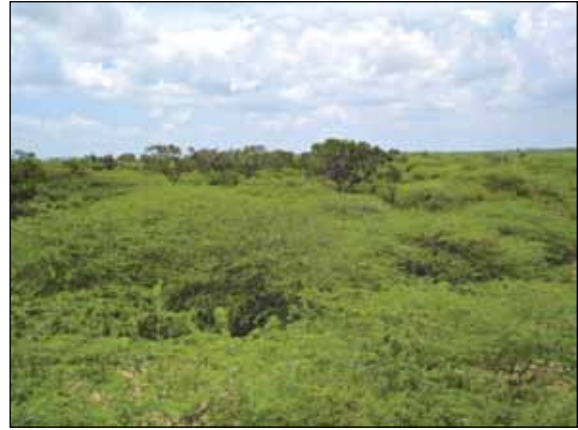
(b) Prosopis juliflora invaded land in Bundala forest.