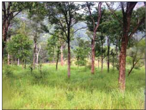
Figure 5. A lowland savanna woodland at Nilgala