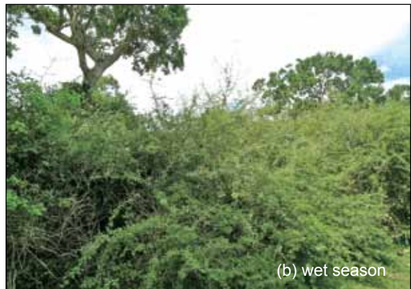
(b) wet season