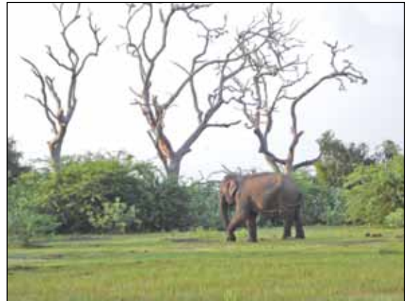
Figure 10. Die-back of M. hexandra in Bundala National Park

vary from region to region. Thus, Prosopis juliflora is found in coastal dry forests at Hambanthota and Mannar districts (Figure 8b) while Bambusa bambos is a common invader in Minneriya and Girithale forests in Polonnaruwa district (Figure 9). In contrast, Lantana camara is universally distributed across the whole dry land of the country.