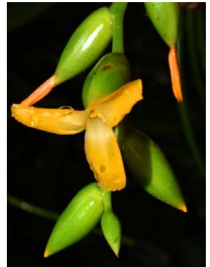
Flowers distinctly light orange and the petals are spreading (EB)