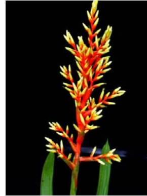
Inflorescence branched at maturity, with all-red bracts in the flower cluster, and greenish flowers (PN)