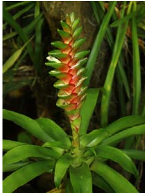
Plants are relatively small and found in the understory, in similar habitats as Guzmania lingulata (EB)