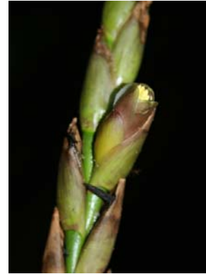
Young flower with bronzy petals; note rachis is visible, compared to not visible in above right (BH)