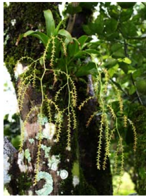
Inflorescence varies from compound (above) to simple, depending on plant size at flowering (MP)