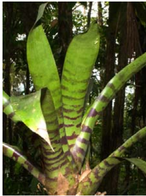
The strong lateral leaf banding, especially noticeable below, helps to distinguish this species (MP)