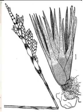
Racinaea rothschuhiana. Inflorescence slender, lateral branches short, flowers crowded.