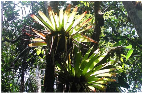
Broad strap-shaped leaves can become colorful in direct sunlight; the plants reach more than 1 m across and are similar in size to Androlepis skinneri , but lack leaf spines (JM)