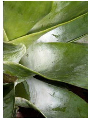
Closeup of leaf base within, also with heavy waxy bloom (EB)