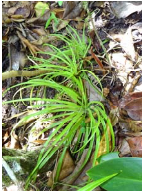
The plant is equally at home on the ground in leaf litter, as growing as an epiphyte (BH)