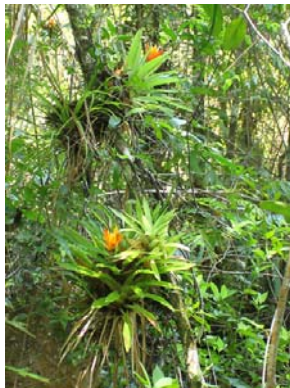
When in flower, often provides a bright spot of color in the forest (EB)