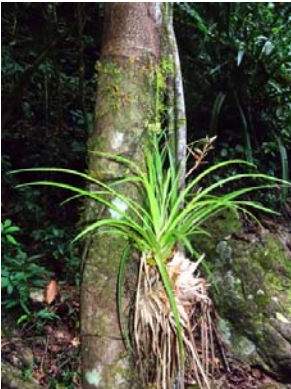
Leaves slender, soft, and light green, or can also be bronze-colored in bright light (EB)