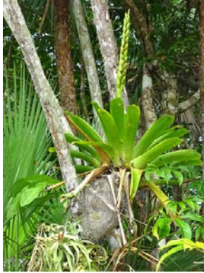
The rosette is broadly spreading and the inflorescence greatly exceeds the leaves in length (BH)