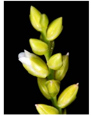
Petals scarcely exceeding the sepals, bright white (WC)