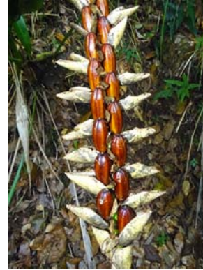
Resembling beetles marching in rows, the fruits are dark brown and shiny, and the bracts spreading (EB)