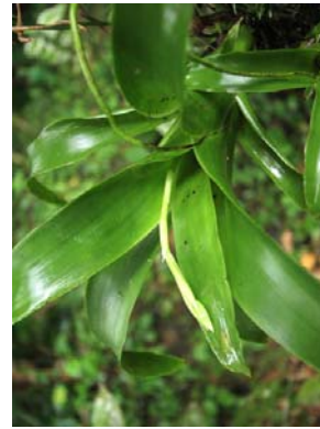
Plant in bud; leaves glossy above, with powdery coating on the lower surface toward the base (EB)