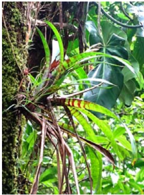
A medium-sized plant with a simple, erect inflorescence with rather few flowers (MP)