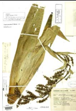
Catopsis paniculata . Inflorescence with prominent primary bracts and slender branches