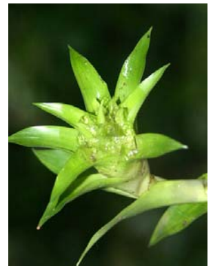
Flowers two per branch, white (not seen here); a clear gelatinous exudate is produced among the bracts (BH)