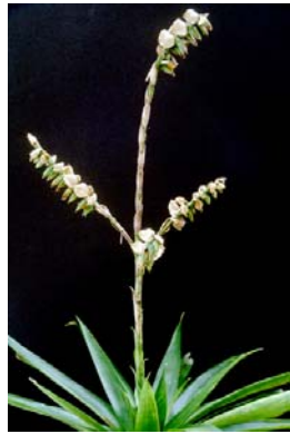
Inflorescence greatly exceeding the leaves, few-branched; flowers open on one side of the spikes (orig-in unknown; Selby BG archives)