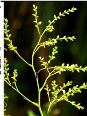
Inflorescence branching several times, with greenish to yellowish bracts (EB)