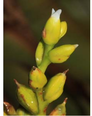
Flowers similar to C. sessiliflora , but the petals are smaller (EB)