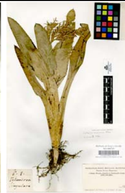
Catopsis wawraea . Inflorescence short, floral bracts prominently veined; leaf sheaths elongate.