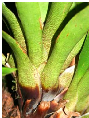
The curious horizontal banding is distinct; the leaves are shiny and medium green (BH)