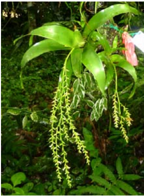
Plants have relatively few, broad, triangular leaves tapering to a point, and pendent inflorescences (MP)