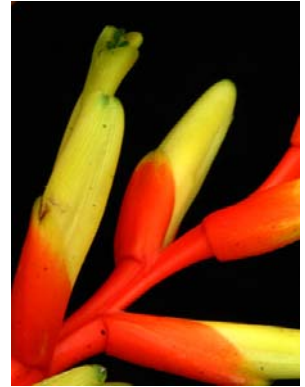
Flowers at maturity tubular, with the yellow petals slightly exceeding the similarly colored sepals (PN)