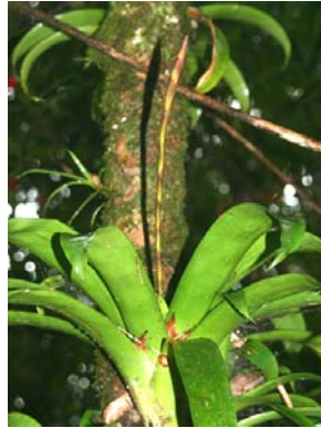
Plant with developing inflorescence and broad leaves (BH)