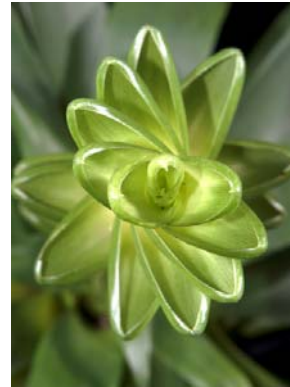
Inflorescence unbranched, with bracts either in one plane or in whorls as pictured here (WC)