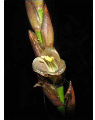
The flowers turn away from the rachis at maturity; note anthers at upper part of flower (JM)