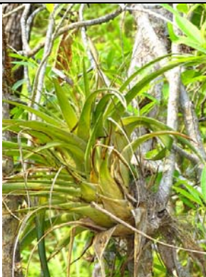
Leaf sheaths broad compared to the arching, spreading blades; overall color yellow-green (BH)