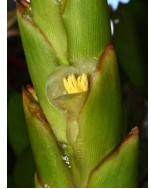
Petals green to bronzy, spreading; usually opening one at a time at night and closing in the morning (EB),