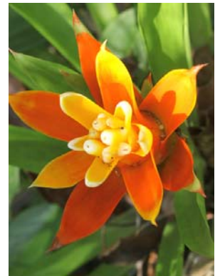
Flowers have waxy petals that do not spread open at maturity, and are pollinated by hummingbirds (EB)