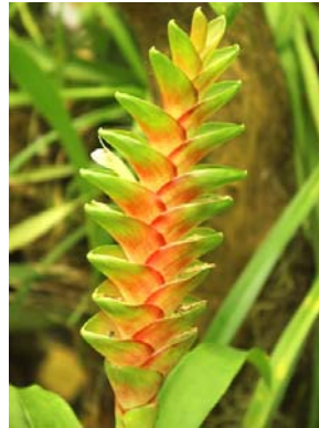
Floral bracts large and spread widely. They can be all green to all red; flowers appear one at a time (EB)