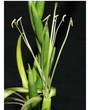
The calyx and stigma are dark green, and petals, stamens, and style light green (PN)