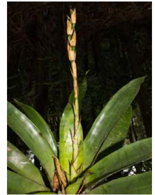
Inflorescence erect, unbranched, with few, widely spaced flowers; not pictured, but petals are green (MP)