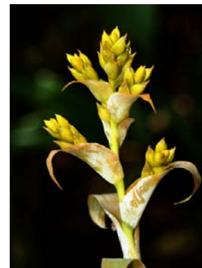
Primary bracts are often also coated with white wax, and lateral branches are short (BH)