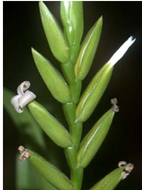
Inflorescence simple, floral bracts and sepals are green; the petals are white (MP)