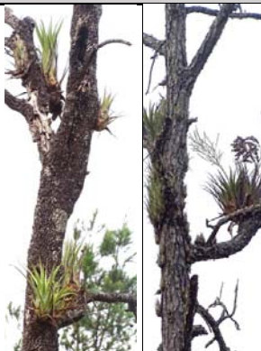
Plant silhouettes in the Mountain Pine Ridge; young plants are vase-shaped, and spread out when flowering (BH)