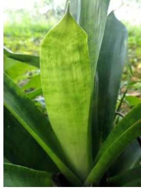
Leaves abruptly narrowed at the tip and with fine tessellation (faint to distinct horizontal markings) (EB)