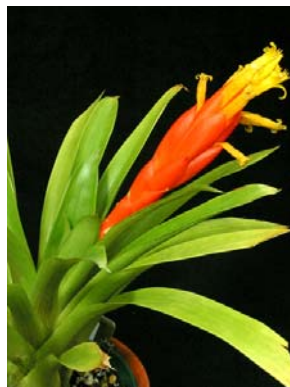
Inflorescence spreading to nodding (pictured here a plant from Meixico in cultivation at Selby Gardens (PN)