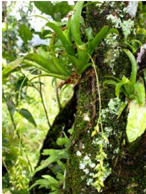
The inflorescence is pendent, with a long scape that has few bracts (MP)