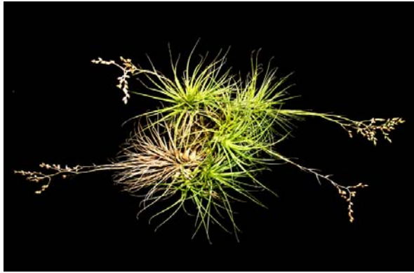
Plants small, with inflorescence greatly exceeding the leaf length; leaves narrow and soft (WC)