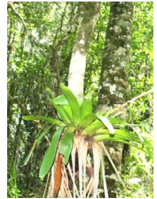
A plant with an old inflorescence, and all-green leaves (BH)

Group 5. Poorly known species; these three species would belong to Groups 3 or 4 ; they all have branched inflorescences and mostly green bracts. Images of dried, pressed plants/illustrations courtesy of the Nat. Museum of Natural History, Smithsonian Institution.