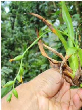
Plants are relatively small and few-flowered (EB)