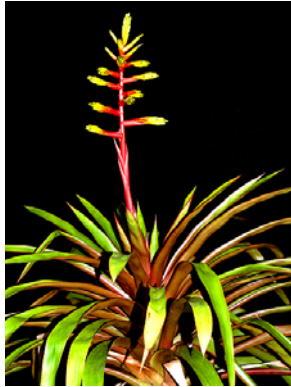
Plant just prior to full bloom, in cultivation at Selby Gardens (PN)