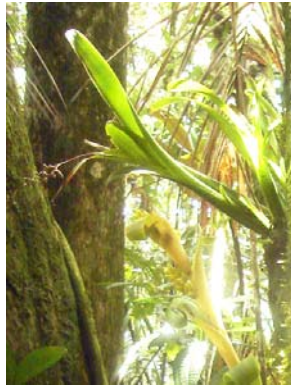
Catopsis nitida (top); note tubular form of rosette (an inflorescence of C. hahnii is in the photo, below (CA)