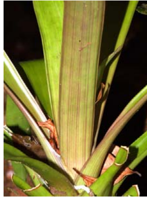
Leaves either generally reddish or with distinctive lines on the lower surface (EB)