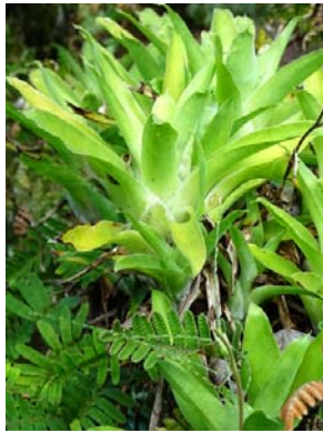
Plants are rather small, and the soft, pliable strap-shaped leaves form a spreading rosette (EB)