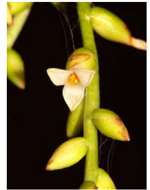
View of male flower with anthers releasing pollen (MP)