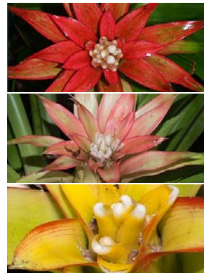
Inflorescence bracts can be pink, yellow, orange or red, the inner ones are white-tipped (BH, EB, EB)