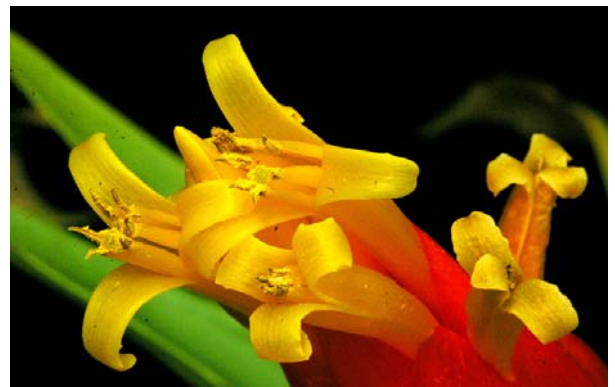
Petals bright yellow, spreading at their tips, the anthers yellow. As with many colorful guzmanias, this species is likely hummingbird-pollinated (plant from Costa Rica in cultivation at Selby Gardens; PN)