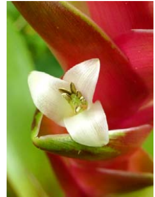
Petals bright white, with their tips spreading (EB)