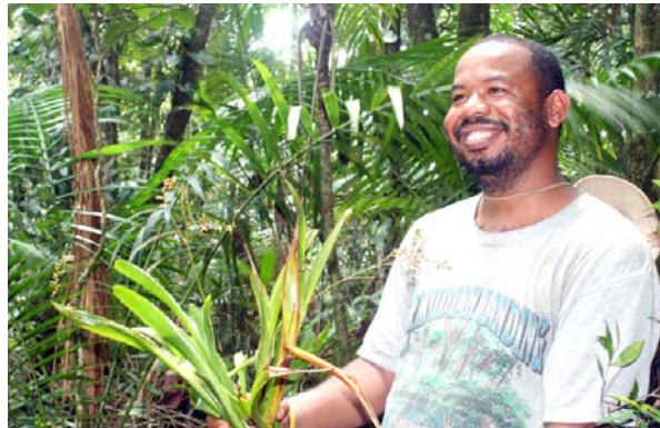
First collected in Belize in 2007 during an expedition to Doyle's Delight, Maya Mountains, the highest point in Belize (BH)