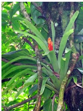
Inflorescence unbranched, narrowly club-shaped and usually shorter than the leaves (EK)