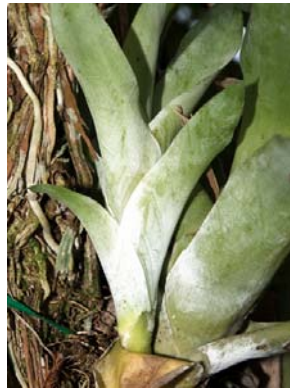
Leaves with a waxy, powdery coating especially notable on the lower surfaces (WC)