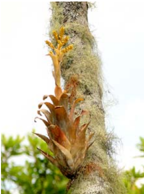
Plants mostly solitary, usually producing a single offset; leaves bronzy in sun and greenish in shade (JM)