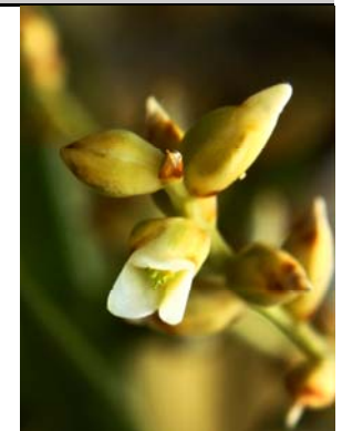
Flowers small, the white petals scarcely exceeding the yellow-green sepals; anthers included within the petals (EB)