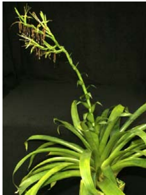
Foliage is all green, the petals and stamens persist after flowering (PN)