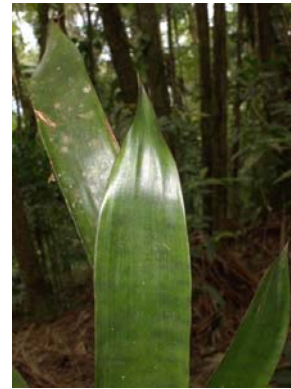
Leaves broadly strap-shaped, lustrous, and abruptly narrowed at the apex to a fine point (MP)