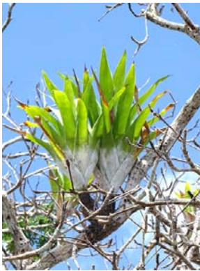
Notable for its light green leaves, vase shape, and heavy waxy covering on leaf bases (BH)