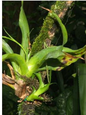
Leaves are few per rosette, smooth, semisucculent, and brittle (MP)