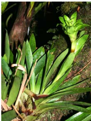
All parts of plant are green except for lower portion of leaves and whitish flowers (BH)