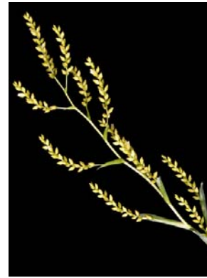
Inflorescence erect, with ascending branches; male and female flowers on different plants (WC)