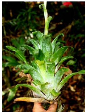
Green, shade form of the species, with pronounced waxy coating; note leaves inrolled at tip (BH)