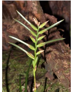
Broadly spreading fruiting capsules are arranged ladder-like (MP)