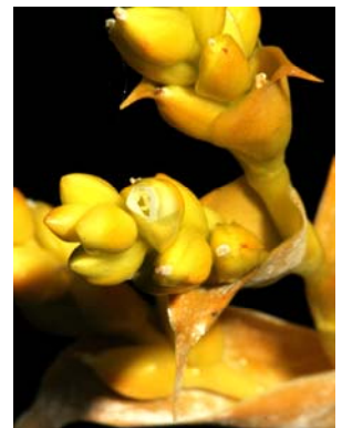
Petals yellow-white, barely exceeding the sepals in length (PN)