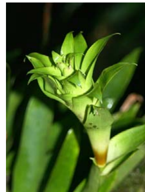
Inflorescence branched, though the short branches are hidden among the reflexed primary bracts (BH)