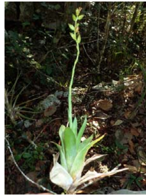
Small plant with atypical unbranched inflorescence (EB)