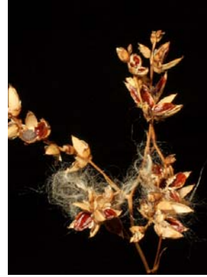
As with all species in Catopsis , the capsules are broad and short, and contain seeds with a coma (PN)