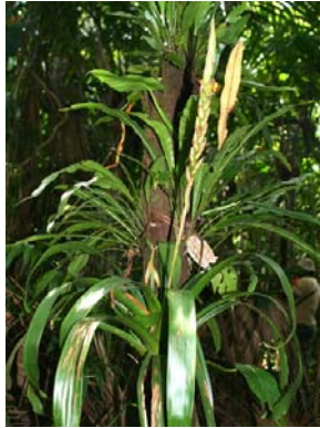
Leaf width can vary from narrow (above) to broadly strap-shaped; inflorescence erect or arching (BH)