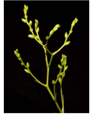
Inflorescence all-green except for whitish petals (not seen here) (PN)