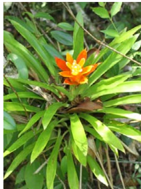
Leaves soft, light green and spreading, forming a well-shaped globose rosette (EB)