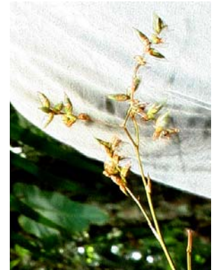
The inflorescence is poorly known in the photographic record; fairly delicate compared to other species (BH)