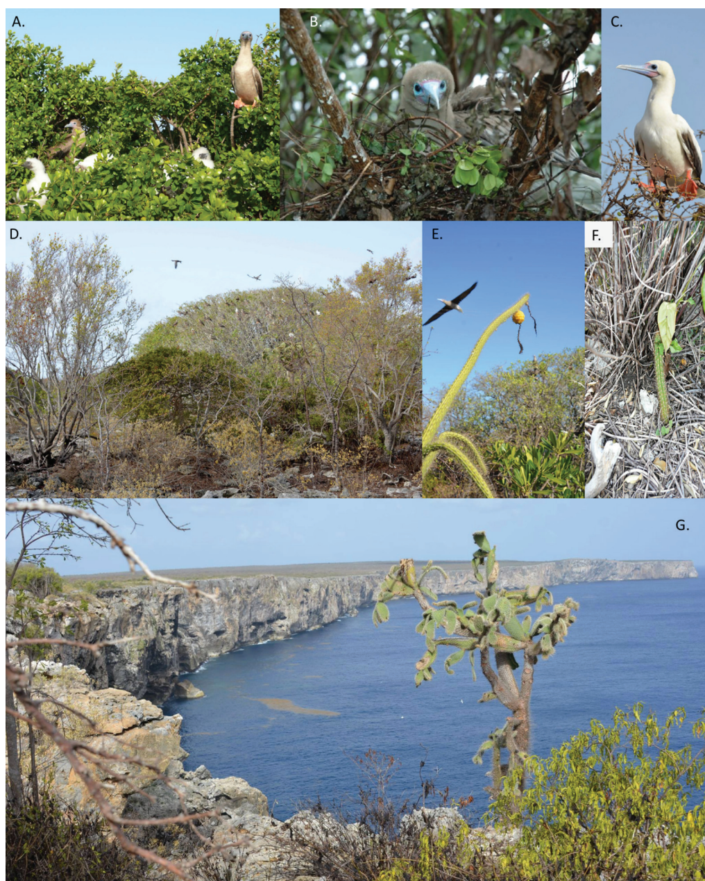
Figure 2. Sula sula (Red-footed Booby) nest most commonly on (A) Guapira discolor in Cabo Norte, Mona. (B) Nests are in part constructed from branches of G. discolor (see green leaves) even when nesting in other substrates such as this nest in a Ficus citrifolia . The population is dominated by the brown morph, but (C) white adults comprise about 13% of the population. (D) Large F. citrifolia trees are common in the site, and dozens of birds breed and perch on them. (E) There is a big population of the endangered Harrisia portoricensis cactus in the colony, where (F) seedlings and saplings are common. (G) The cliffs (looking west) of Cabo Norte where the colony is located, one of the most remote places in Mona island.