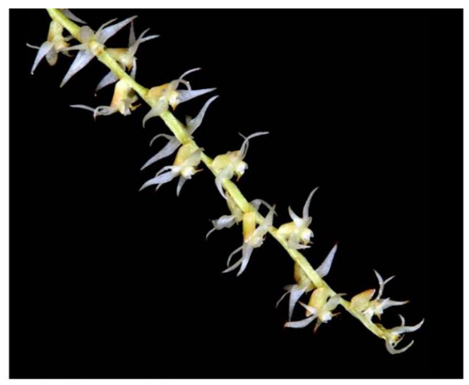
Dendrochilum stenophyllum 'My First' CCM-AOS, Photo: Katie Payeur, Orchids Plus v. 1.3

Dendrochilum stenophyllum seems to have uniquely shaped flowers. The CHM clone 'Trembling Tails' seems different since it had flowers that looked like perfect little cymbidiums....The flower colour of the different awarded clones is darker near the base and varies from off white to yellow.