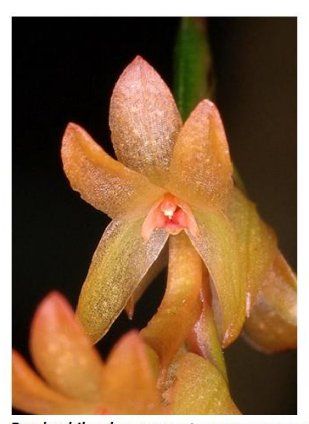
Dendrochilum luzonense, Photo: J. Cara, OW 11.2

Dendrochilum stenophyllum seems to have uniquely shaped flowers. The CHM clone 'Trembling Tails' seems different since it had flowers that looked like perfect little cymbidiums....The flower colour of the different awarded clones is darker near the base and varies from off white to yellow.