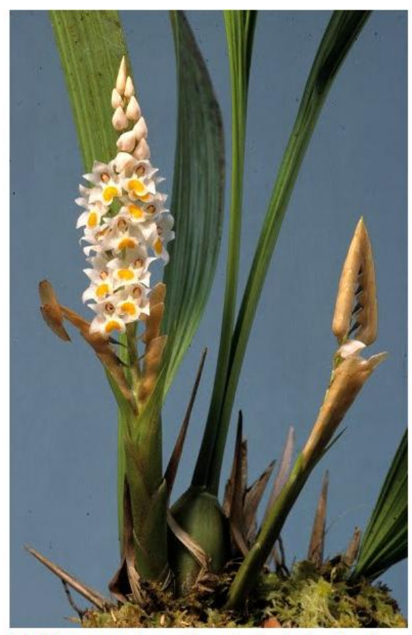
Pholidota ventricosa, Photo in situ by Art Vogel, OW 11.2

Pholidota imbricata is the only orchid your transcriber has ever thrown in the garbage even though it was healthy and huge and full of flowers..... However there are some reasonably attractive clones available, (see above) so make sure you buy it in bloom!!! In mine the dirty whitish flowers barely peeked out of the large hooded dead looking floral bract. Buy one with clear coloured flowers and slightly longer petioles so you can see the flowers, not just the dead bract.