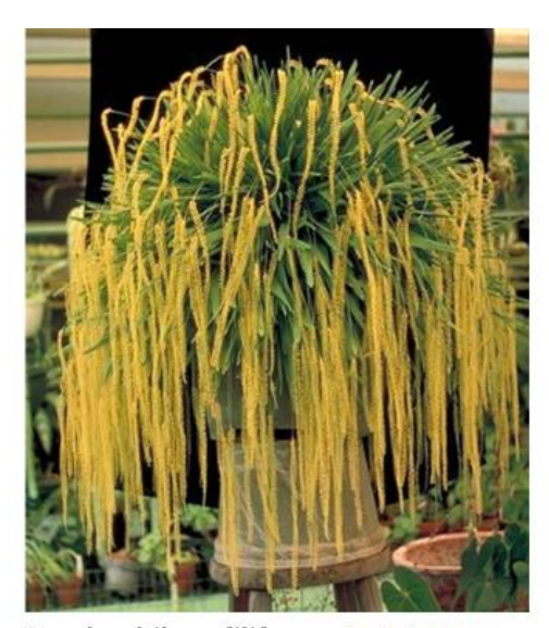
Dendrochilum filiforme 'Millie' CCM-AOS, Orchids Plus v. 1.3

Dendrochilum (synonym: Platyclinis ) is a large genus of at present 269 species and 21 varieties. If it is added to Coelogyne it will make for a huge composite genus even if some of the species go into the second clade! The common name is Golden Chain Orchids since so many species have golden flowers presented in arched two-ranked "chains".