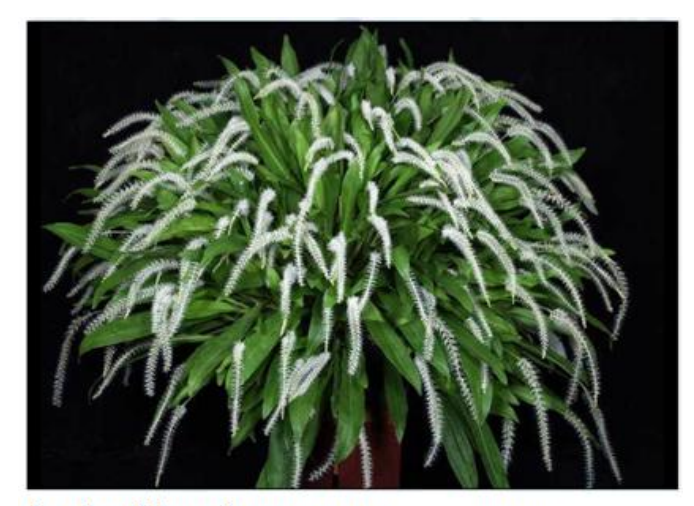
Dendrochilum glumaceum 'Vistamont' CCE-AOS,

Dendrochilum filiforme typifies the genus . However not everyone can grow it as well as shown in the above picture with about 3500 golden flowers! It even has a honey fragrance!