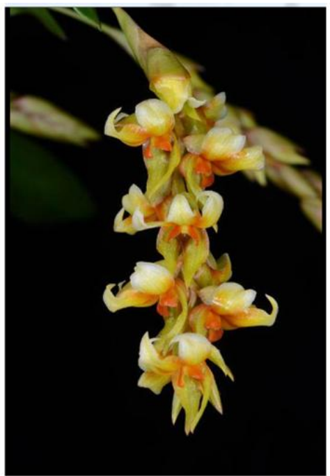
Dendrochilum cootesii 'Red Carmel Corn' CHM-AOS