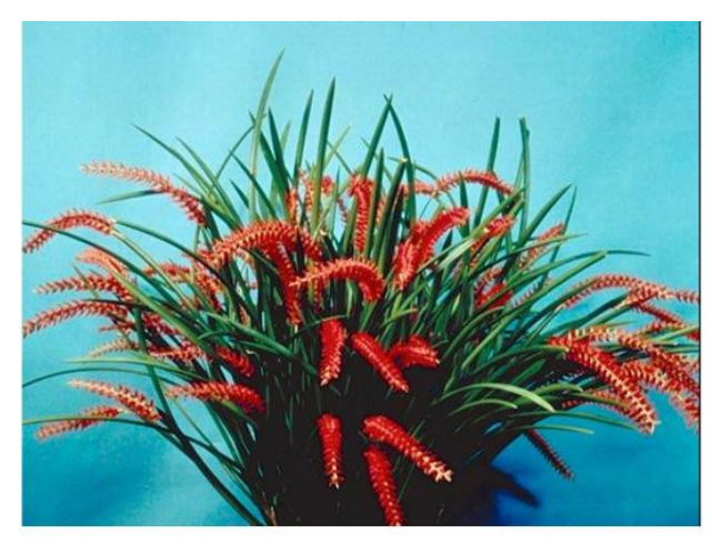
Dendrochilum wenzelii 'Barbara' CCM-AOS, Orchids Plus v. 1.3

Dendrochilum tenellum is another needle-leaved version of Ddc. glumaceum . The flowers vary from white to straw-coloured and can be presented from above the foliage to right amongst the middle of the "pin-cushion" of long leaves.