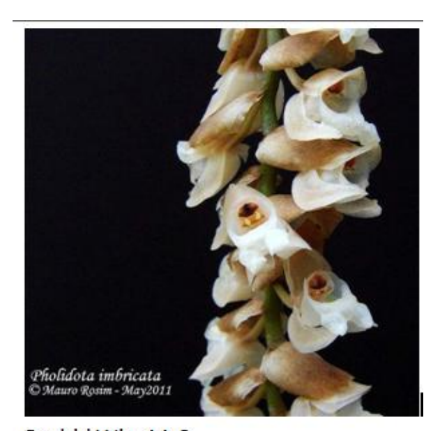
Orchid Wiz, 11.2

Pholidota chinensis has nicely opened flowers. Most clones have snowy white lips, while the sepals and petals vary from white to beige to pale yellow. The column is often peach.