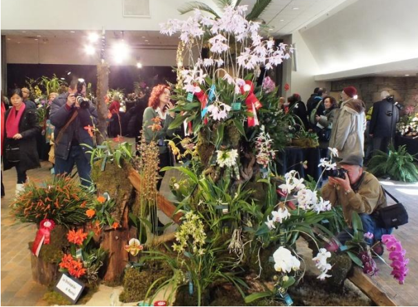
AOS Silver Certificate OurTropics Display photo pp