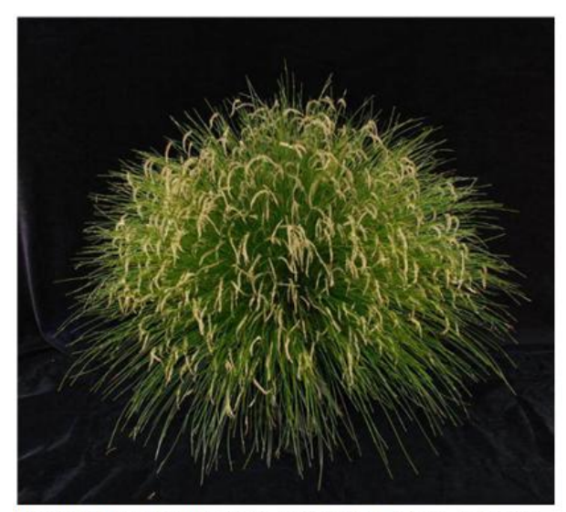
Dendrochilum tenellum 'Kramer' CCE-AOS, Photo: Jay Norris (Grown by Peter and Sherry Decyk), Orchids Plus v.1.3

Dendrochilum anfractum looks much like a needle-leaved Ddc cootesii . The segments are a little less curled.