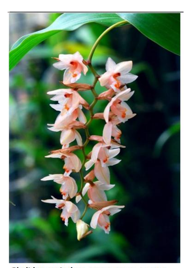
Pholidota articulata, OW 11.2

Pholidota species look much like cousins of dendrochilums! The genus contains 29 species and 7 varieties, but the most common species in the trade is also the plainest! Your transcriber had it shipped to us instead of more attractive species and it has put me off the genus for good!! Unfairly of course, since some species are just wonderful.