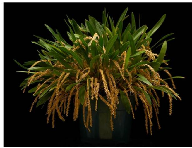
Dendrochilum smithianum 'Paula Hermelyn' CCM-AOS, Photo Jim Osen, O. + v. 1.3

Dendrochilum bicallosum is a delightful floriferous species with pale apricot to gold flowers on twisting inflorescences. Dendrochilum propinquum (synonym: convollariforme) usually has pale peach to straw coloured flowers on long pendent inflorescences, but the clone 'Vistamont' has deep peach coloured, shiny flowers arranged spirally on the stems. Dendrochilum uncatum has sprays of pale chartreuse flowers.