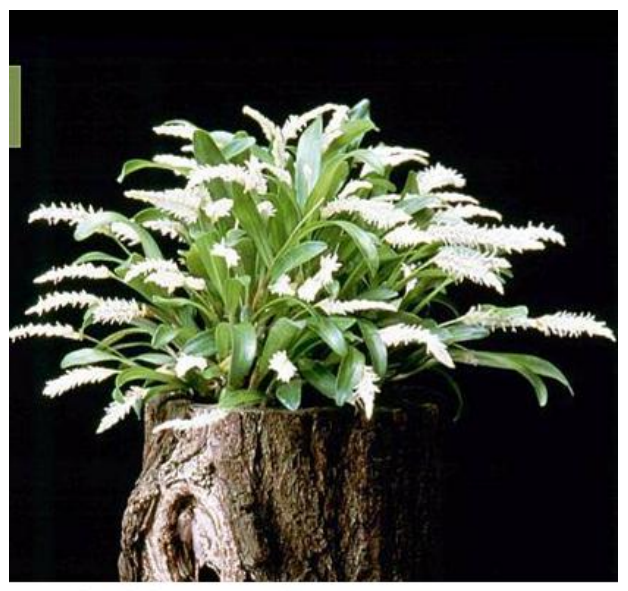
Dendrochilum parvulum 'Tom's Favorite' CHM-AOS

Dendrochilum luzonense (often erroneously called: luzonica ) has pale tan flowers and is very floriferous. It has long terete leaves. The Kennedy clone has salmon flowers, similar to the clone shown above.