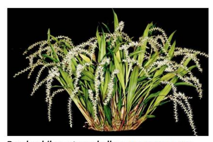
Dendrochilum stenophyllum 'My First' CCM-AOS,

Dendrochilum smithianum flowers vary from yellow with orange lips to beige with a rust stripe to all pale beige. It is one of the hard to identify species.