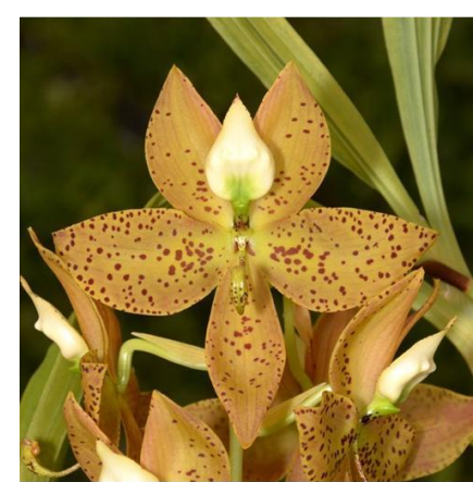
Cycnoches Maren Gleason, Photo: Fred Clarke, OW X4.2