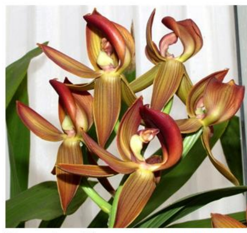
Mormodes rolfeana, Photo: Fred Clarke, OW X4.2

Mormodes Nitty-Gritty (Mormodes Exotic Treat x Mormodes rolfeana) is a cross of two somewhat orange clones and the results are wonderful mixes of red, brown and orange -much brighter than the parents! To be continued