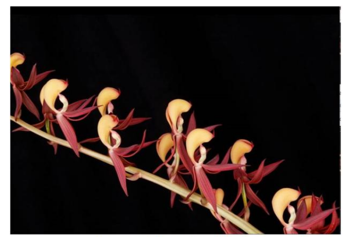
Mormodes ignea 'Sunset Valley Orchids' HCC/AOS, Photo: Arthur Pinkers, O+

Mormodes ignea flowers usually come in shades of red with or without stripes or fine dots. The lip is curled down into the form of a fat short pea pod, complete with the little spike at the tip. The lip colour can be the same as the rest of the flower or contrasting with it - often vellow or bright red - and again with or without markings, with the lip markings not necessarily matching those of the rest of