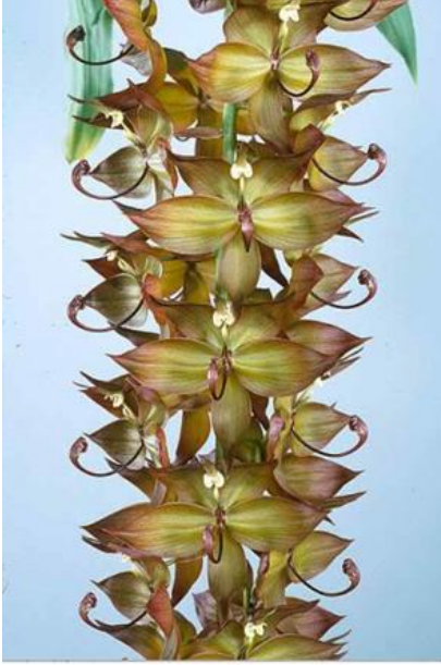
Cycnoches cooperi 'Sunset Valley Orchids III' FCC/AOS

Cychnoches or Swan orchids have that nick name because the slender curved columns of male flowers and the