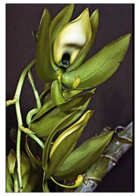
Cyc. chlorochilon 'White Oaks' HCC/AOS