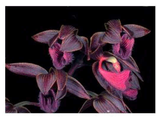
Mormodes Virgen del Valle Photo: Lynn O'Shaughnessy, OW X4.2

Mormodes hookeri) can be so colourful that the proper translation of the name "Sinful of Hooker" seems rather appropriate!