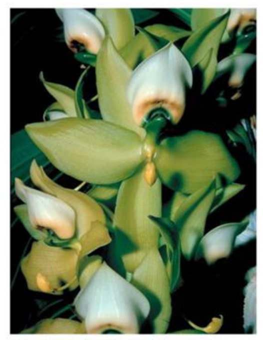
Cyc. warszewiczii 'Tinnie' AM/AOS, O+