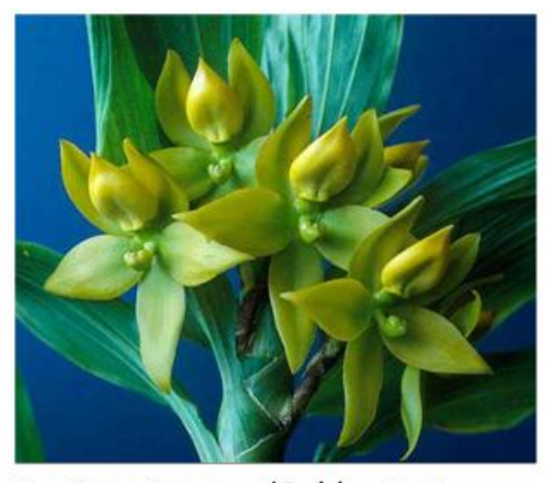
Cyc. herrenhusanum 'Golden Ring' нсс/Aos Female flowers, Photo: Rhonda Peters, O+

The males have a long slender curved column with pollinia at the end (the swan neck)