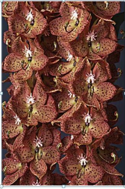
Cycnoches barthiorum 'JEM III' AM/AOS

Cycnoches herrenhusianum is a lovely gold species with huge inflorescences.