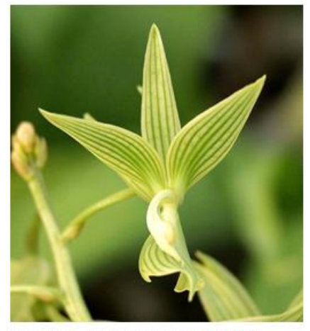
Mormodes elegans f. alba OW X4.2

Mormodes sinuata is often red with or without darker stripes. The large three-parted lip curls up very conspicuously. Orchid Wiz also shows a lovely wine-red clone with darker stripes ('Triton's Royal Wine').