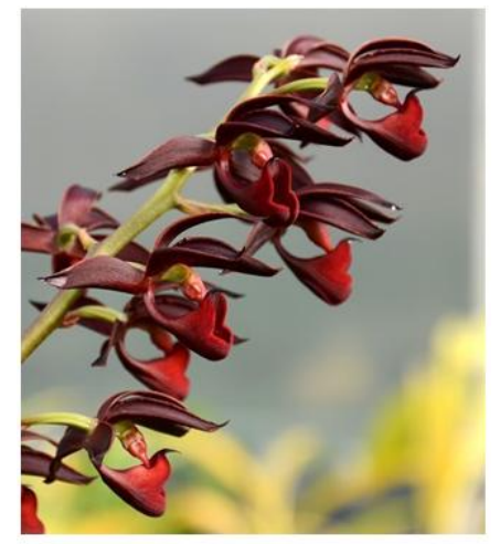
Mormodes Mark Mills 'Blood Red Lips' Photo: Fred Clarke, OW X4.2

Mormodes Virgen del Valle (Mormodes sinuata x