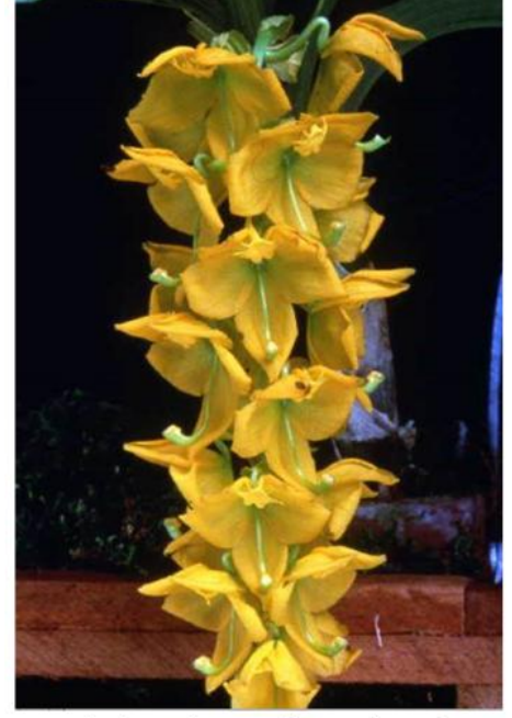
Cycnoches herrenhusanum 'Fox Den' CHM/AOS, O+

boat-like lip make the flower look like an upside down swan. They too have male and female flowers, but the female flowers are somewhat similar to the male flowers but of heavier substance and less graceful. Almost like a 4n version of the male flowers. Earlier judges were fooled by the changes and gave awards to female flowers because they thought they were superior male forms.