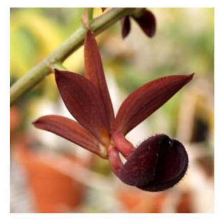
Mormodes hookeri 'Black Fuzz' Photo: Fred Clarke, OW X4.2