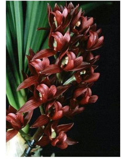
Mormodes sinuata 'Sunset Valley Orchids' Photo: Fred Clarke, OW X4.2