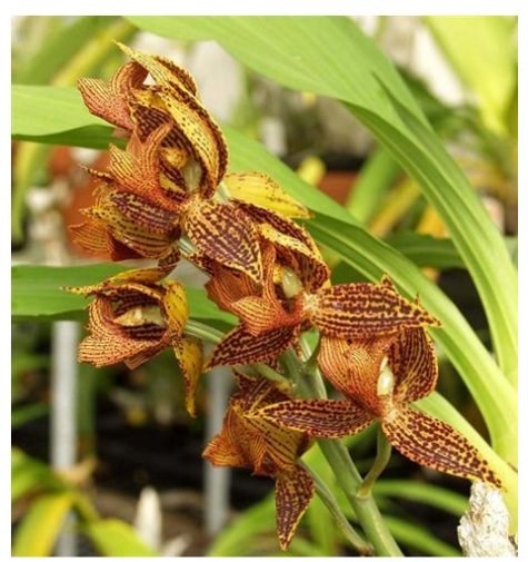
Mormodes Exotic Treat, Photo: Fred Clark, OW X4.2