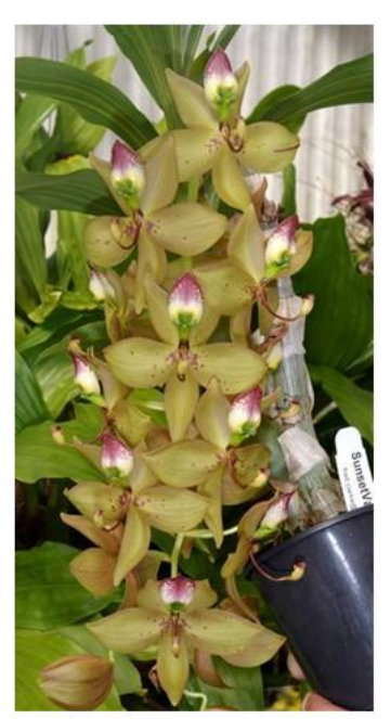
Cycnoches Sevenfold'17 Wonders' Photo: Fred Clarke, OW X4.2

Mormodes , the goblin orchids have perfect flowers, that is both pollen and stigmatic surfaces are found in the same flower. The reason for the "goblin" name is that the column is twisted down to lie on the lip, giving the flower a very asymmetric look. There can be accidental pollination by Euglossine bees.