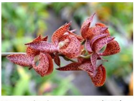
Mormodes lawrenceana 'SVO' Photo: Fred Clarke, OW X4.2

Once the pollen has been removed, the column untwists, and the flower thus makes it