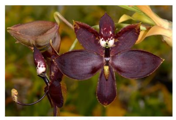
Cycnoches Dark Swan 'Black Swan' Photo: Fred Clarke, OW X4.2