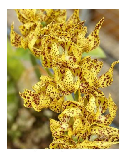
Mormodes maculata Photo: Fred Clarke, OW X4.2