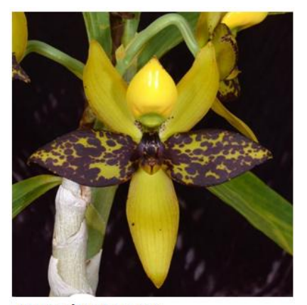
Cycnoches Cryminy Photo: Fred Clarke, OW 4.2