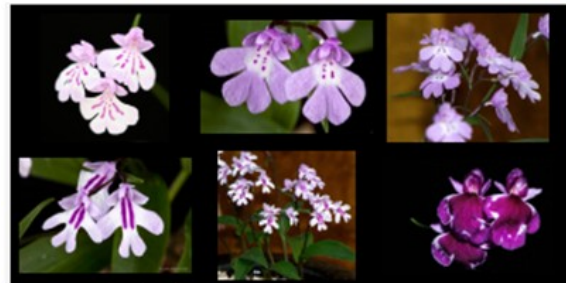
Ponerorchis keiskei

Ponerorchis (Amitostigma) papilionacea from NW Yunnan where it is found on grassy cliffs at 2500m elevation.