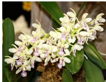
Phalaenopsis japonica , Photo: Ed Cott, OW 5.3

Phalaenopsis (Sedirea) japonica is a delightful small Phalaenopsis species that has small plants and relatively large flowers.