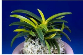
Yellow torafu 黄虎斑

Variegation is further classified as Shima (stripe), Fukurin (marginal stripe) and Torafu (tiger stripe). Torafu means there are random white or yellow bands or patches on the leaves