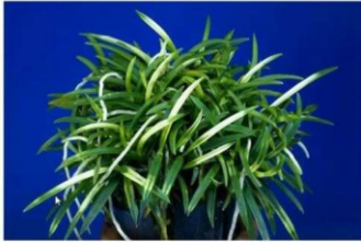
White torafu 白虎斑

The cultivars are classified by leaf shape, leaf size, leaf surface texture (smooth or pebbly), leaf base shape and colour and leaf markings such as variegation.