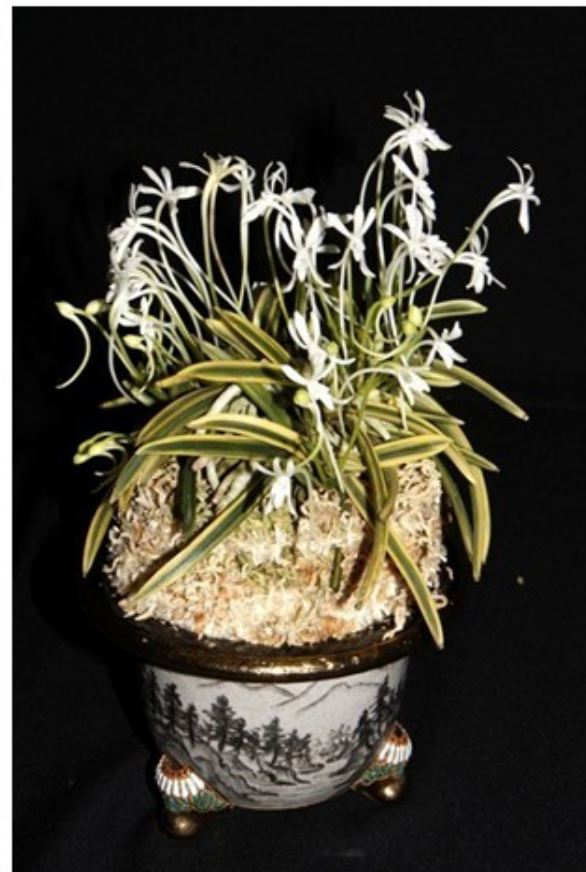
Vanda falcata var. Gojou Fukurin

This is the Japanese/ Chinese Orchid that has the most horticultural varieties in Cultivation. There are orchid societies wholly