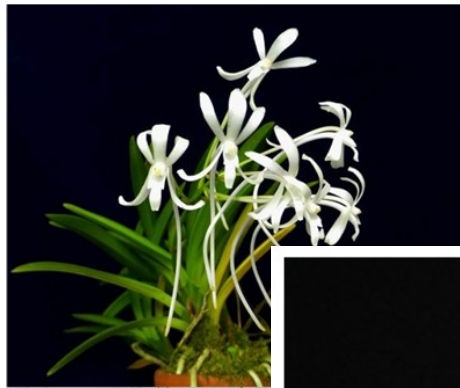
Vanda falcata 'Mi Suegra Merc, O+ V. 1.4