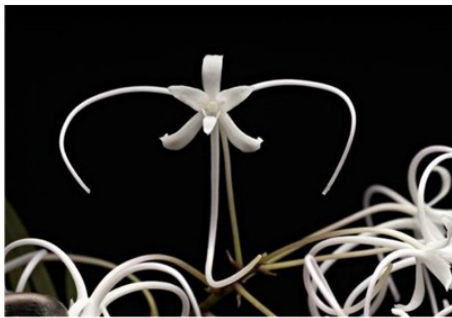
Vanda falcata 'Shibo Oni' AM/AOS Photo: James Osen, O+ v. 1.4

Variegation is further classified as Shima (stripe), Fukurin (marginal stripe) and Torafu (tiger stripe). Torafu means there are random white or yellow bands or patches on the leaves