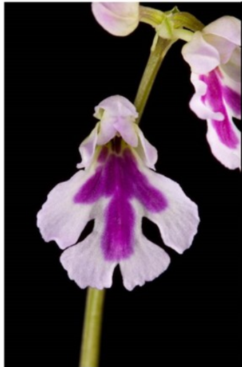
Ponerorchis lepida 'Yunagi' HCC/AOS Formerly: Amitostigma lepidum Photo: Richard Noel, O+ v. 1.4

This is a warm growing species that grows on cliffs and rocks in its native habitat. According to Orchid Wiz it comes from Ryukyu Islands and Japan where it grows in fields. -- Source: Jay Pfahl's IOSPE at www.orchidspecies.com