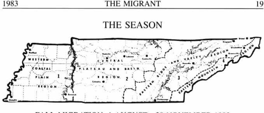
FALL MIGRATION: 1 AUGUST - 30 NOVEMBER 1982

According to the comments of the regional compilers, this was not an exceptional fall migration, but there were enough significant occurrences to make it interesting for birders across the state. August began with heavy local flooding in East Tennessee, and the rest of the period was wetter than normal. Temperatures were near normal or slightly above normal. There was a good movement of passerines in late August, and waves of birds came through on 3-5 September, 19-22 September, and with a strong cold front on 16-17 October.