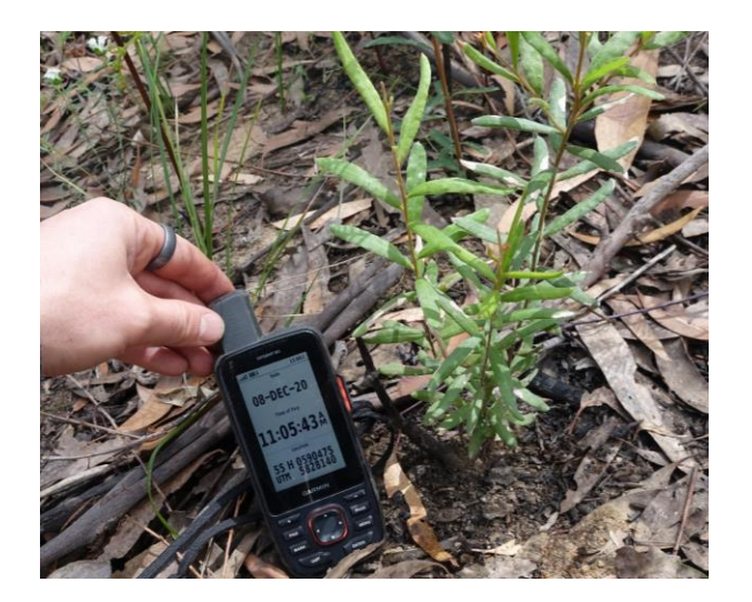
Results 2 . Some photographs taken of Grevillea celata plants from the flora survey on 08/12/20 showing the GPS locations in the frame.