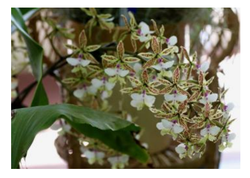
Epi. stamfordianum - Judy