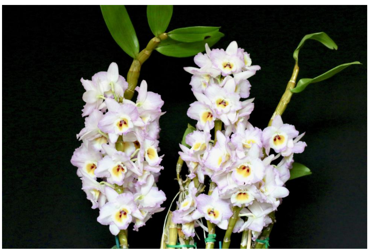
Judges Choice - September - Dendrobium Pink Doll 'Elegance'.

This plant was purchased from J&V Dens in 2010 and is a plant well worth growing.