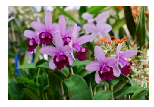
C. intermedia - Tom B.