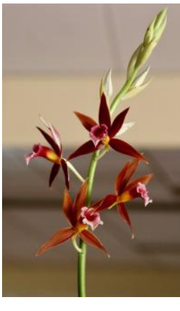
Phaius tankervilleae