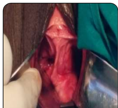
Figure 1: On examination: uterus was 12 weeks size, soft cervix, longitudinal vaginal septum was seen

PAPER: Mrs. X, 25 yr old, a resident of K R nagara presented as P2L2 with 2 previous LSCS, sterilized 2 years back, with 2 months of amenorrhea.