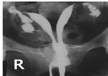
Figure 4: HSG image of uterus didelphys