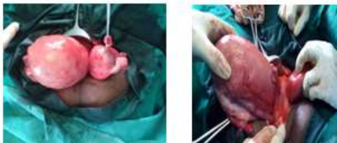
Figure 2A: axial view of the two uterine bodies Figure 2B: a septum separating the two