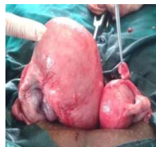
Figure 2: Pregnancy was found in the left horn

Conceived 2 yrs later. The lady continued her present pregnancy till term and underwent cesarean section, delivered a 1.9 kg term IUGR female baby, with concurrent sterilization. post-operative period uneventful. Both the mother and the baby were healthy.