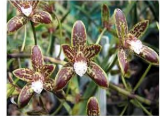
Cymbidium canaliculatum 'Esk'