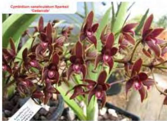
Cymbidium canaliculatum sparksii 'Cedarvale'