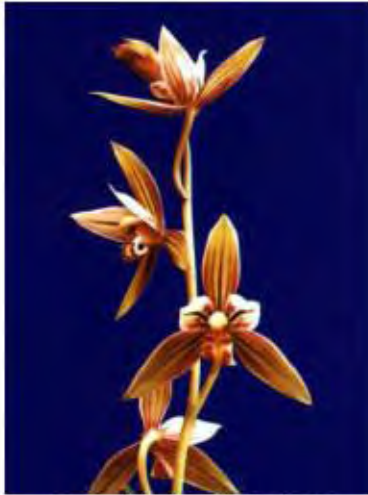
Cymbidium ensifolium (Si Ji Lan)

One of the "Chinese" cymbidiums, this species is prized in Asia and has proven to be an important parent in hybridizing. The scape is between 6 & 26 inches (15 and 67 cm) with 3 - 9 strongly-scented flowers. The flowers are 1.2 - 2 in. (3 - 5 cm) and variable in color. The species is found at 1000' to 6000' (300 m to 1800 m).