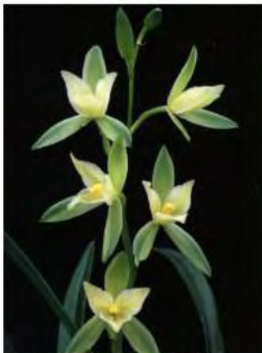
Cymbidium ensifolium (Kuan Yin Su Xin)