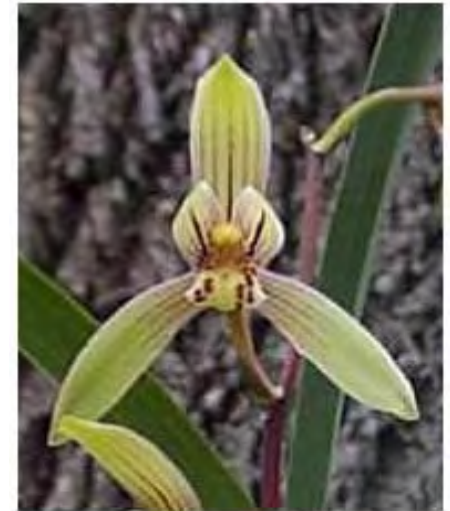
Cymbidium ensifolium (Yu Hua)