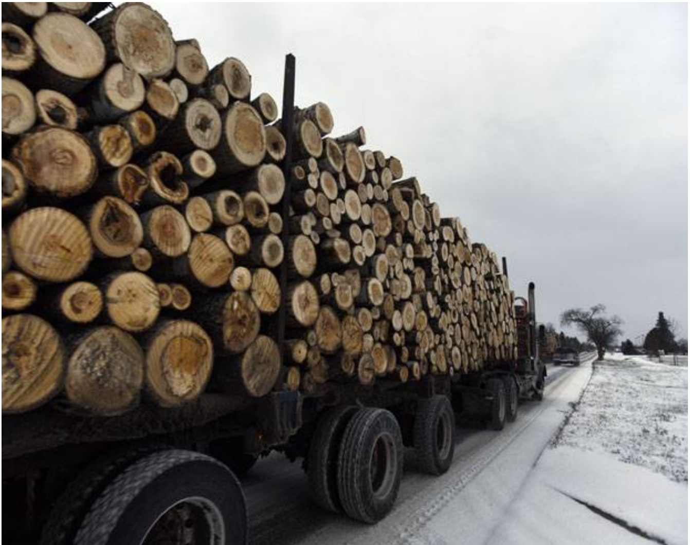
Logging trucks hauling logs roll through Fort Frances, Ont., in 2014. Parts of Ontario’s forests are sprayed with the herbicide glyphosate to keep unwanted plants from hindering early growth for coniferous trees, which are

“Herbicides destroy the interdependent balance of all life, which is the core philosophy of the Anishinabek,” says the letter. “We do not want to collect medicines from our lands that might have been affected, hunt animals that consumed plants that have been poisoned, nor do we want to fish in water that have been contaminated by herbicides.”