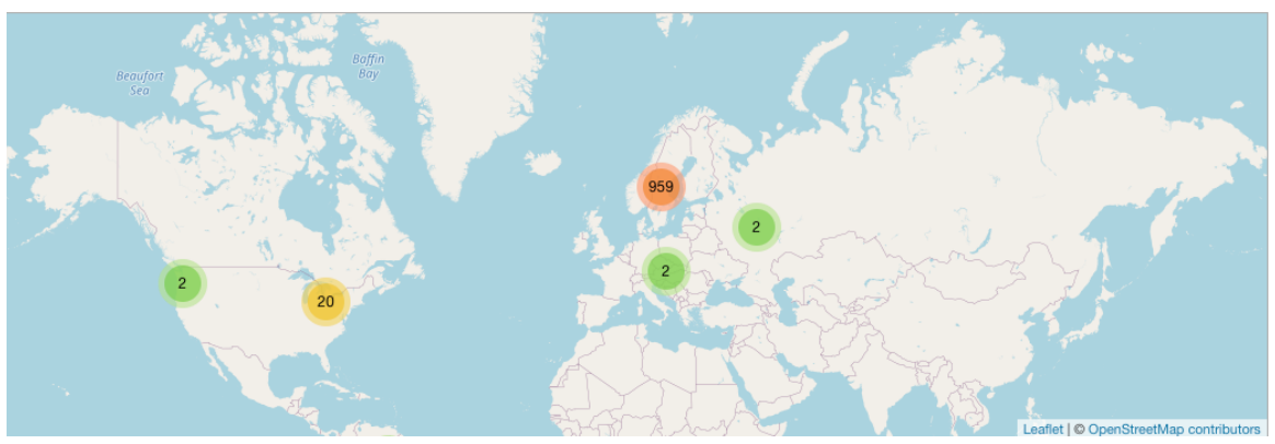
Figure 3: Map of known Gloiodon species distribution (Encyclopedia of Life)iii

"Gloiodons" are already known to be quite rare. One will not find references to them in even the best mushroom handbooks. Figure 1 which illustrates a classic Texan Sabal Palmetto might seem spurious, however it can help one understand the classic description of the genus, and its association with palmettos. Gloiodons "have resupinate to effuso reflexes or hat-like, brownish fruiting body with a prickly hymenophore." In other words, as in Figure 2 , like palmettos Gloiodons have a brushy brown cap/canopy with fibres pointing up or down. They are a toothed fungus in which the hymenium consists of spines that resemble palmetto fronds pointing down. This genus was originally described by the Finnish mycologist Peter Karsten in 1879. As a tooth-fungus it was originally grouped with the Hydnum genus, which includes the ever popular (edible) Hydnum washingtonianum (formerly H. repandum) , hedgehog mushroom. Unlike some Hydnums, Gloiodons are not edible.)