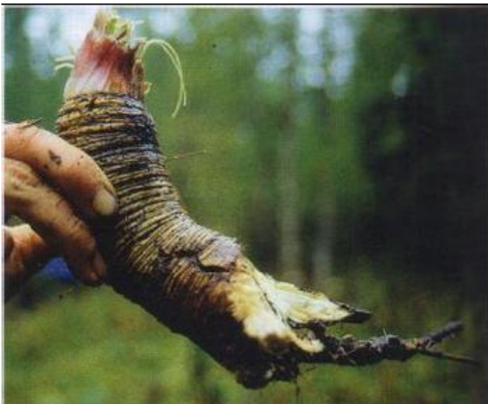
Figure 1. Root of A. archangelica L. (Forsnäs Hemman och Malmogajuddens gård 2009a).

Described as a large perennial herb with an upright stem with sometimes purple features which can reach up to 300 cm in gardens (Hegi & Beger 1926, Lindholm 2003), and from 50–100 cm in wild habitat (Nyman 1980, Thurzová 1983, Starý & Jirásek 1999, Mossberg & Stenberg 2003). During the period of growth A. archangelica is giving off a pleasant scent that is unusual and is distinguishing for the plant. Both the upper part of the plant and the roots are fragrant with this special scent. Roots are turnip-shaped (napiform) in wild habitat and shorter and with more adventitious roots in conventional growing (Hegi & Beger 1926). Moreover roots are thick (see fig. 1) and heavy (Hegi & Beger 1926, Grieve 1979, Nyman 1980, Sandberg & Göthberg 1998) and internal flesh is yellow to white and with a yellowish milky sap (Hegi & Beger 1926).