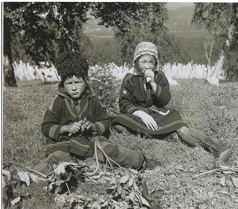
Figure 4. Sami children from Umby, Tärnafjällen, eating and taking care of harvested Angelica archangelica ssp. archangelica (Forsnäs Hemman och Malgomajuddens gård 2009b).

Nyman (1980) notes that Angelica archangelica was used as a culinary delicacy by the Sami, especially young stalks eaten as a dessert or raw on wanderings in the Scandinavian Alps (see fig. 4). It was also used as a substitute for tobacco (Nyman 1980), where the particular smoke of the plant is said to keep away the wolves. Also Swedes and Norwegians smoked A.archangelica during times when tobacco was hard to get hold of (Ljungkvist 2007). Linné describes how much the Sami appreciated the stalks, and how they pulled off the outer parts of the stalk before eating it. Linné himself was found of the plant (Linné 1986).