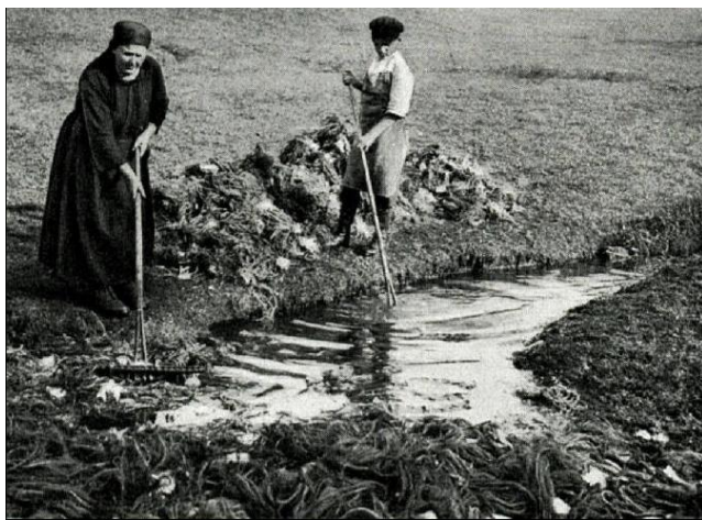
Figure 5. Washing harvested A.archangelica roots in a brook in Bockau (Heeger 1989).

After leaf and/or root harvesting washing of A.archangelica is carried out (Heeger 1989 & Bomme 2001). In Bockau (Germany) during the 1950s, washing was made direct in the brook at the field as seen in fig. 5 (Heeger 1989). Since then, a lot has happened and other methods have been developed.