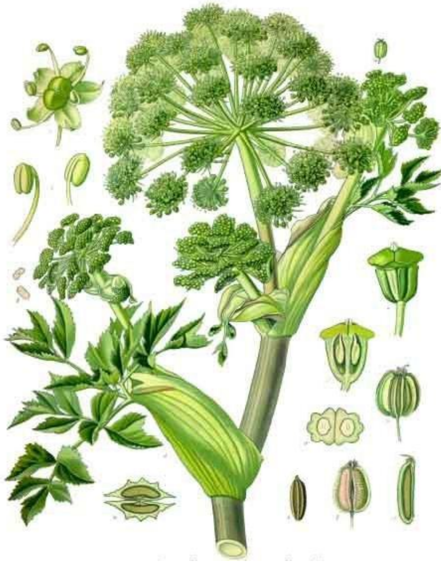
Figure 2. Illustrated A. archangelica from Köhler's medicinal plants (1887).

The flowering period is during July–August (Hegi & Beger 1926, Starý & Jirásek 1999, Mossberg & Stenberg 2003). Yellow fruits are matured from the flower (Hegi & Beger 1926, Grieve 1979). There are two subspecies distributed in Sweden, A.a. subsp. litoralis and A.a. subsp. archangelica (Ljungkvist 2007). They mainly differ in taste quality, where A.a. subsp. litoralis has a more pungent taste than the milder subsp. archangelica (Tutin 1968, Nicolaisen 1980). Differences can also be seen on the fruit. Fruits size in subsp. archangelica is 5–6 x 4–5 mm, fruit being almost oblong. The dorsal ribs are prominent and acute, but in subsp. litoralis the dorsal ribs are not prominent. The size of the fruit is also smaller, 5–6 x 3.5–4.5 mm (Hegi & Beger 1926, Tutin 1968). The chromosome number is 2n=22 (Tutin 1968).