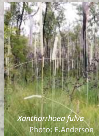
Xanthorrhoea fulva