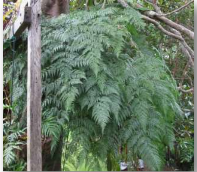
Same pot of Davallia denticulata February 2016

The basket ferns in the genus Drynaria have now shed their leaflets. We cut the old stalks off as they don't shed these. The new fronds are just beautiful.