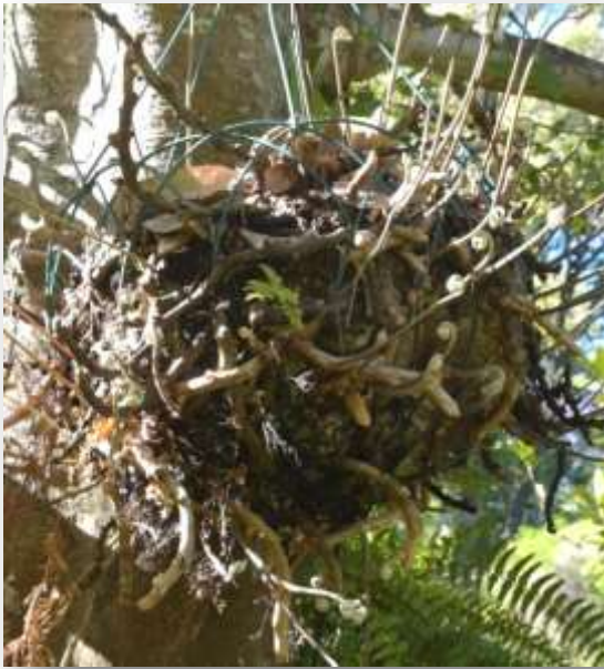
Davallia denticulata October 2016

Our hanging basket of Davallia denticulata has lost all of its old fronds and is preparing for a new start with the thick, white, hairy rhizomes exploring in all directions. Once the fronds grow, these rhizomes will be totally hidden.