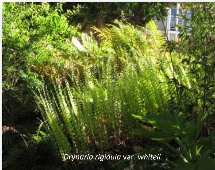
Drynaria rigidula var. whiteii

The basket ferns in the genus Drynaria have now shed their leaflets. We cut the old stalks off as they don't shed these. The new fronds are just beautiful.