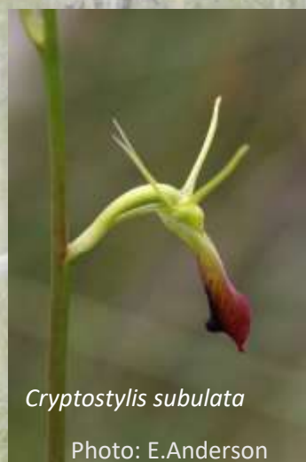
Cryptostylis subulata