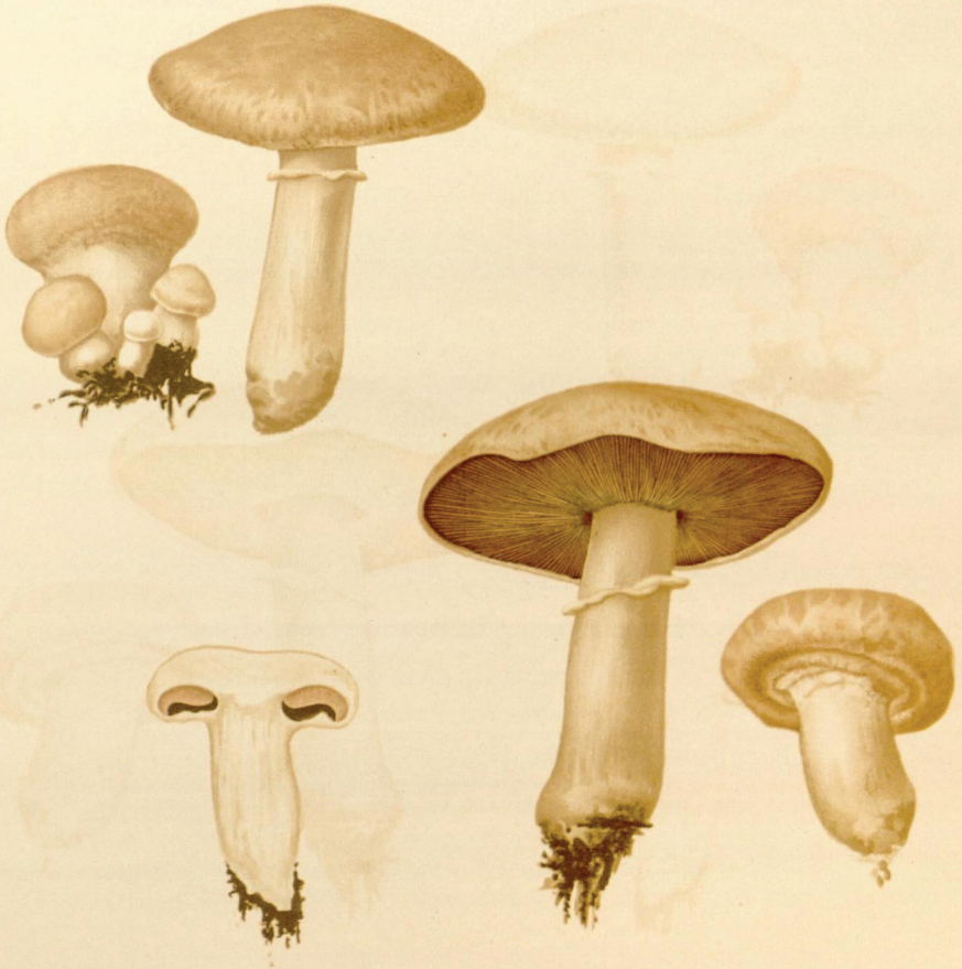
Agaricus bisporus by William Gilson Farlow.

On the occasion of the 40th anniversary of the founding of the Vancouver Mycological Society