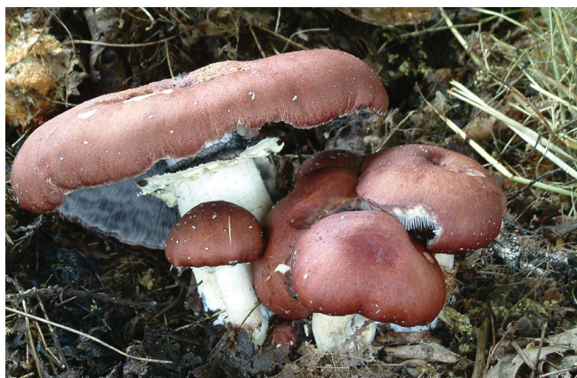
The Garden Giant Stropharia rugosoannulata in compost mulch

Fungi have great potential to clean up chemical or microbial contamination and as bio-control agents to limit weeds and pests or diseases of plants and animals. Mycorrhizal fungi enhance plant growth and vigour and methods of inoculating plants with mycorrhizal fungi are now widely used in agriculture and silviculture.