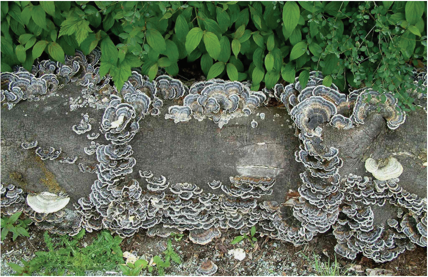
Turkey-tail Trametes versicolor inoculated log at Beaty Museum UBC

Mycorestoration is the latest catch-word in the mushroom cultivation world. This refers to strategically incorporating fungi into damaged landscapes to restore and enhance ecosystem functioning. The term was introduced and popularized in Paul Stamets' 2005 book Mycelium Running: How mushrooms can help save the world , along with mycofiltration, mycoforestry, mycoremediation and mycopesticides. But these mycoconcepts are not all new. In 1981 Hellmut Steineck published Pilze im Garten , later published in English as Mushrooms in the Garden in 1984, which described how to incorporate edible and interesting mushrooms into home gardens.