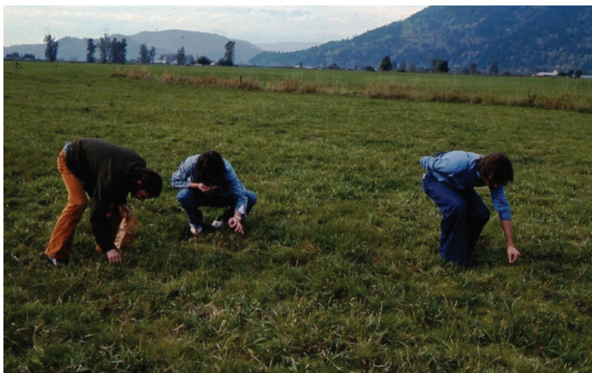
Picking Liberty Caps in Fraser Valley 1977