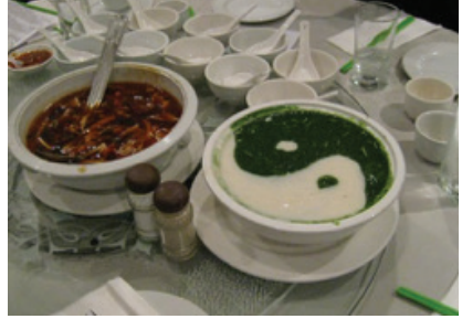
Hot & Sour and Tai Chi soup with Agaricus , Shiitake, Wood-ear and Enokitake

It's a different world of food from the time of 'steak and mushrooms' when only Agaricus buttons were available and canned Money's Mushrooms were served in Chop Suey houses or found as toppings on pizzas (in 1950s pizza was considered an exciting new exotic 'foreign food'). Cultivation of a variety of mushrooms has helped diversify modern cuisine and it's much more interesting now. "What food these morsels be!" indeed; many more mushrooms really do make meals marvellous.