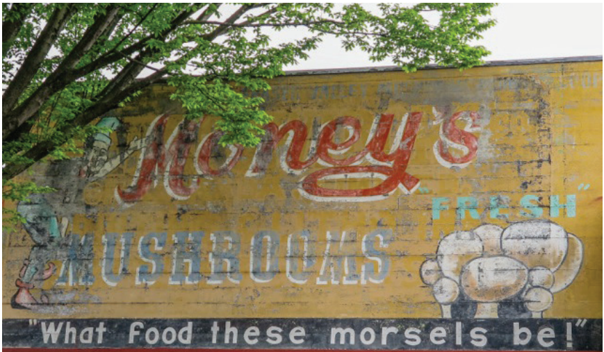
Old advertising mural on Prior Street

Cultivation was focused on strains of Agaricus harvested young in mass production because white tightly unopened little button mushrooms retain better texture and have more appealing appearance after canning. Prior to the canneries mushroom crops were often harvested just as their caps were opening and delivered fresh to market for immediate consumption with dark gills and deep earthy aromas. Modern agriculture’s industrial mass production and processing had made mushrooms bland and boring.