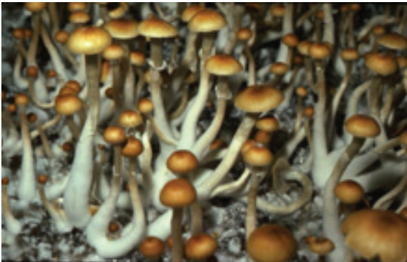
Magic Mushrooms Psilocybe cubensis growing from grain trays in 1977

With introduction of new culture technologies and with a variety of new species available to grow a new hobby was also born, the home cultivation of mushrooms. In early 1970s small scale techniques for growing magic mushrooms were developed for the tropical Psilocybe cubensis and growing "shrooms" became a popular counter-culture hobby. Today most magic mushrooms consumed are cultivated not wild.