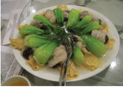
Po Kong "Bamboo pith rolls" Stinkhorn stems stuffed with Shiitake and Enoki

variety of delicious dishes featuring more than a dozen different kinds of cultivated mushrooms.