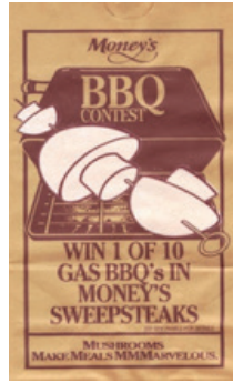
Money's bag 1990

The importation of much cheaper canned mushrooms from abroad, especially from China, had meant that selling their entire mushroom crop fresh was essential to BC producers. By 1985 73% of canned mushrooms consumed were imported from overseas and farmers could no longer afford to grow mushrooms for canning.