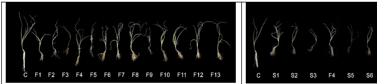
Figure 1. Disease severity of garlic basal rot and white rot diseases on Baladi cultivar.