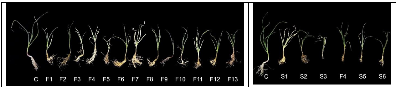
Figure 2. Disease severity of garlic basal rot and white rot diseases on Sides 40 cultivar.