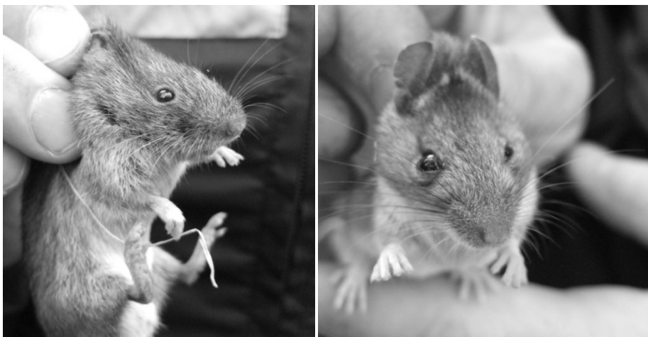
Left: bank vole