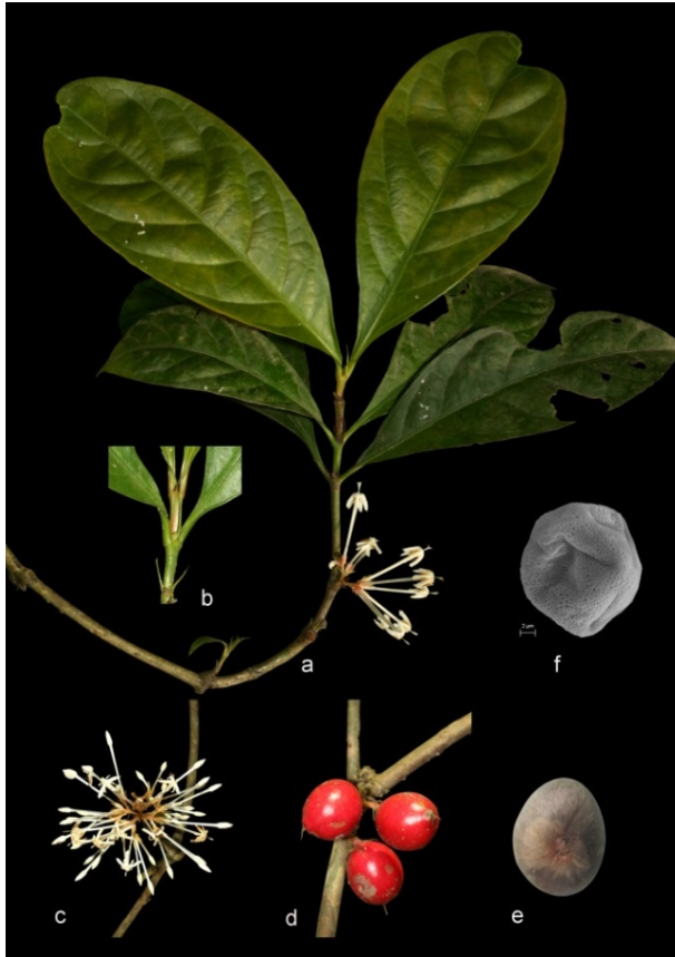
Fig. 2. Ixora longibracteata Bremek. A: Flowering-twig. B: Close-up of stipule. C: Inflorescence. D: Ripe fruits. E: Seed. F: SEM photograph of pollen.

apically, ca. 2 mm long, dark-coloured. Drupes subglobose or ellipsoid, 10–11 mm across, circular scar at apex with erupted centre and remnants of calyx lobes; pericarp ca. 2 mm thick, succulent, glabrous, shiny, pale green when young, turning red when ripe; seed 1, ovoid, with a scar of point of attachment, 8.5\text{--}9 \times \text{ca. } 7 mm, smooth, grey-brown.