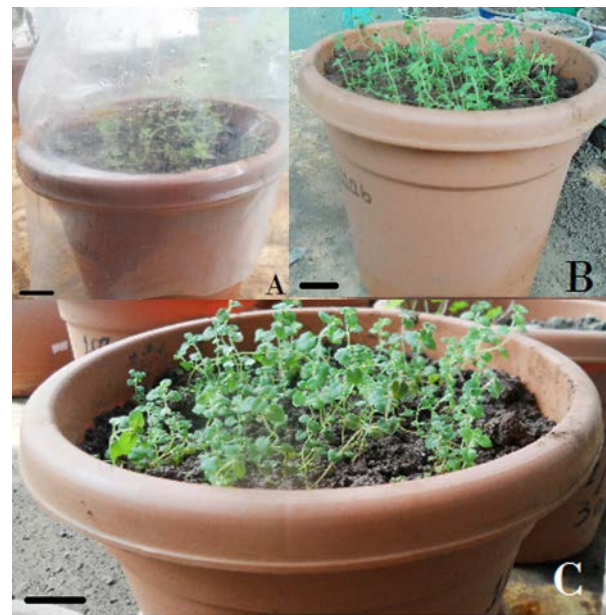
Fig. 4. Ex vitro acclimatization of S. punctata . A. 10-day-old, B. 20-day-old, C. 30-day-old. Bars = 2 cm.

shoot and shoot length at p < 0.05. The shoot induction efficiency of BAP was better than KIN in this taxon. From this result, BAP was more powerful in the stimulation of new bud development. Similar results were reported on different plants including Sida