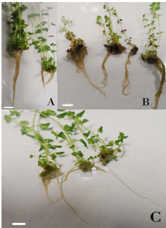
Fig. 3. In vitro rooting of S. punctata . A. 1.0 mg/L IBA, B. 0.25 mg/L NAA, C. 0.25 mg/L IAA. Bars = 2 cm.

Means within columns having different letter(s) are significantly different at p < 0.05. Data are presented as mean ± SE.