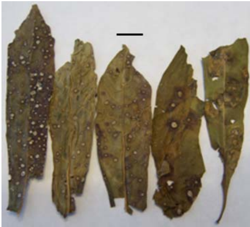
Fig. 1. Clerodendrum indicum Kuntze leaves with subglobose spots of rust. Bar = 1.5 cm.