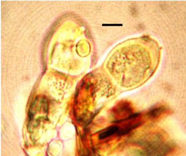
Fig. 3. Puccinia reynoldsii – Young developing teliospores. Bar = 30 \mu m

oblique affixo, attenuato, simplici, hyalino; mesosporae 25-30 \times 20-25 \mu m, unicellulae.