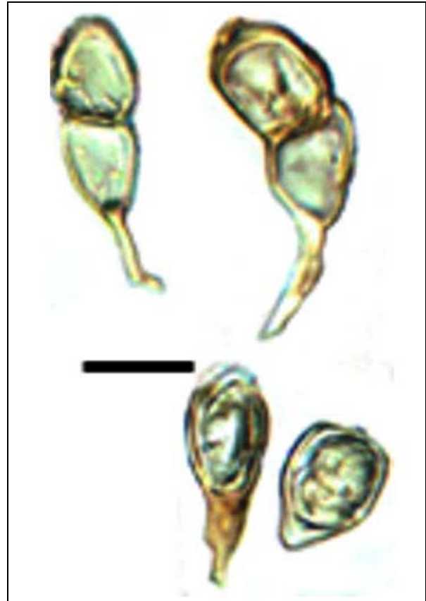
Fig. 4. Puccinia reynoldsii – Teliospores and mesosporae. Bar = 30 \mu m.

Puccinia reynoldsii sp. nov. produces mesosporae