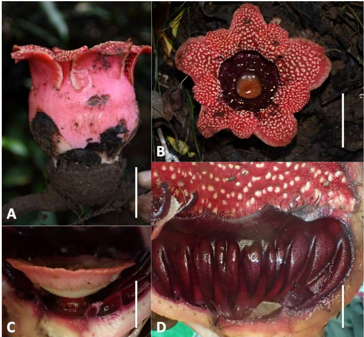
Fig. 4. Sapria himalayana f. albobinosa (female flower). A: Side view of flower. B: Fully opened, slightly senescent flower from the top. C: Central column and bowl-shaped disk. D: Inner surface of perigone tube (central column removed). Scales: 5 cm for A and B; 2 cm for C and D. Photographs: N. Tanaka (Tanaka et al. 2013).

Specimen examined: MYANMAR. Chin State: north of Matupi, along the Hakka road, between Matupi and Hakka, Matupi Township, 21°58'42.06"N, 93°24'53.87"E, 1350 m elev., 25 November 2017, Nobuyuki Tanaka, Shinobu Akiyama, Mu Mu Aung & Aung Khaing Win 2813 (RAF, TNS).