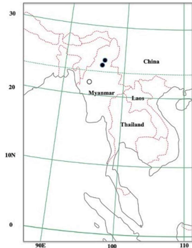
Fig. 3. Distribution of Sapria myanmarensis (●) and S. himalayana f. albovinosa (○) in Myanmar.