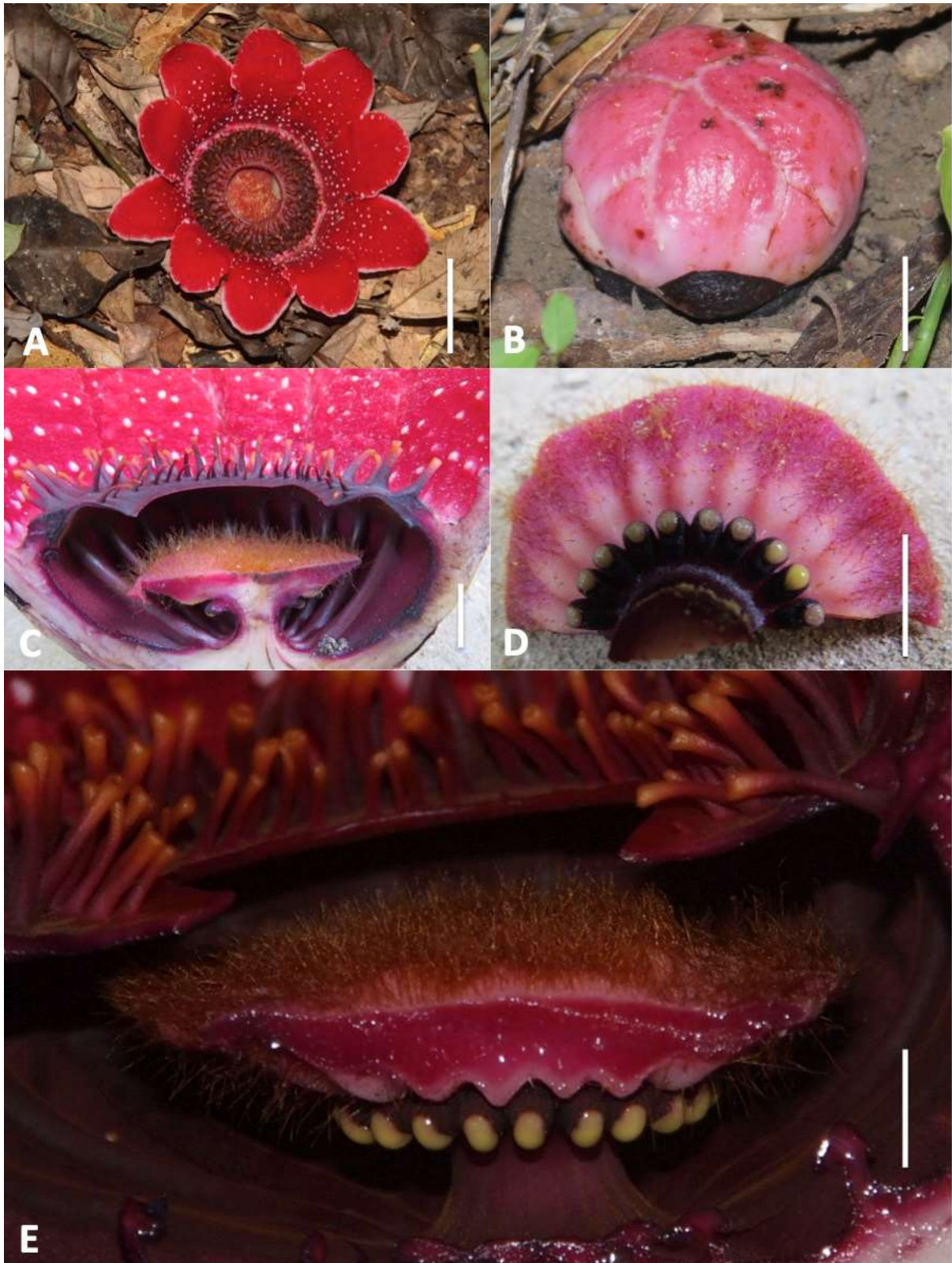
Fig. 2. Sapria myanmarensis (male flower). A: Fully opened flower. B: Flower bud. C: Longitudinal section of flower. D: Central column viewed from the bottom showing stamens. E: Side view of central column and a tangential section of the disk from a flower bud. Scales: 3 cm for A and B; 1 cm for C, D and E.