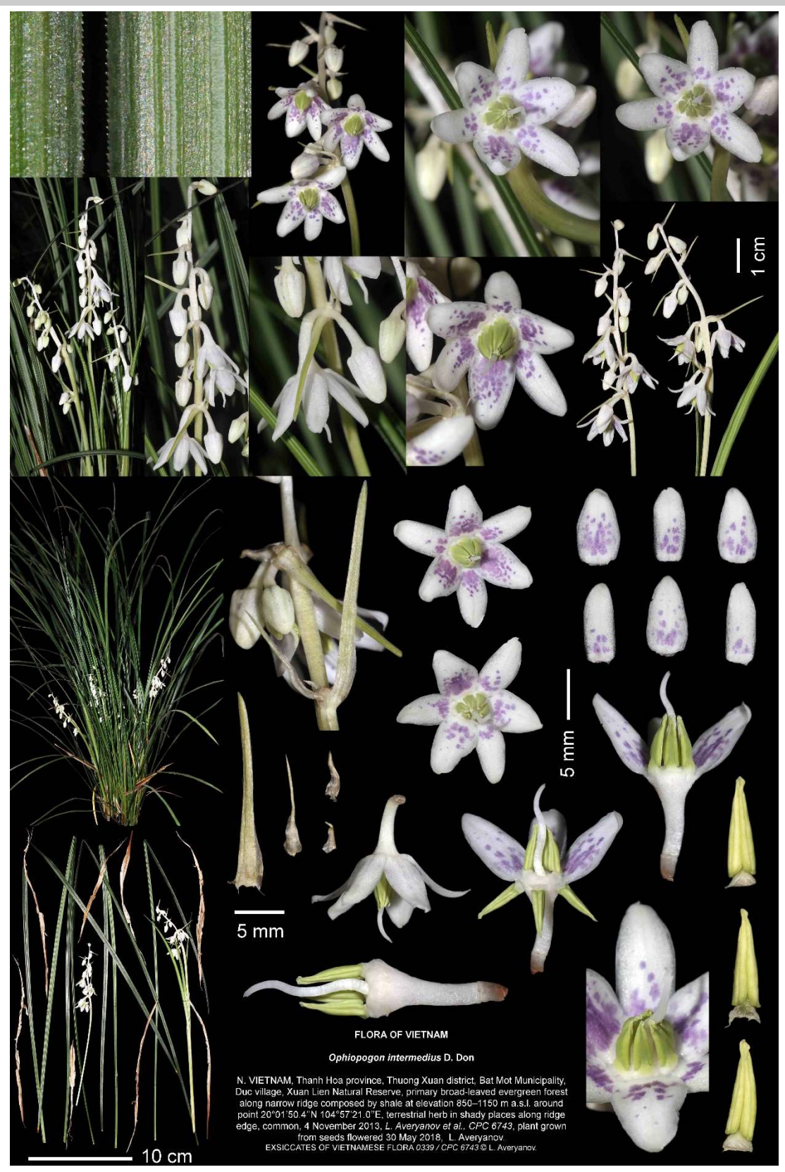
Fig. 3. Ophiopogon intermedius D. Don. Analytical plate "d-EXSICCATES OF VIETNAMESE FLORA 0339 / CPC 6743" compiled from photos taken prior to the preparation of herbarium specimen, CPC 6743 (LE LE01048621).