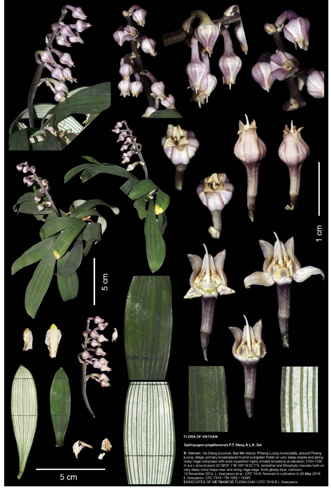
Fig. 5. Ophiopogon pingbienensis F.T. Wang & L.K. Dai. Analytical plate "d-EXSICCATES OF VIETNAMESE FLORA 0340 / CPC 7419" compiled from photos taken prior to the preparation of herbarium specimen, CPC 7419 (LE LE01048627). Photos, correction and design by L. Averyanov and T. Maisak.