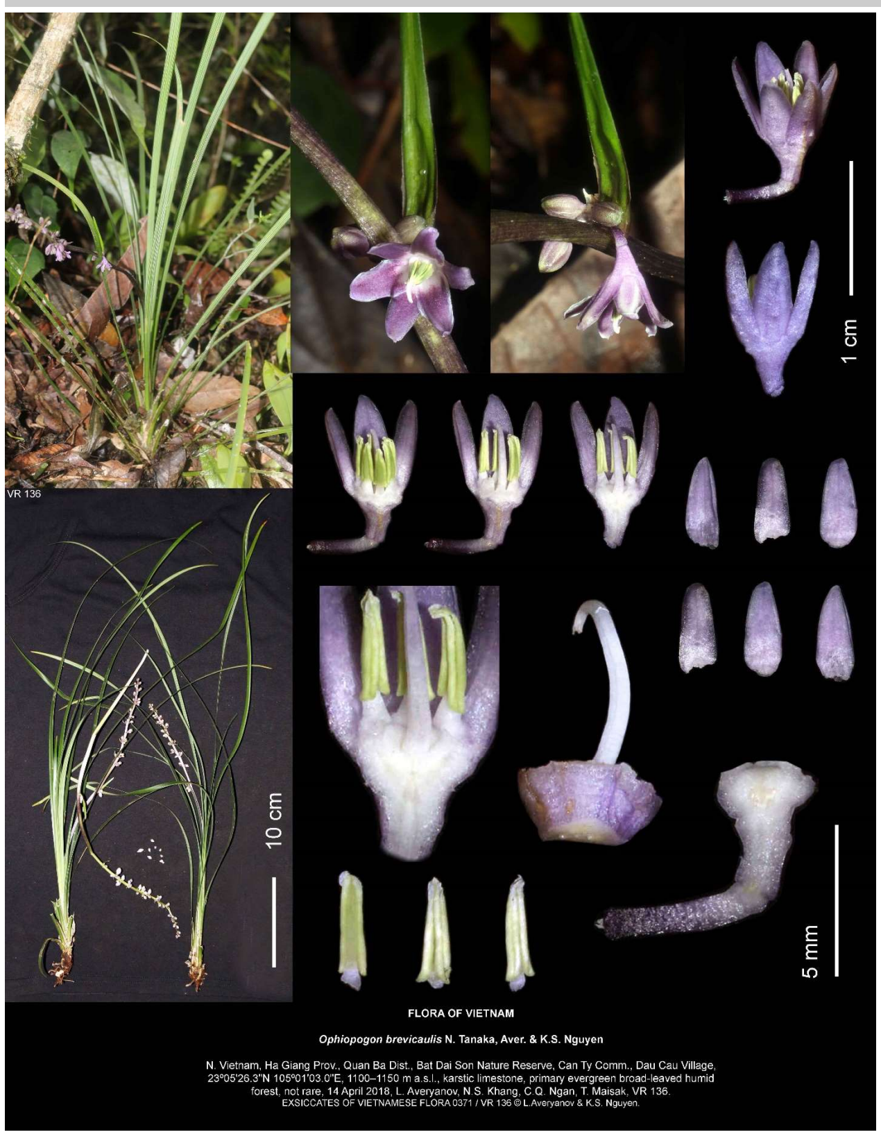
Fig. 1. Ophiopogon brevicaulis N. Tanaka, Aver. & K.S. Nguyen, sp. nov. Analytical plate "d-EXSICCATES OF VIETNAMESE FLORA 0371 / VR 136" compiled from photos taken prior to the preparation of the type specimens, VR 136 (LE01048851, LE01048856, LE01054450). Photos by K.S. Nguyen and L. Averyanov, correction and design by L. Averyanov.