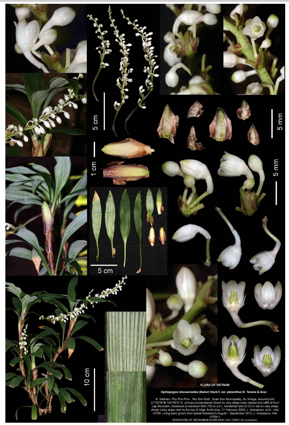
Fig. 2. Ophiopogon dracaenoides (Baker) Hook. f. var. pleianthus N. Tanaka & Aver., var. nov. Analytical plate "d-EXSICCATES OF VIETNAMESE FLORA 0370 / HAL 12709.1 " compiled from photos taken prior to the preparation of the type specimen, HAL 12709 (LE LE01049347). Photos, correction and design by L. Averyanov.