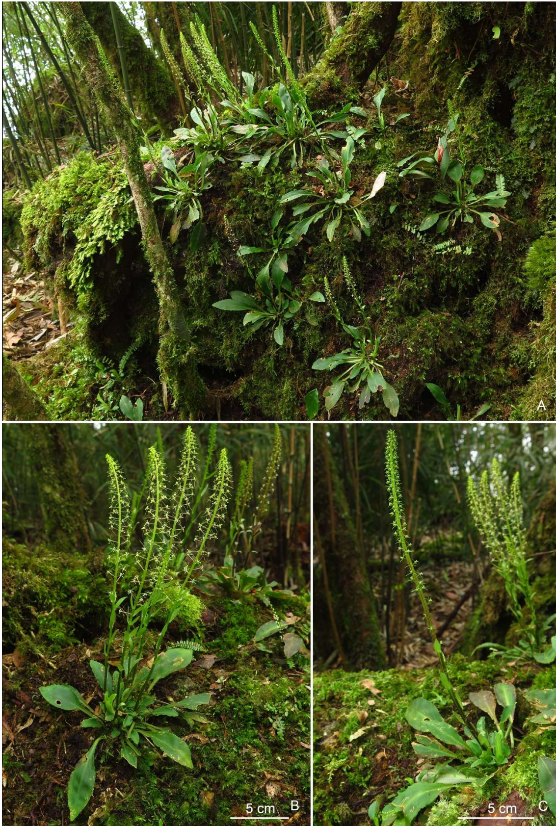
Fig. 1. Chamaelirium jiuwanshanense . A: Habitat. B: Male plant habit. C: Female plant habit.