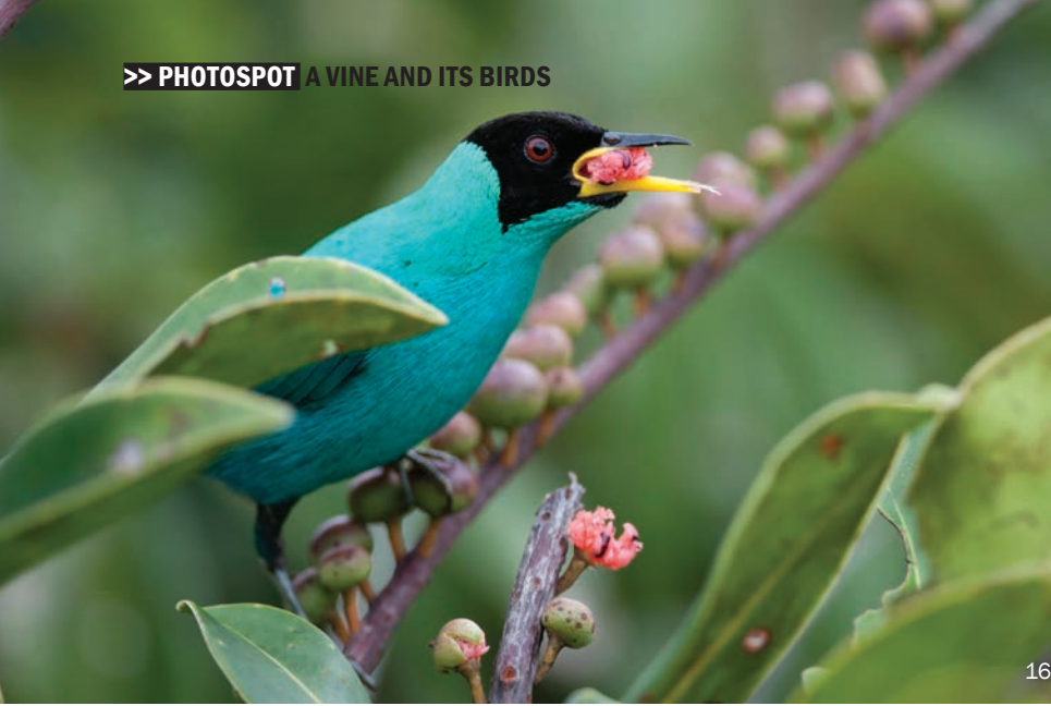
16 Male Green Honeycreeper Chlorophanes spiza , May 2011.