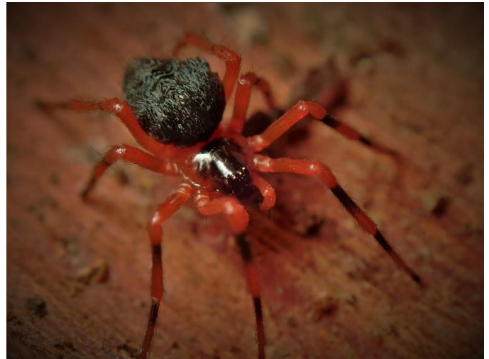
Nicodamidae species, Litodamus hickmanii photographed near Growling Swallet