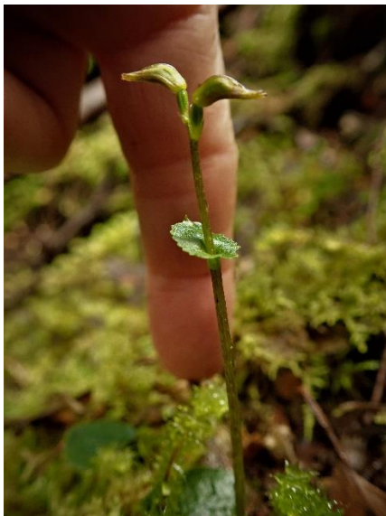
Townsonia viridis , Beech orchid