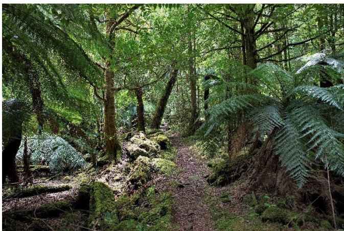
The track follows the route of the old Frodshams track here.