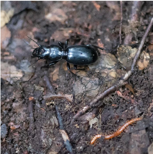
Found under a log!