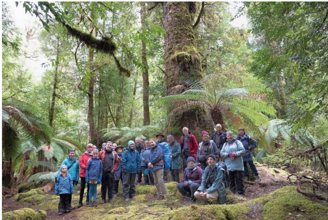
The group assembled at an enormous old myrtle tree at the point where the current track meets the old Frodshams track.

before we got there. We wended amongst the dripping lichens and massive tree bases and boles until we were walking beside a distinct, but strangely dry and silent, river bed.