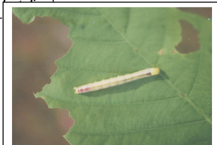
Fig 4b. Larva of Paectes subapicalis

Most of the species listed above are common to very common in status. The study needs further taxonomical work including their status because a large number of species like teak defoliator and skeletonizer, which are seen by the project leader, are missing from the reports published by Zoological Survey of India as well as by other investigators. Further, out of 128 species of butterflies listed under schedules as per Wildlife (Protection) Act, 1972 (Anon, 1992), the nymphalid, Hypolimnas bolina (Linn.) and H. misippus Linn., are common to least concern in status and Charaxes fabius cerynthus Fruhstor, as a common species of Achanakmar- Amarkantak BR ( Singh and Chandra, 2006). Its allied sub species C. fabius sulphureus Roth, which is naturally distributed in Assam, is rare in occurrence (Evans, 1932). It is protected by being kept under schedule II of the Wildlife Protection Act, 1972 (Anon., 1992). Similarly, Phaedyma columella (Cramer) is a common species recorded from Achanakmar (Singh and Chandra, 2006). Its subspecies P. columella birghami