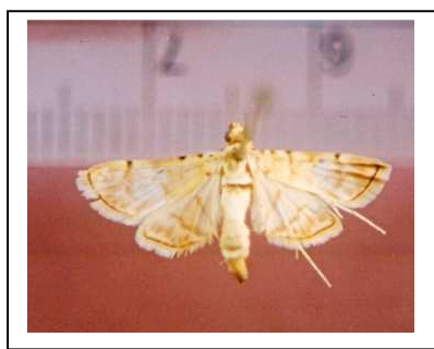
Fig 3. Moth of Dichrocrocis

Length of male varies from 12-15 mm where as female is 15 mm. The wing span is 28-30 mm in male and 30-36 mm in female. Antennae in male are with very short branches on the outer side. Dark fuscous grayish brown moth with FW double dark antemedial line incurved below the cell and minute very indistinct orbicular and reniform spots, an obscure waved medial line, a double post medial line highly angled outwards beyond the cell and a chocolate patch beyond it on the costa; traces of a pale waved sub-marginal line along with a lunulate marginal line. HW with pale basal area. Abdomen with a long tubular anal tuft. Sample deposited at TFRI vide Accession No. 564. Distribution: Jagatpur, Kabirchabutara. Host: Shorea robusta . Date of collection: 17.06.1998.