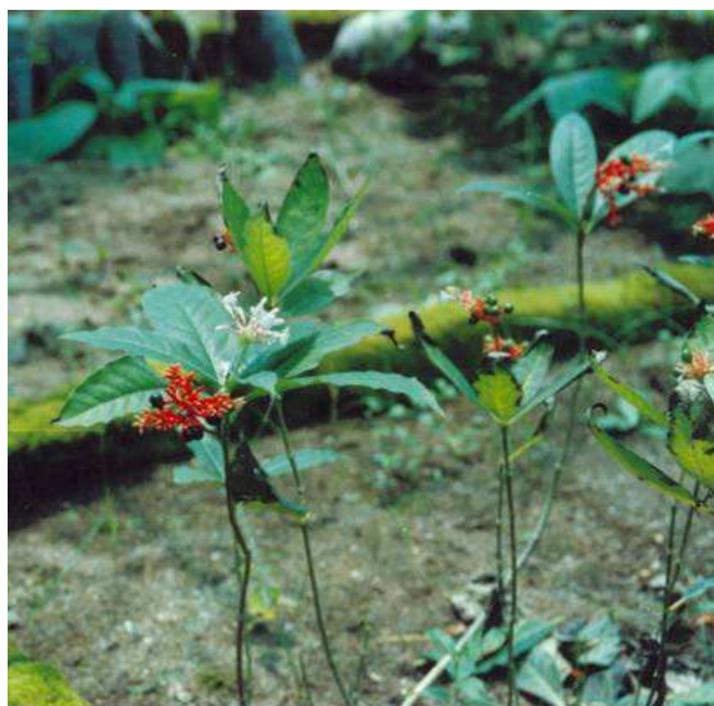
Fig 2. Critically endangered plant, Rauwolfia serpentina