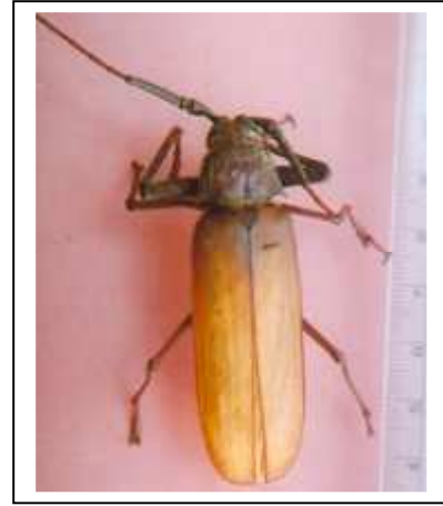
Fig 6. Macrotoma fisheri

Thus, there are 26 species of beetles belonging to 16 genera under two families of beetles. The gathered information from various sources still appears incomplete, due to lack of identity of many species of beetles belonging to the family Anthribidae, Bostrychidae, Cerambycidae, Chrysomelidae, Cantheridae, Scolytidae, Curculionidae, Coccinellidae, Elateridae, Platypodidae, etc.