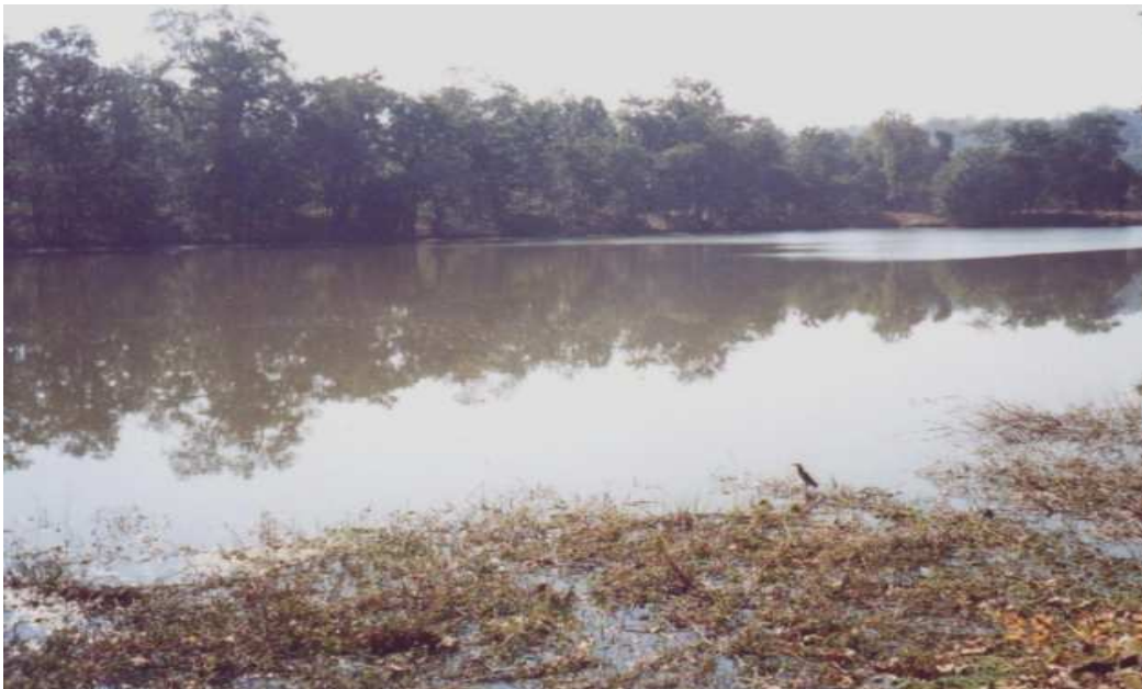
Fig 8. Siha wal sagar lake