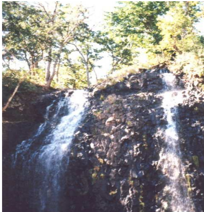
Fig 10. Rakshasakh Waterfall