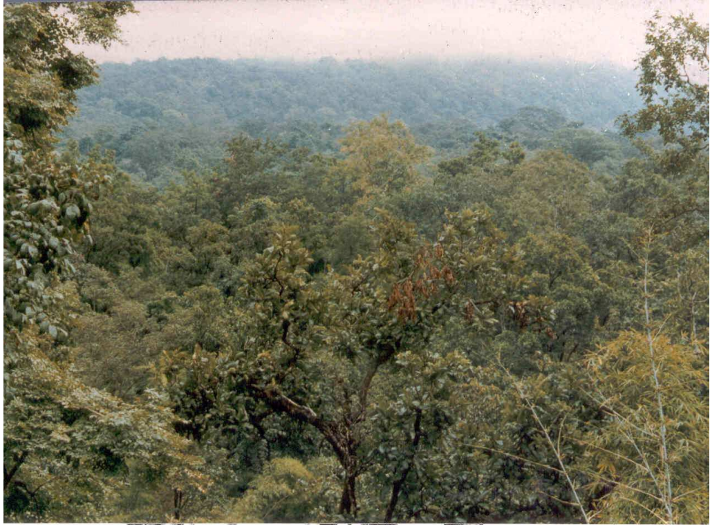
Fig 9. Natural scenic view at Amarkantak