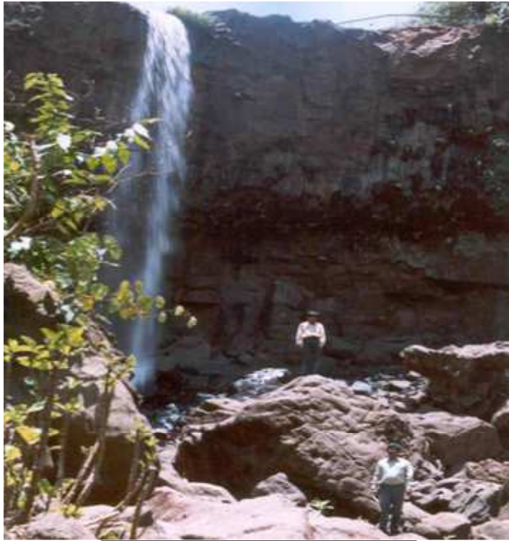
Fig 7. Kapildhara Waterfall