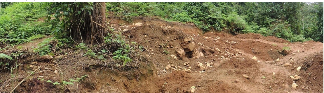
Fig. 3. Photos showing typical forest from each inventory site.