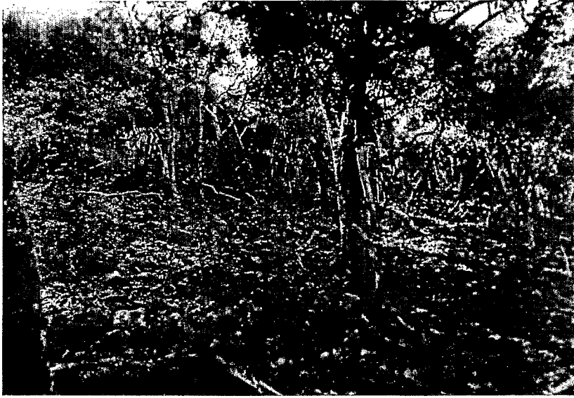
Figure 4. The sclerophyll forest patch on Leprédour Island where the extinct Pittosporum taniaum occurred. The absence of regeneration because of grazing by introduced deer and rabbits is evident from the ground bare on most of the island, a 'protected' area.

propagation was attempted by cuttings, but this failed. During a later visit to Leprédour in 1992, it was found that one plant had died as soil had eroded away around the tree. The second plant died between June 1992 and July 1993 from unknown causes.