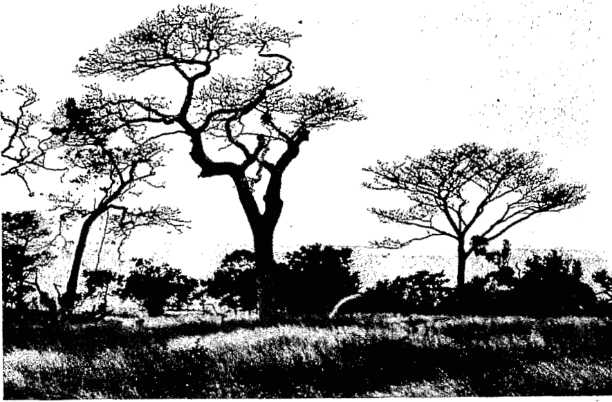
Figure 2. View of cleared sclerophyll forest. Only a few canopy trees have been retained to provide shade for cattle, but these are now very vulnerable to cyclones. Grazing by cattle prevents regeneration. The canopy trees are Terminalia cherrieri , endemic to the Poya area on the west coast of New Caledonia, where about 500–1000 specimens remain.

when vast stretches of Acacia bush were destroyed. The edges of the remaining sclerophyll forests there (one of the largest remaining fragments, occupying several hundred hectares) were damaged as well, making the forest still more vulnerable to border effects. Except in the greater Nouméa area, bush fires are not controlled and may burn for weeks in the sparsely inhabited hills, causing extensive damage to alien and native plant formations.