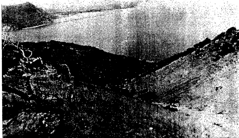
Figure 3. View of Leprédour and nearby Ducos islands, SW New Caledonia. Despite its very restricted extension, this dry forest remnant has considerable botanical interest. The foreground on Leprédour Island and the background on Ducos Island are completely deforested and occupied by introduced grasses.

and Parc Forestier of planted introduced trees and some cover of disturbed dry forest. The endemic beetle Stethorus proximus is so far only known from Ouen-Toro (Chazeau, 1979).