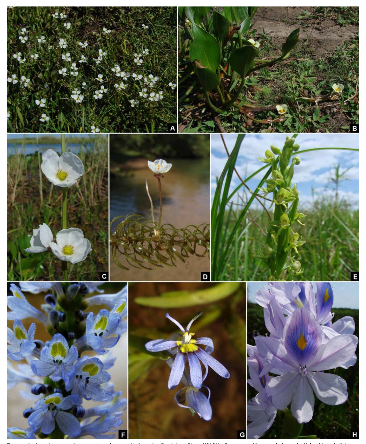
FIGURE 4. Aquatic macrophyte species photographed at the Pandeiros River Wildlife Sanctuary: Monocotyledons. A. Helanthium bolivianum (Alismataceae), B. Sagittaria rhombifolia (Alismataceae), C. Echinodorus paniculatus (Alismataceae), D. Egeria najas (Hydrocharitaceae), E. Habenaria repens (Orchidaceae), F. Pontederia cordata (Pontederiaceae), G. Hydrothrix gardneri (Pontederiaceae), H. Eichhornia crassipes (Pontederiaceae).