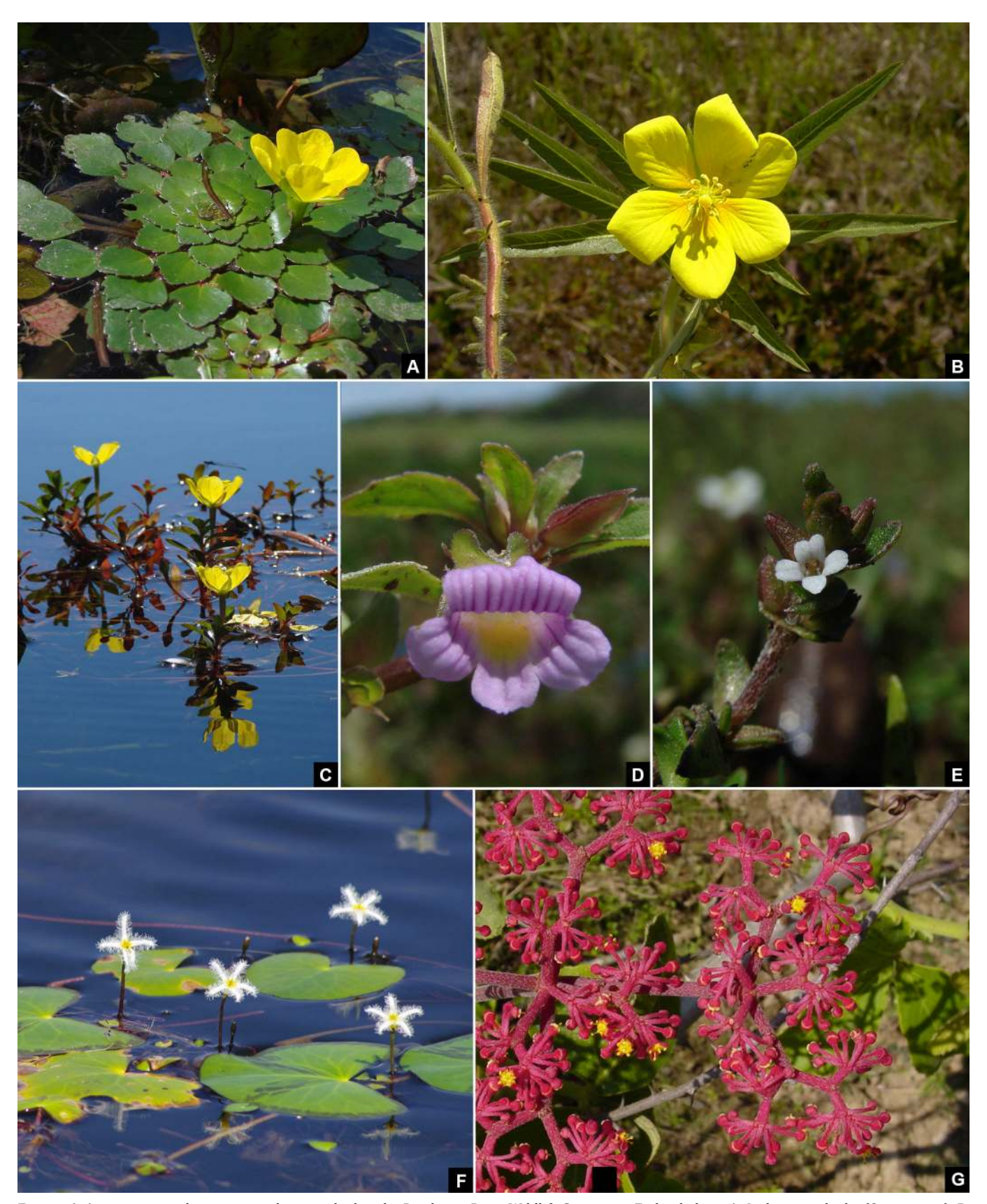
FIGURE 6. Aquatic macrophyte species photographed at the Pandeiros River Wildlife Sanctuary: Eudotyledons. A. Ludwigia sedoides (Onograceae), B. Ludwigia leptocarpa (Onograceae), C. Ludwigia inclinata (Onograceae), D. Cuphea racemosa (Lythraceae), E. Bacopa monnierioides (Plantaginaceae), F. Nymphoides indica (Menyanthaceae), G. Cissus spinosa (Vitaceae).