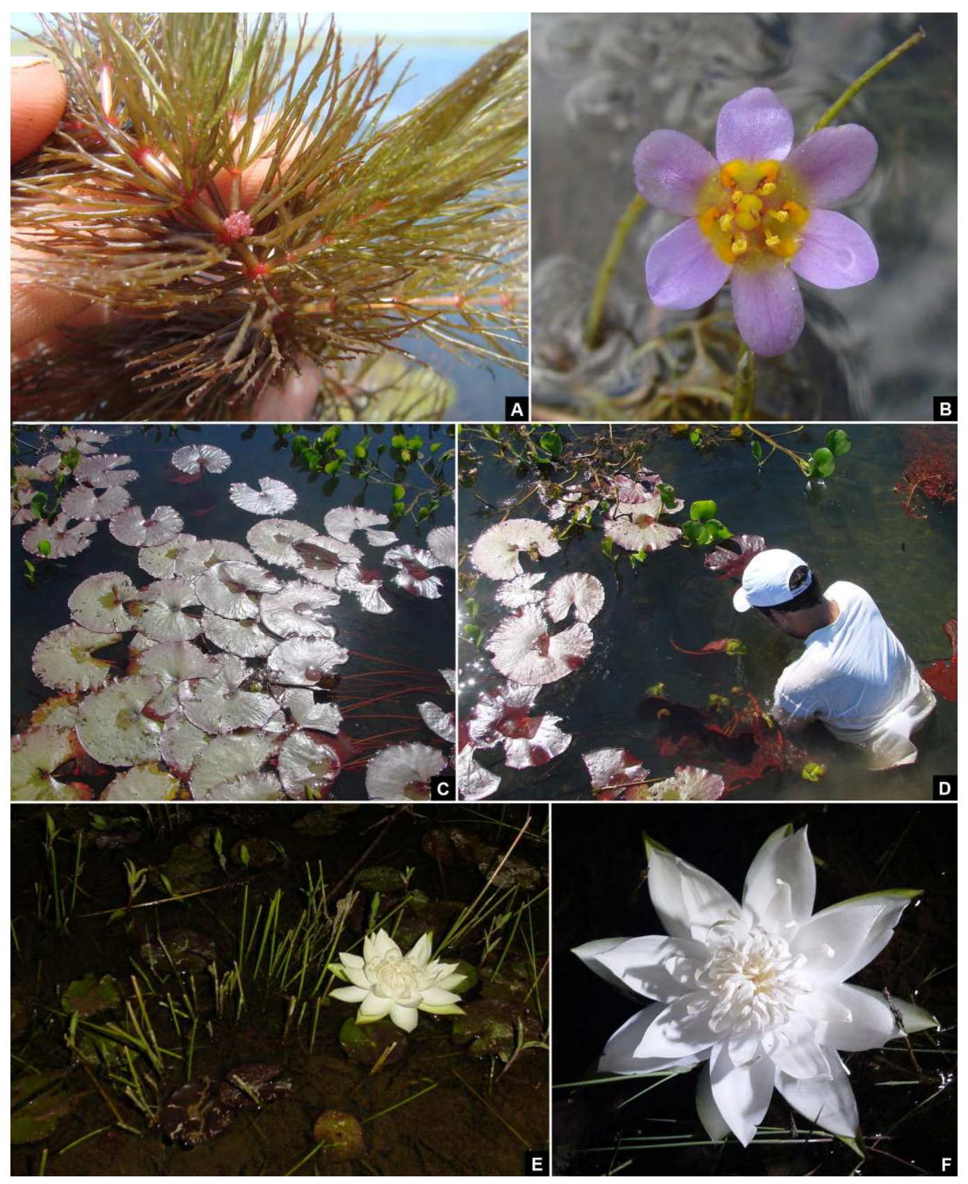
FIGURE 3. Aquatic macrophyte species photographed at the Pandeiros River Wildlife Sanctuary: Nymphaeales e Ceratophyllales. A. Ceratophyllum demersum (Ceratophyllaceae), B. Cabomba furcata (Cabombaceae), C-D. Nymphaea rudgeana (Nymphaeaceae), E-F. Nymphaea lingulata (Nymphaeaceae).