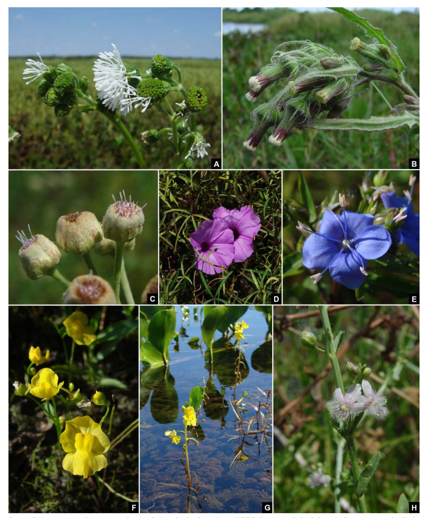
FIGURE 5. Aquatic macrophyte species photographed at the Pandeiros River Wildlife Sanctuary: Eudotyledons. A. Gymnocoronis spilanthoides (Asteraceae), B. Erechtites hieraciifolius (Asteraceae), C. Pluchea sagittalis (Asteraceae), D. Ipomoea sp. (Convolvulaceae), E. Hydrolea spinosa (Hydroleaceae), F. Utricularia gibba (Lentibulariaceae), G. Utricularia foliosa (Lentibulariaceae), H. Scoparia dulcis (Plantaginaceae).