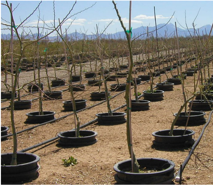
Fig. 3. Trees in a pot-in-pot system in which containerized plants are placed in larger holder pots installed in the ground. Temperatures in the root zone are moderated because the holder pots shade the smaller containers and the soil around the containers provides insulation.

moat pots) are buried in the ground and the containerized plants are placed inside these pots (fig. 3). This system reduces the heating of the containers by the sun since they are shaded by the larger holder pots. Additionally, temperatures in the root zone are moderated because of the insulation from the soil. Also, once the plant material grows and shades the pot surfaces, the high loss of moisture at the medium surface will be reduced. Depending on the severity of the problem, the pot-in-pot method may only be necessary on the southwest side of a production bed.