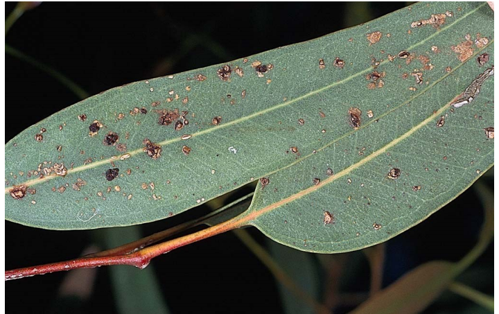
Fig. 2. Intumescences (edema) on eucalyptus.

It is difficult to determine the exact cause of intumescences because the research results are inconsistent. For example, one hypothesis is that intumescences develop in plants that have received environmental cues similar to those caused by flooding, and that the plant reaction is aimed at improv-