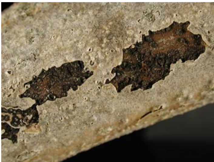
Fig. 1. Black and white fruiting bodies of Bot fungi that produce asexual spores (conidia) on walnut.

Bot fungi infect either as conidia from the asexual stages of the fungus (fig. 1) or as ascospores from the Botryosphaeria stages. These spores are universally produced in dead or dying tissues on diseased plants. Spores are splashed in water, wind borne, or moved in brush, clipping or trimmings of diseased plants. Ascospores and conidia germinate readily at 28 to 32°C (82 to 90°F) (Sutton 1990), suggesting that current warm conditions in California could signal the onset of a difficult year with this pathogen.