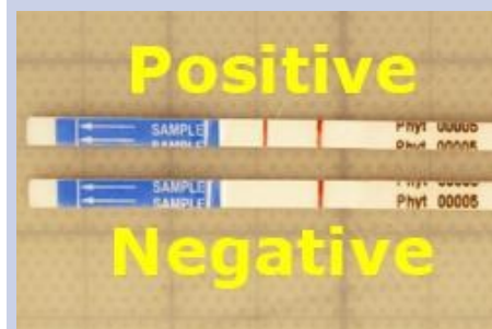
Fig. 1. Agdia Phytophthora ImmunoStrip.

Alert Kits from Neogen Company. They carry field test kits for the common root pathogens: Phytophthora , Pythium and Rhizoctonia . Also they carry several other bacteria and virus test kits. Contact: 800/477-8201 http://www.neogen.com/PlantDiagnostics/index.html .