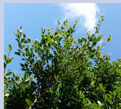
Fig. 1. Damaged terminal leaves high in a Ficus microcarpa tree in the landscape caused by an eye-spot midge, Horidiplosis ficifolii Harris.

For more information about the eye spot midge on ficus, see the pest alert from Florida .