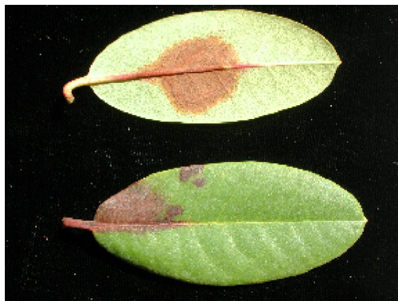
Fig. 2. Rhododendron leaf symptoms. Irregular lesions can coalesce and sometimes develop into leaf veins or petiole.

In general, the same cultural management practices that help control other Phytophthora species will also help control the introduction and