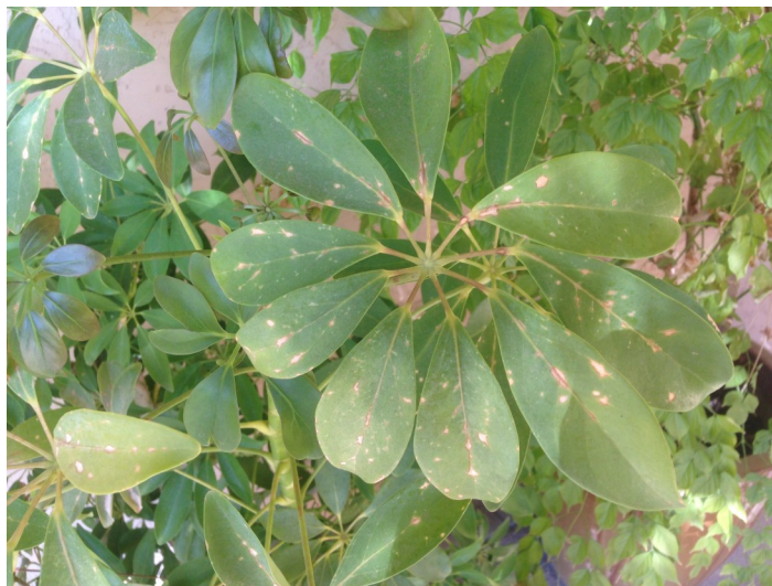
Fig. 1. Snow and cold damage to schefflera that appeared well after the weather event.

To diagnose a problem in ornamental plant production, the diagnostician must have very good observation skills and also be a good detective. Several important steps are necessary in the diagnosis process. First, know what is normal or recognize when plants appear healthy. Second, identify characteristic symptoms and determine if they have a distinct pattern or are erratic and without pattern. Next, review the cultural practices and growing environment, looking for abiotic causal agents (water, light, temperature) or recent environmental changes. Finally, it is really important to document individual events for future use and experience.