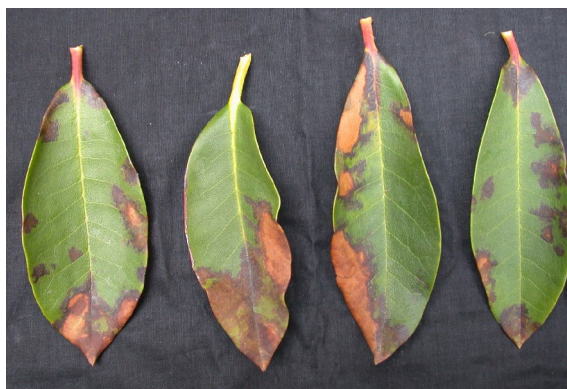
Fig. 4. Viburnum leaf symptoms. Irregular lesions with dark banding at the edge of the lesions.

Steven A. Tjosvold Farm Advisor, Environmental Horticulture UC Cooperative Extension Santa Cruz County 1432 Freedom Boulevard Watsonville, CA 95076-2796 (831)763-8013 phone, (831) 763-8006 fax satjosvold@ucanr.edu http://cesantacruz.ucanr.edu/