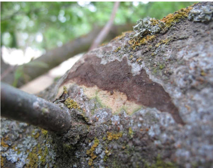
Fig. 2. Canker margin of Botryosphaeria dieback on 'Chandler' walnut.