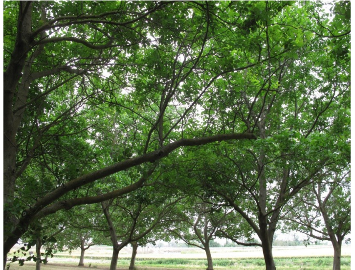
Fig. 3. Botryosphaeria dieback on a 'Chandler' limb.