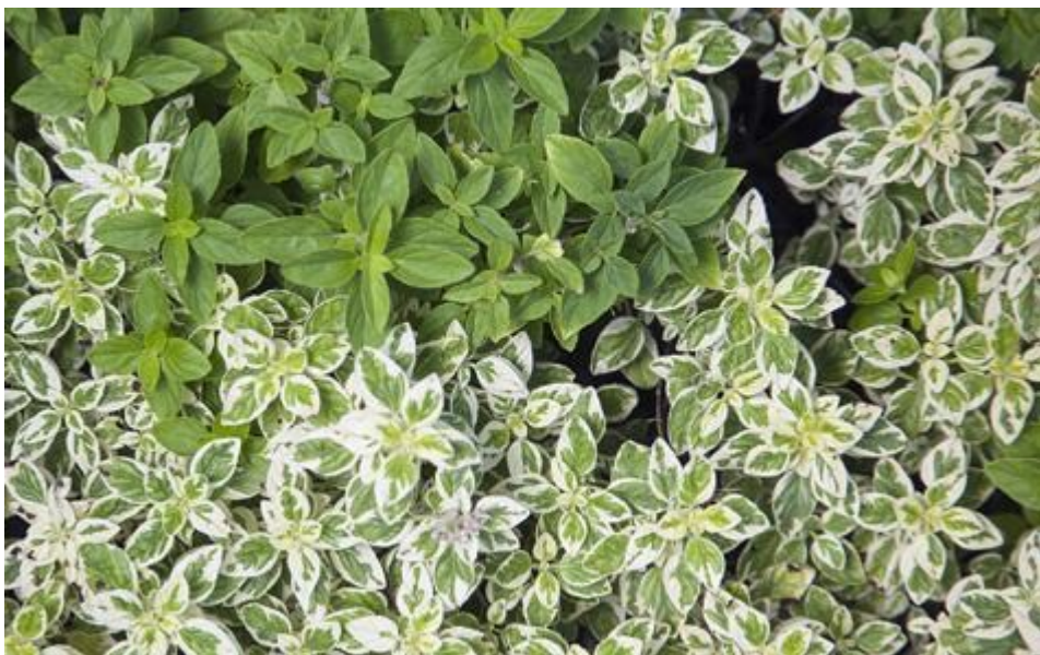
Fig. 4. Genetic disorder. Growing points with variegated leaves can sometimes arise spontaneously from some species such as this Origanum. Genetic variants such as this are sometimes confused with plants with virus disease or nutrient deficiency symptoms.