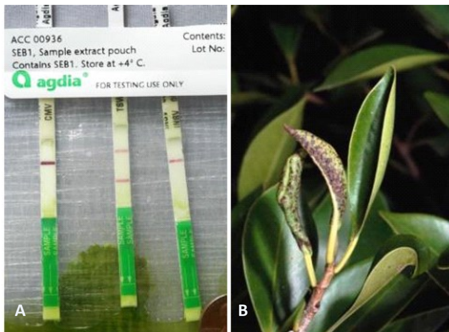
Fig. 1. Diagnosing biotic problems. Plant pathogens can sometimes be rapidly diagnosed using commercially available quick tests, such as these test strips for viruses (A). Arthropod pests such as Cuban laurel thrips (shown here on Ficus) cause feeding damage, which can help in pest identification (B).

The excrement and byproducts from these pests can also provide clues that the pests have been or are actively present. Caterpillars and other chewing pests produce dark excrement or droppings. Greenhouse thrips and plant bugs produce dark, watery, or varnish-like droppings on foliage. Aphids, whiteflies, soft scales, and some other sap-sucking insects excrete excess plant fluids as honeydew, a sticky sap, which provides a medium for the growth of sooty mold.