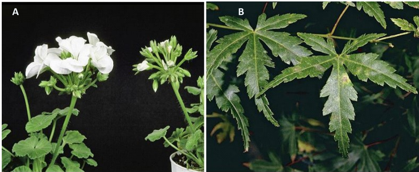
Fig. 3. Poor air quality can lead to physiological disorders. Shattering (petal drop) on geranium was caused by plant exposure to low levels of ethylene in the greenhouse or during postharvest storage (A). Yellowish and brownish patches on Japanese maple leaves are damage caused by ozone (B), an outdoor air pollutant.

foliage, which then dies beginning in areas between the veins. Sunscald is damage to bark caused by excessive light or heat. Damaged bark becomes cracked and sunken. Frost damage causes shoots, buds and flowers to curl, turn brown or black and die. Hailstones injure leaves, twigs, and in serious cases even the bark. Chilling damage in sensitive plants can cause wilting of foliage and flowers and development of dark water-soaked spots on leaves that can eventually turn light brown or bleached, and die. Physical and mechanical injury can occur when plants are mishandled during transport or routine cultural practices. Wounds might serve as entry sites for plant pathogens and can attract boring insects to woody stems.