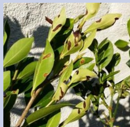
Fig. 2. Necrotic wound damage to leaves of Ficus microcarpa caused by the eye-spot midge, Horidiplosis ficifolii Harris.