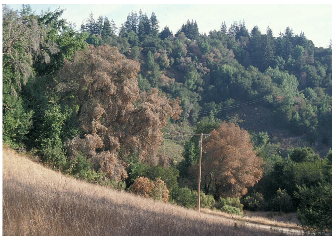
Fig. 1. Sudden Oak Death the disease causing mortality on California coast live oak in 1999.

tious spores. Under wet and cool conditions, infectious spores can be produced on leaves and move in water runoff during irrigation or rain events. Even nearby streams and ponds may become contaminated with P. ramorum . Soil in containers or in the