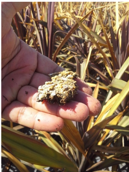
Fig. 1. Precipitation of salts on the surface of a planting mix. Electrical Conductivity (EC) of 16 dS/m has been observed in some situations, which will kill roots of most plant species.

plants, but have most of the water leach through the containers. The logic behind this practice is that the dissolved salts in the irrigation water will remain in the pots if high WHC-type media are used. As the media dries, the volume of water decreases, but the salt in the water becomes more concentrated, and eventually precipitates (fig. 1), which can damage root systems.