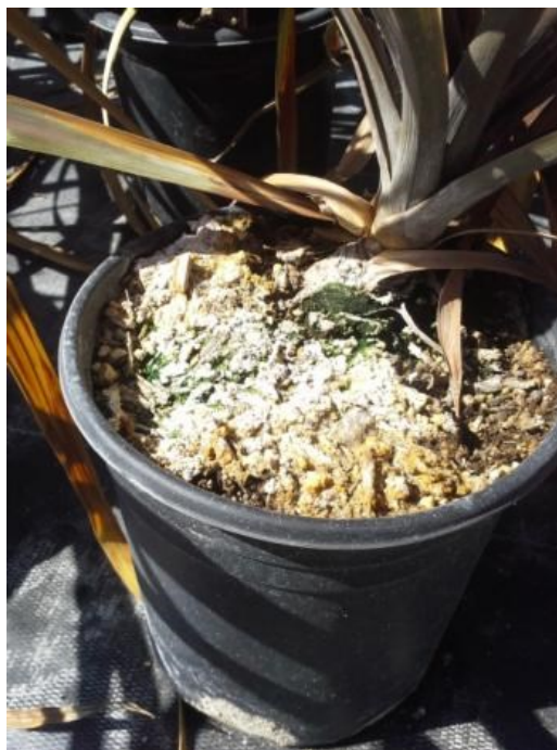
Fig. 2. Precipitation of salts on the sunny, southwest side of a container. Salt precipitation is essentially nonexistent on the shaded right side of the container.

er will dry out faster than the northeast side. Similarly, if a portion of the pot is shaded by the plant, the evaporative wicking of moisture from the pot surface will occur on the sunny portion (fig. 2), and this is where the salts will precipitate and accumulate.