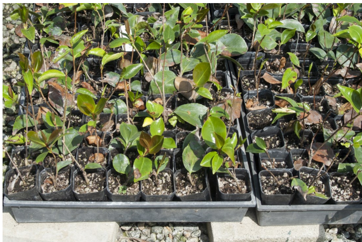
Fig. 3. Camellia liners with leaf lesions and defoliation caused by P. ramorum .

spread of P. ramorum . Start with clean planting mix that drains well, use clean containers, and keep nursery stock on a gravel bed or use another method to avoid container contact with field soil. Avoid overwatering or underwatering and other plant stresses. Avoid irrigation practices that wet the foliage for prolonged periods. If sprinklers are used, irrigate in the morning to allow for thorough and quick drying of foliage. Good plant spacing helps dry foliage.