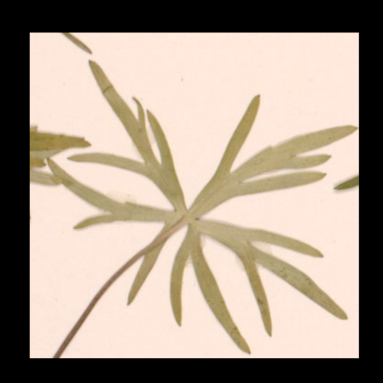
3 variances of Aconitum delphiniifolium