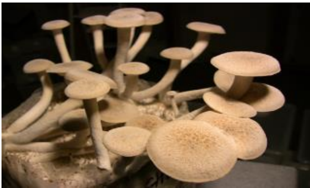
Hypsizygus tessellatus (Hive Blog, 2020)