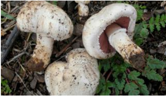
Agaricus bisporus (Ultimate Mushroom, 2021)