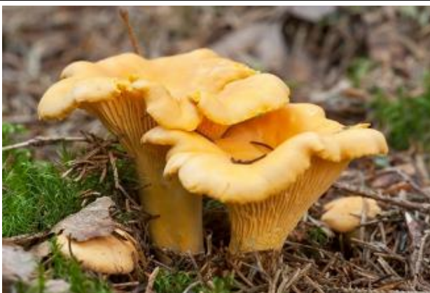
Cantharellus cibarius (UAB Njordas, 2023)