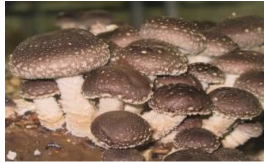
Lentinula edodes (Mycelia, 2023)