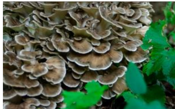
Grifola frondose (Fungi Natur, 2022)