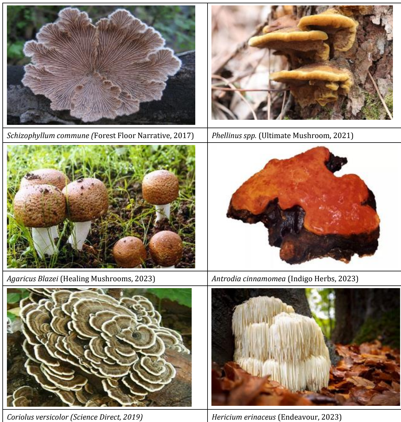
Figure 3 Medicinal Mushrooms

The terpenes, which are made up of units of five-carbon isoprene atoms and are particularly significant for their bioactivity, are a different family of chemicals. By adding functional groups, terpenes create terpenoids. Besides having anti-inflammatory, antioxidant, and anticancer activities, they affect the immune system by promoting the expression of genes that code for immune response-related proteins. Species of mushrooms in the genus Ganoderma P. Karst have high terpenoid concentrations [81] [84] [315] [357]. Proteins in mushrooms are abundant and have cytotoxic and anticancer activities. Some of them are well-known for having a distinctive and noticeable immunomodulatory action. These proteins are identified as fungal immunomodulatory proteins (FIPs) with a variety of potential modes of action [84] [315] [357].