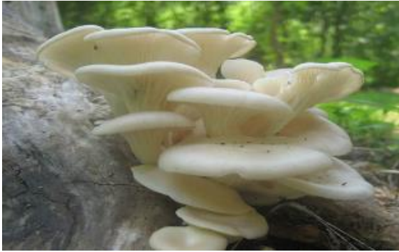
Pleurotus spp. (Mushroom Mountain, 2023)