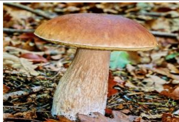
Boletus edulis (Forest Floor Narrative, 2019)