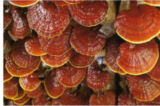
Ganoderma sichuanense (TEC, 2023)