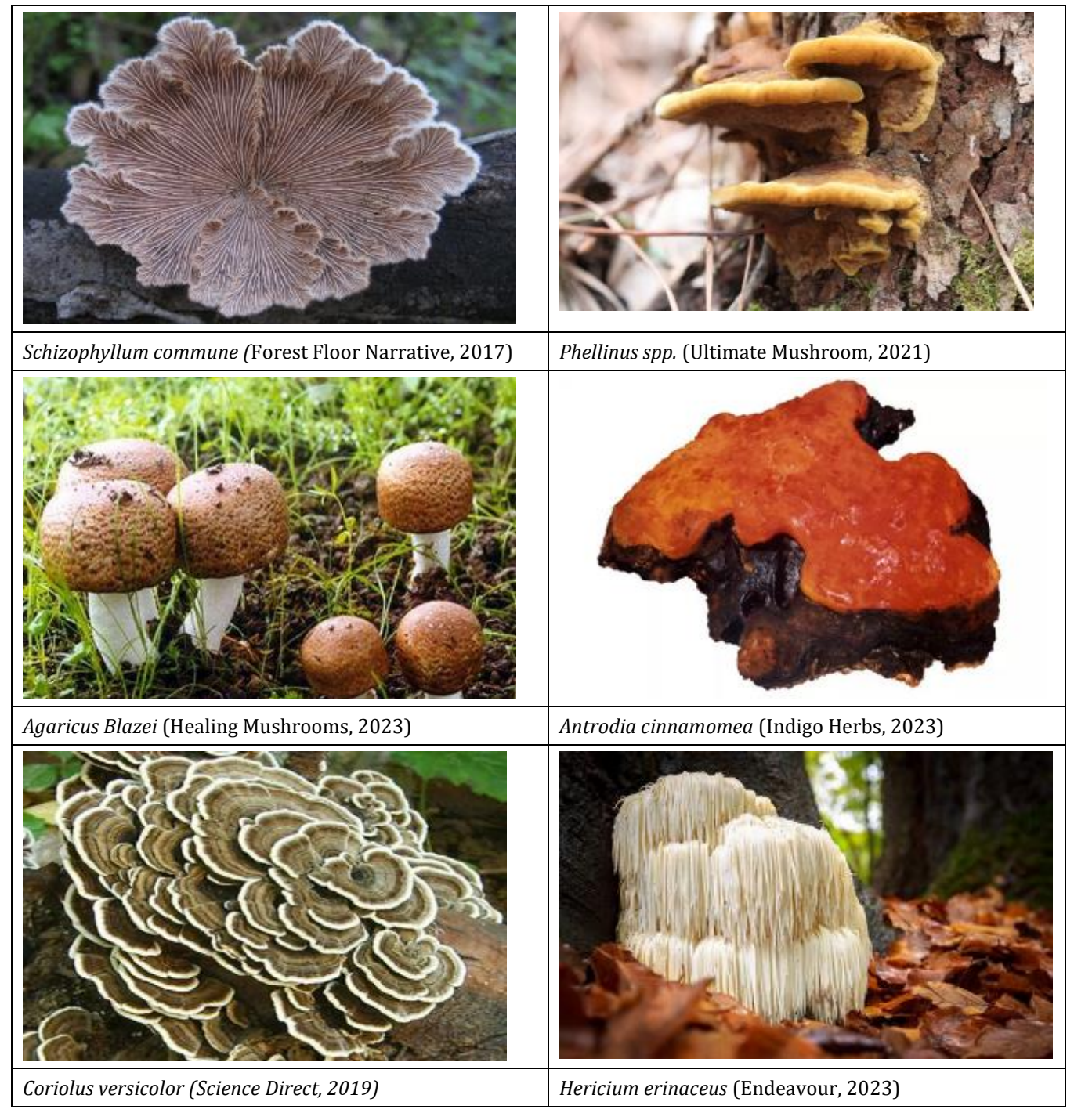
Figure 3 Medicinal Mushrooms

The terpenes, which are made up of units of five-carbon isoprene atoms and are particularly significant for their bioactivity, are a different family of chemicals. By adding functional groups, terpenes create terpenoids. Besides having anti-inflammatory, antioxidant, and anticancer activities, they affect the immune system by promoting the expression of genes that code for immune response-related proteins. Species of mushrooms in the genus Ganoderma P. Karst have high terpenoid concentrations [81] [84] [315] [357]. Proteins in mushrooms are abundant and have cytotoxic and anticancer activities. Some of them are well-known for having a distinctive and noticeable immunomodulatory action. These proteins are identified as fungal immunomodulatory proteins (FIPs) with a variety of potential modes of action [84] [315] [357].