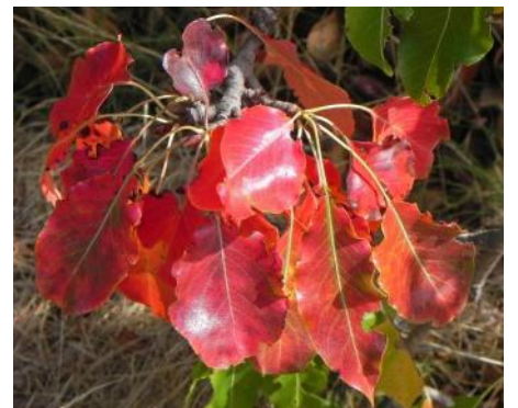
Pyrus salicifolia , Willow Leaved Pear has attractive flowers and bright autumn leaves. Origin SE Europe W Asia.