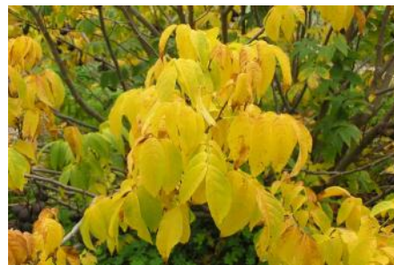
Mexican Buckeye, Ungnadia speciosa , is a small tree with fragrant bright pink flowers in spring. Fruit is a 3-lobed capsule with poisonous seeds. Autumn foliage is a golden yellow. Origin Mexico.