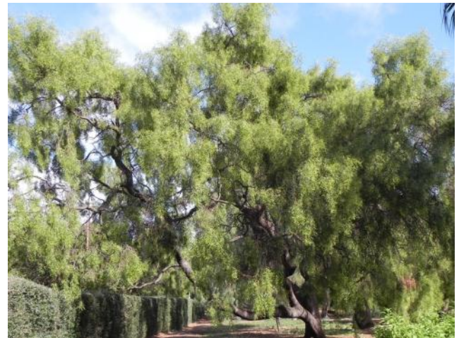
Acacia salicina in the Waite Arboretum

Acacia salicina (cooba) is common across eastern