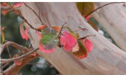
Lagerstroemia indica , Crape Myrtle is beautiful in all seasons with colourful flowers, mottled bark and pink autumn foliage. Origin China.