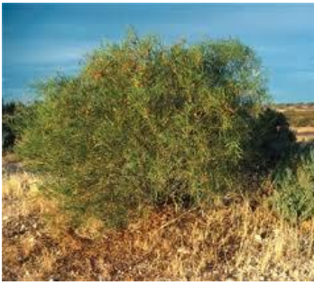
Acacia ligulata