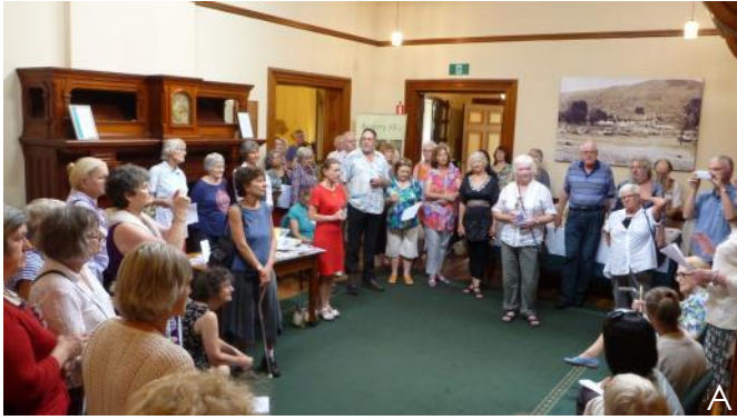
Basketry Exhibition opening address.