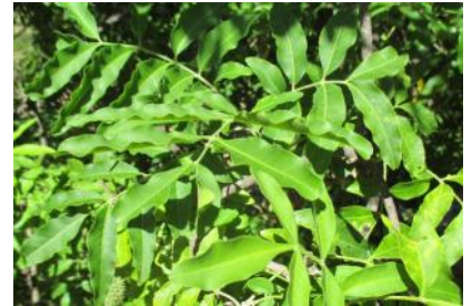
Compound leaves

leaflets each up to 120 mm long. These are similar to most species of Flindersia and resemble the pinnate leaves of the true Ashes ( Fraxinus spp.), hence the common name Ash given to many species of Flindersia . The flowers are large panicles of small individual yellow flowers.