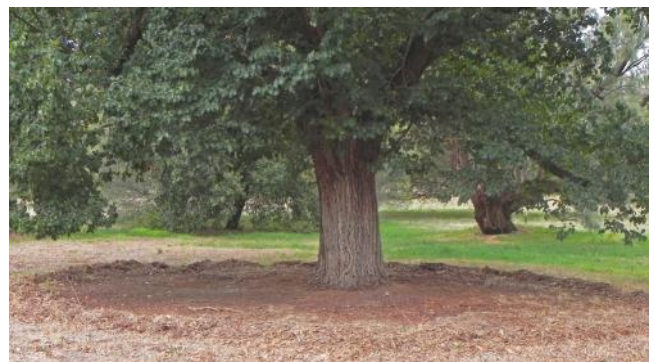
Mulch cleared from under elm canopy.

On the 15 January 2014 a fire started in inaccessible forest in the southern Flinders Ranges. The Bangor Fire, as it came to be known, burned out of control for 30 days and destroyed in excess of 35,000 hectares with a perimeter of more than 200 kilometres. 90% of the Wirrabara Forest was burnt including the historic Wirrabara nursery, established in 1877. Forestry SA has initiated a collaborative project to re-establish the Wirrabara planting. The Waite Arboretum has provided seeds of Grecian Juniper Juniperus excelsa and many other uncommon species to forest ranger Sam Everingham. Horticultural students from Urrbrae TAFE with lecturer John Zwar will also collect and propagate Arboretum material of interest for replanting in Wirrabara Nursery.