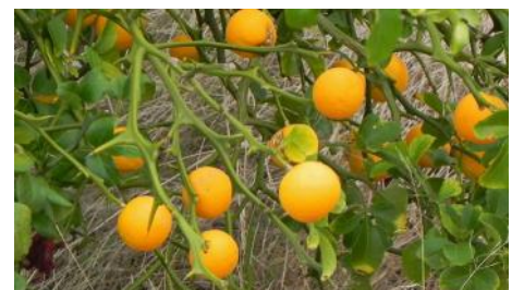
Poncirus trifoliata , Trifoliolate Orange has deciduous compound leaves and is used as a rootstock for citrus. Origin China.