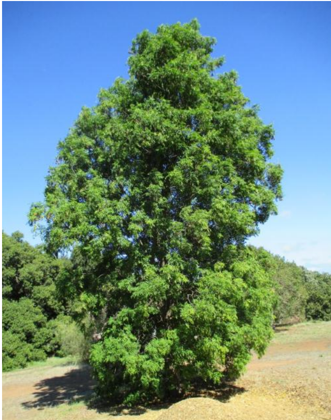
Flindersia xanthoxyla

It was such a sad sight to see that one of the Yellow-Woods in the Waite Arboretum had been vandalised. What a mindless act!