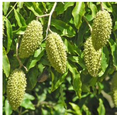
F. xanthoxyla green fruit