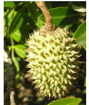
F. australis green fruit