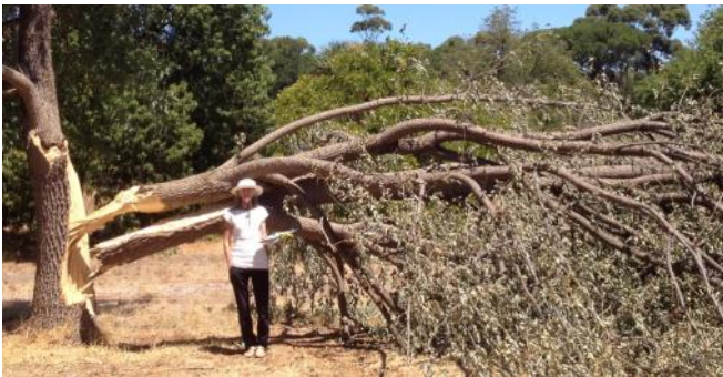
Fraxinus pennsylvanica #773 storm damage.

On the night of 3rd/4th February severe storms with wind gusts up to 100 km/h brought down powerlines and trees across Adelaide. A number of trees in the Arboretum were blown over or lost large limbs. It was very sad to see the damage to fine mature trees such as the Fraxinus pennsylvanica planted in 1950 and to our significant sugar gums planted by Peter Waite in 1877 at the entrance to Walter Young Avenue. Clean up is still under way and the Northern Turners led by Ron Allen are assisting by removing fallen timber for turning.