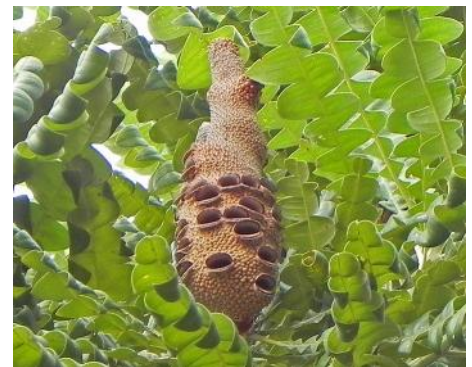
In autumn the brightly coloured flower spikes of Banksia grandis on the dam wall are followed by attractive dry fruits. Origin Australia.