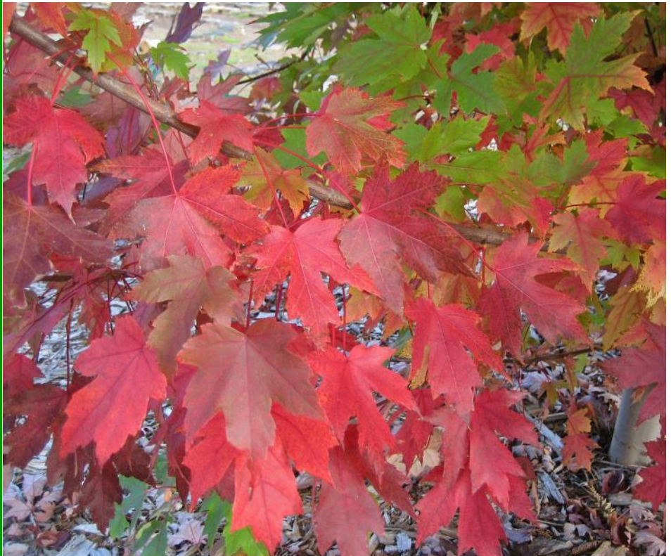
Acer x freemanii 'Autumn Fantasy'™