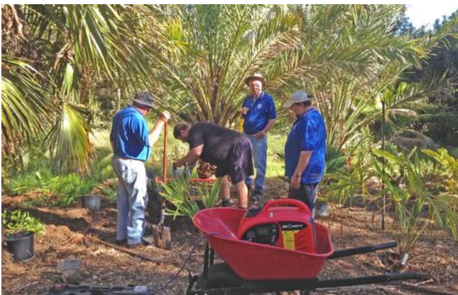
Palm and Cycad working bee, planting the new cycads.

On a happier note, the Palm & Cycad Society held a working bee on 23 February and a number of Mexican cycads donated by members were added to the collection along the watercourse.