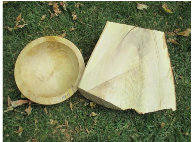
A section of figured grain obtained from a crotch in the tree.

Three of the species of Flindersia have been important cabinet making timbers in Australia. The most famous is Queensland Maple ( F. brayleyana ), a very popular furniture timber, especially in the 1960s. Maple Silkwood ( F. pimenteliana ) is very similar to Queensland Maple, often with figurative grain, and also sought after because of the beauty of its timber. Another is Silver Ash ( F. bourjotiana ) which as the name suggests has very white wood, giving an impression of silver.