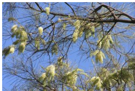
Hakea fraseri , Corkwood Oak grows on the dry and steep rocky slopes of river gorges. It is listed as vulnerable because of low population numbers and restricted distribution. Origin NSW, Qld.