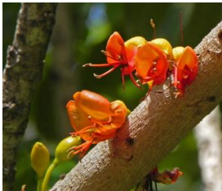
The bright orange flowers on Castanospermum australe , Black Bean, are followed by large pods with toxic seeds which were eaten by Aboriginal people after careful preparation. The seeds and foliage