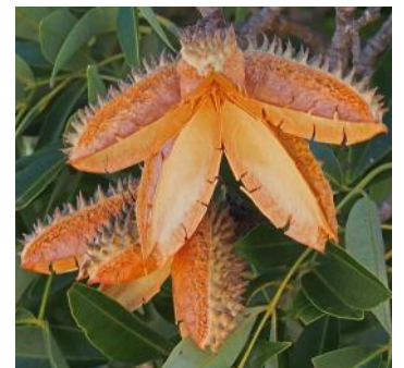
F. australis dry fruit

The fruit are typical of most species of Flindersia , consisting of usually five boat shaped capsules, the back of which is covered by blunt prickles. They are very similar to those of the Crows Ash ( F. australis ) but are more delicate and papery in texture. The individual capsules all contain two winged seeds up to 50 mm long.