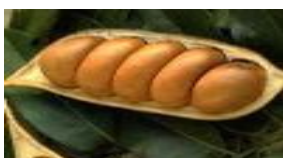
are poisonous to livestock. Origin NSW, Qld.