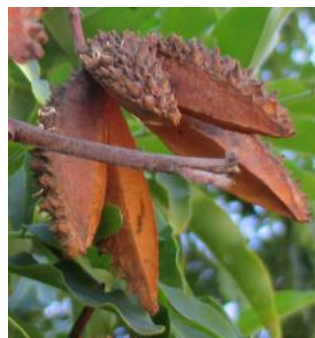
F. xanthoxyla dry fruit.