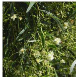
A. salicina phyllodes

Australia; in particular the Murray-Darling basin where it grows along water courses (creek and river banks, beside dams and ephemeral wetland areas).