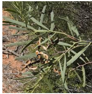
A. ligulata phyllode

collected long before the construction of the potential point source that initiated this aspect of the investigation revealed similar high levels of sulphur in members of the A. bivenosa group.