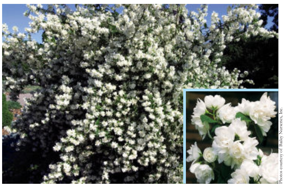
'Blizzard' and close-up of Snow White Sensation™ mockorange.

The arching branches of 'Minnesota Snowflake' grow a bit taller, up to eight feet. Its blooms have double petals. The plant is hardy to Zone 4.