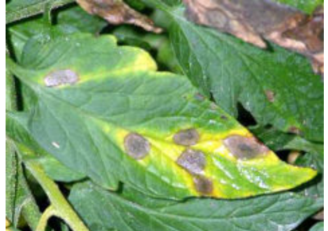
Protect tomato vines from Septoria leaf spot (left) and early blight (right) diseases.