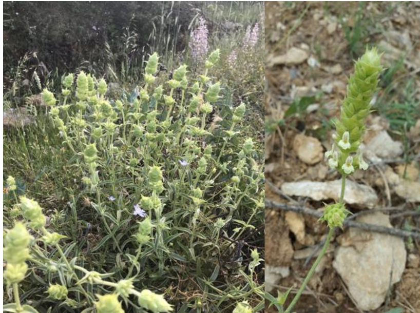
Figure 3. Sideritis condensata (Boiss. & Heldr.) subsp. condensata

located in Büyükhacılar (1015 m), Çobanisa (1068 m), and Darıderesi (1113 m) provinces. The above-ground parts as flowers, leaves and stems are consumed as tea for 5-10 minutes in boiled water. It has been observed to be used as pain relief and appetite against stomach pain among the public.