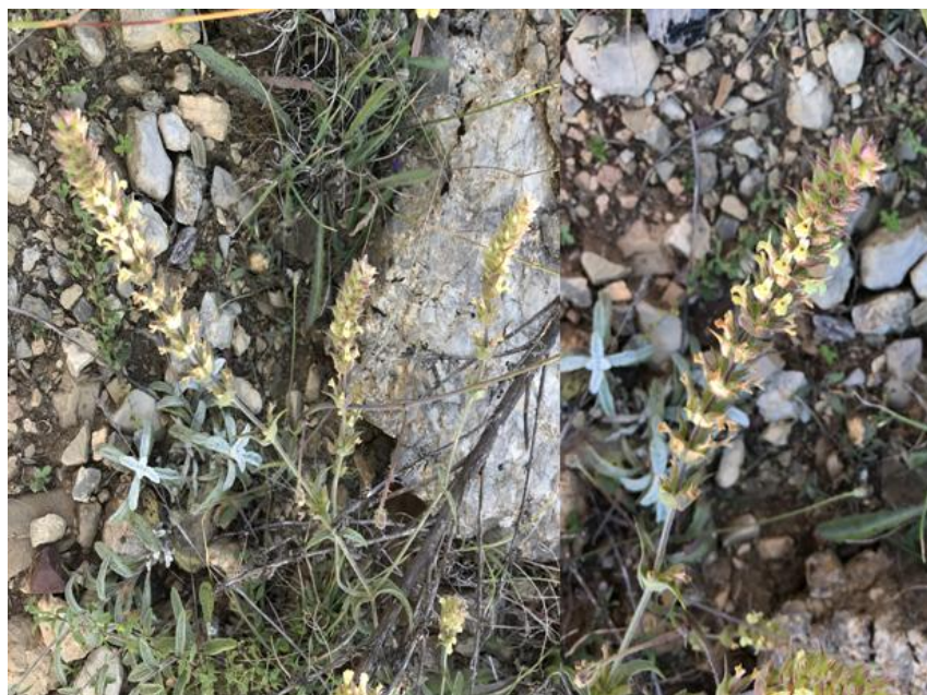
Figure 5. Sideritis libanotica Labill. subsp. linearis

Sideritis libanotica Labill. subsp. linearis is 30-120 cm, perpendicular, dense white-tomentose hairy at the base, without gland, the upper part is sparsely pubescent, simple or branched perennial plant (Figure 5). Leaves are oblanceolate, lanceolate, elliptical, linear oblong, dense pubescent, glandless, krenate-serrate or flat, no leaf petal or up to 2 cm. Verticillasters are 3 to 6, not squeezed, 6 flowers. Droplets are ovate-cordate, rarely lanceolate, short glandular hair. Calyx 6-10 mm, densely pubescent, teeth 2-4 mm. Corolla is yellow or purple violet, 8-14 mm, inside and outside with hairy, inside brown stripes or not, nuts 1-3 mm, brown, obovate-oblanseolate, tip rounded, pubescent or hairless, body leaves 1-6x0,03-1 cm. Flowering period is between May and September [10]. Leaves and flowers of S. libanotica Labill. subsp. linearis , were collected from Direkli (930 m), Büyükhacılar (1354 m) and Sav (1152 m) provinces. The above-ground parts like flowers, leaves and stalks are consumed as tea by infusing for 5-10 minutes in boiled hot water. It has been found to be used as pain killer, stomach pain, intestinal regulator, carminative, diuretic, cough suppressant and appetite among people.