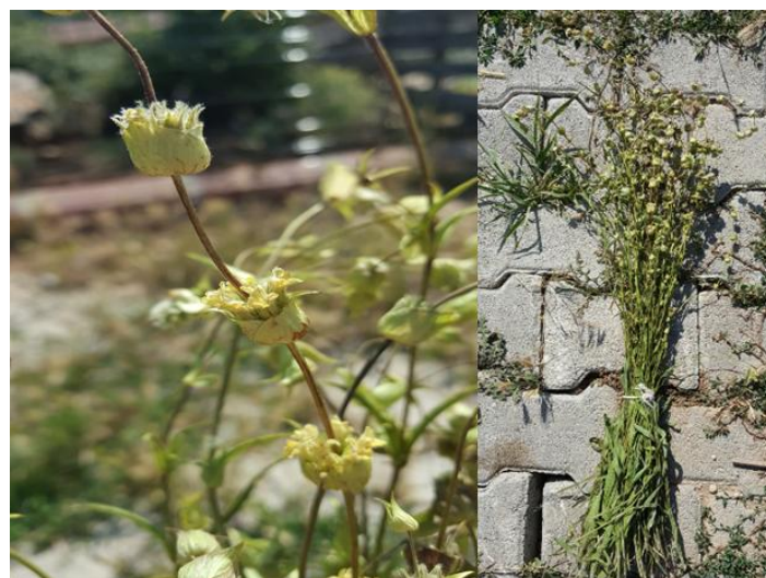
Figure 4. Sideritis hispida P. H. Davis

Sideritis hispida P. H. Davis is 35-90 cm, steep body, simple or rarely branched, intense short gland hairy, the upper part of the almost hairless and dense pubic hairy, endemic, perennial herbaceous plant (Figure 4). Both sides of the leaves are sparse long veils and short glands along the veins. Leaves are sessile, linear-lanceolate, edge is full or light serrate. The flowers are simple or branched, verticillates 2-8 (-10), each vertisillate 6 flowers. Braces are ciliate, hairless or sparsely pubescent, with full edges. Calyx is 10-12 mm; teeth lanceolat, 3-4x1,2-1,6 cm, corolla yellow, 11-14 mm, the inner side of the upper lip is sparsely short-veined, and the inner part is brown, the inner side of the lower lip is densely flattened, hairy, hazelnut ovate, 3- 4 mm and light brown. Flowering period is between July and September [10]. Samples of S. hispida were collected from Akdoğan (1128 m), Büyükhacılar (1033 m) and Yazısöğüt (989 m) provinces. The above-ground parts like flowers, leaves and stalks are consumed as brewed tea in boiled hot water (Figure 4). It has been found to be used against pain relief, intestinal regulator and cough among people.