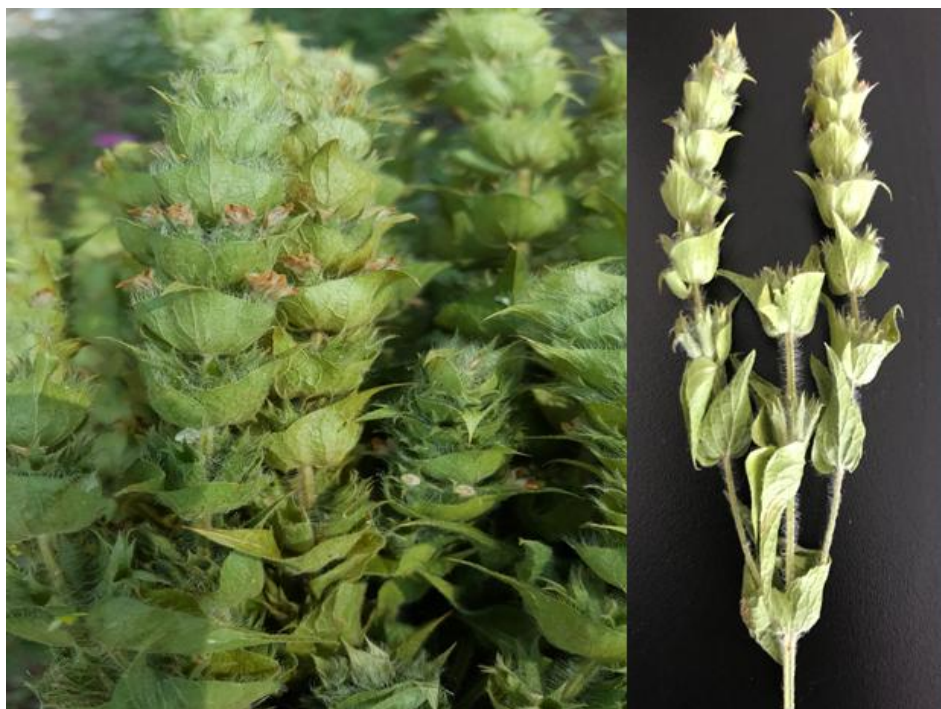
Figure 6. Sideritis perfoliata L.

In other studies, it was reported that Sideritis samples are used extensively as herbal tea among the public against various diseases such as antiinflammatory, antispasmodic, carminative, analgesic, sedative, cough suppressant, antipyretic, anticonvulsant, cold coughs and digestive complaints [11-33].