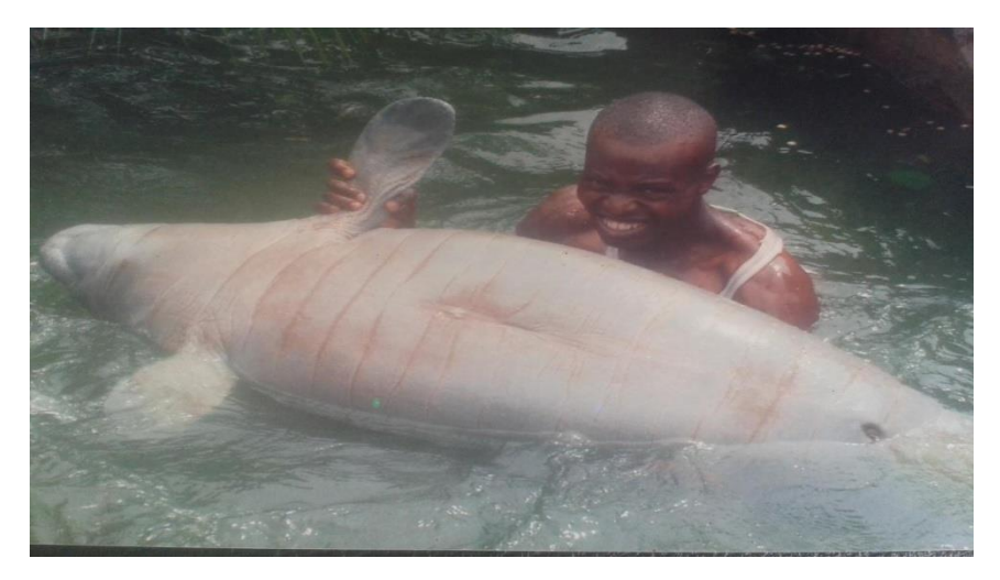
Plate 1. The male manatee being recovered from a fish tank.

Table 1: The mean and standard error of the Physico-chemical parameters of Little Stream Farm