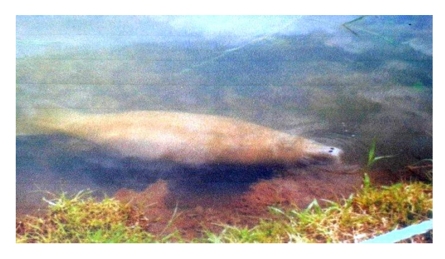
Plate 3: The manatee surfacing to inhale air in the clear, calm water of the canal

Heliotropium spp. Pyrrolizidine is known to have toxic effects on the liver and lungs and is a mutagenic and carcinogenic agent (Carballo et al 1992; van Weeren et al 1999). Thus, the manatee might have been instinctively using its innate knowledge of plants to avoid potentially toxic specimens while showing a great preference for seven (7) out of the 15 species presented to it.