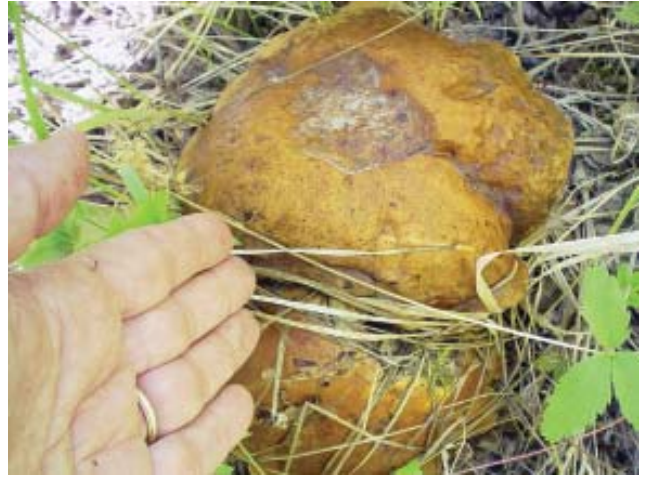
Leccinum boreale as well as other members of the family often grow to large sizes. The trick is to find them and pick them before the other members of the forest do.

enjoy. If you get the idea that the stalk is a treasured part of the mushroom you are right! With the cap, often the infestations are limited to the spongy pores on the underside of the cap and marginally the cap itself. Cleaning off the spongy layer will often be sufficient to prepare the cap for cooking. The centre of the cap can be infested while the outside edges are clean. You need to check all the