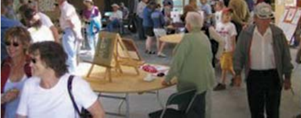
Some of the approximately 400 people that came to the Pine Pavilion at the Devonian Gardens on August 7 to see the displays, watch the slide presentations, enjoy some delicious mushroom soup and/or mushrooms on toast and learn about mushrooms - both edible and non-edible.

I had never been to the Devonian Gardens before – so when my friend Geri invited me to come to the Mycological Society’s “mushroom fair” to be held at Devonian, it seemed a good idea – I’d get a double deal: mushrooms and the gardens.