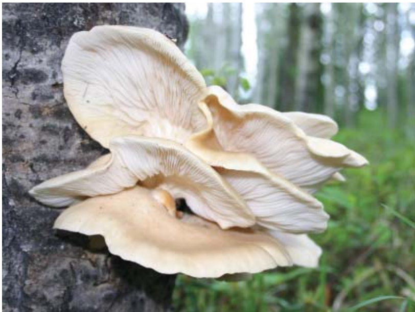
A Pleurotus ostreatus (oyster mushroom) photograph that as well as being technically correct shows both the cap on the lower growth and the gills on the upper samples. The environment (growing on the side of a tree as well as the forest) is evident in the shot.