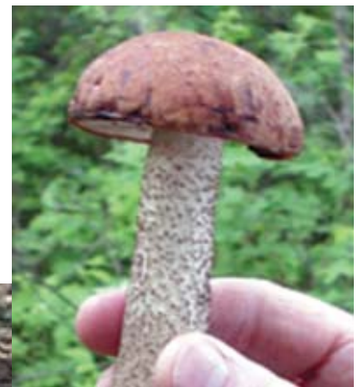
The rough stem of the Leccinum boreale is very distinctive (top). The photo on the left shows one environment that these mushrooms love.