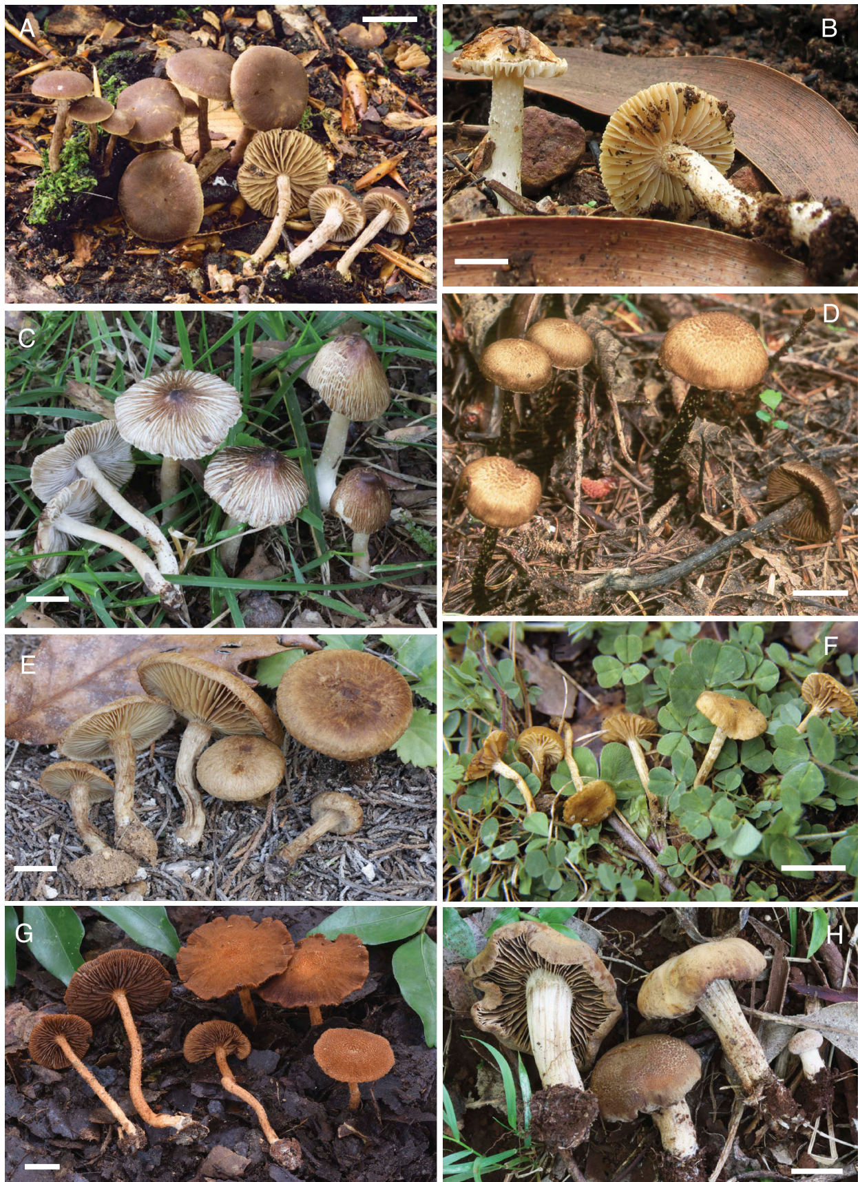
Figure 1. Basidiome diversity of Inocybaceae. A. Inocybe clade ( Inocybe sect. Inocybe): I. tubarioides (HRL2017;). B. Nothocybe lineage: I. distincta (CAL13010;). C. Pseudosperma clade: I. notodyrina (PBM3918;). D. Inosperma clade: I. calamistrata (PBM2113;). E. Mallochybe clade: I. tomentosa Ellis & Everh. (PBM4138;). F. Tubariomyces : T. inexpectatus (AH25500;). G. Auritella : A. hispida (TH10463;). H. Auritella brunnescens (NLB963;). Bars = 1 cm.