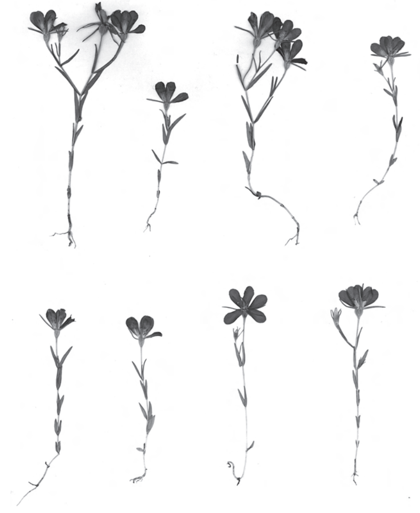
Fig. 1. Sabatia arkansana , holotype.

branches plus stigmas when uncoiled (3–)4.5–6 mm, 1.7–2.5 \times as long as unclift portion.