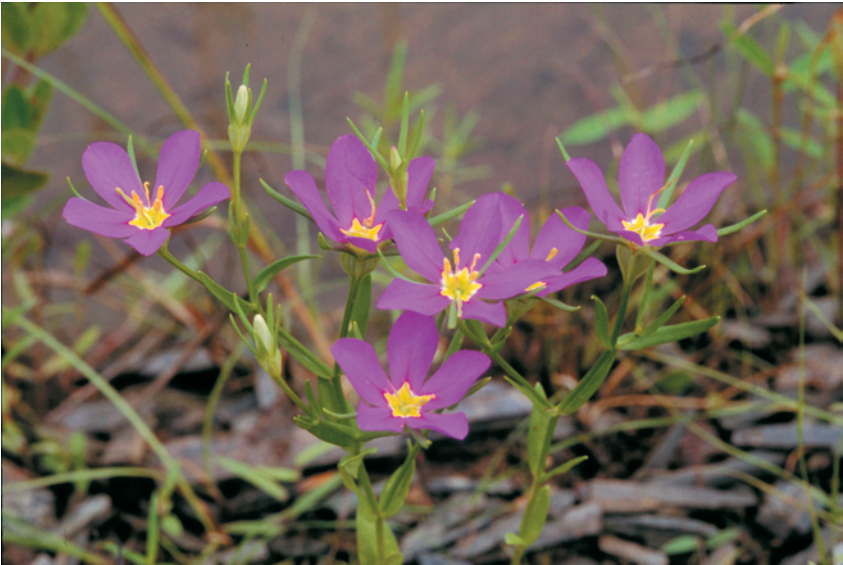
FIG. 5. Sabatia arkansana , detail of inflorescence.