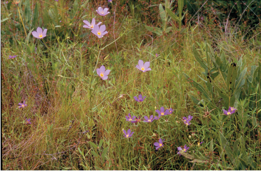
FIG. 3. Sabatia arkansana (right), with Sabatia campestris (left) at the Womble Shale glade site.