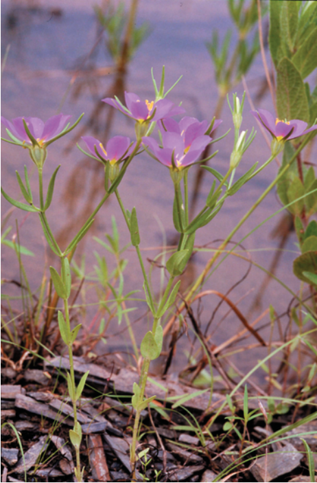
FIG. 4. Sabatia arkansana , habit.