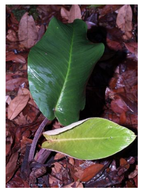
Figure 12: Schismatoglottis pyrrhias in cultivation.