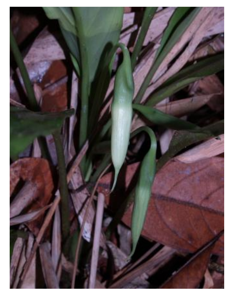
Figure 34: Distinctive nodding inflorescences carried on wiry peduncles are characteristic of S. longifolia.

The Corneri Group comprises a single species, S. corneri (Fig. 25), that is the largest in the genus, with Alocasia -like succulent grey-green leaves that can reach over 3 m tall and produces clusters of large inflorescences resembling in shape and size white and jade walking sticks. For a long time S. corneri was considered to be endemic to Sabah and the Indonesian Anambas Islands but has recently been found in Sarawak, where this photograph was taken.