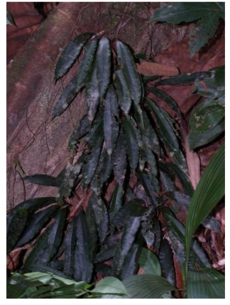
Figure 22: Schismatoglottis erecta showing the climbing habit.