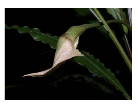
Figure 23: Schismatoglottis erecta inflorescence at late female anthesis.