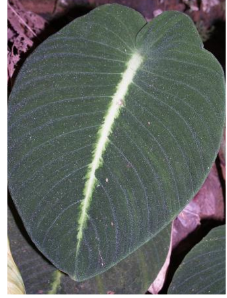
Figure 5: Detail of the sharkskin texture of the leaf lamina in Schismatoglottis mira .

The asperata complex contains man handsome species. Of note are Schismatoglottis pseudohatchii ( Figs. 1 – 3 )