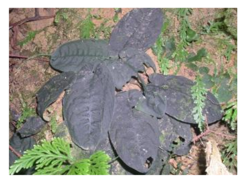
Figure 15: Schismatoglottis gamoandra in habitat with the leaves pressed close to the ground, a diagnostic feature.