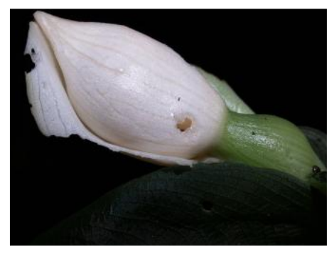
Figure 18: Schismatoglottis gamoandra inflorescence at female anthesis, with the spathe limb gaping slightly.