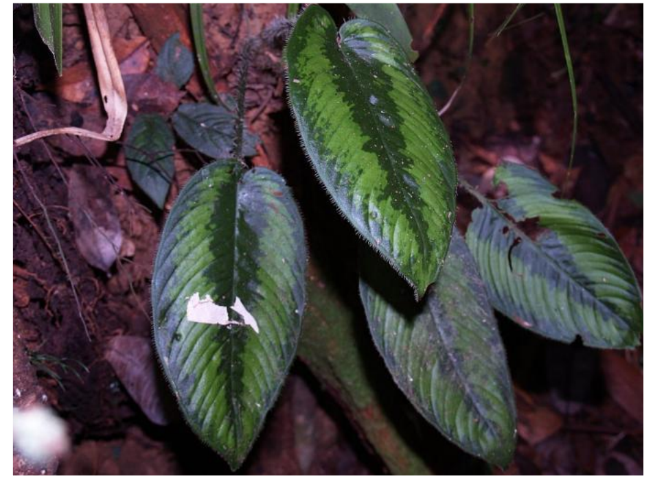
Figure 7: Schismatoglottis cilata in a variegated form in Sarawak.

species most often seen in cultivation is S. ciliata ( Figs. 7 – 9 ) a species widespread in Borneo with often conspicuously variegated leaf laminae held erect on conspicuously white-bristly petioles ( Fig. 9 ). In the wild S. ciliata is frequently found growing in deep peat deposits in heavy shade with the erect growth habit functioning as a litter-trap ( Fig. 8 ) with numerous roots entering the accumulated humus around the petioles