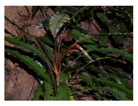
Figure 21: Schismatoglottis erecta in bud.