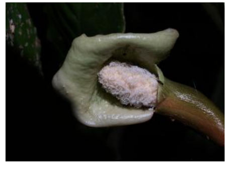
Figure 24: Schismatoglottis erecta inflorescence at male anthesis, the spathe limb has began to break away from the lower spathe and the pollen has been released in strings.