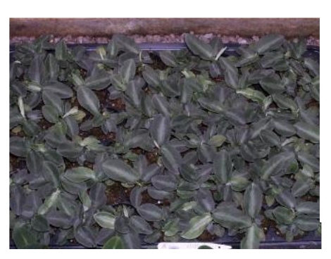
Figure 20: Young ex vitro plants of Schismatoglottis gamoandra; already the leaf markings and distinctive venation are welldeveloped.

Schismatoglottis erecta (Figs. 21 - 24) and its all allies are distinctive by the slender, erect stems and long, willowy deep green leaves. They comprise one of a few small distinct alliances of Schismatoglottis that exhibit a climbing habit, the stems rooting onto nearby vertical surfaces. Inflorescences in S. erecta are nodding and intriguingly