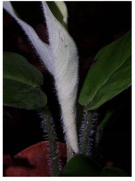
Figure 11: Schismatoglottis ferruginea in close-up to show the much finer and softer 'hairs'as compared with S. ciliata .

Schismatoglottis gamoandra (Figs. 15 – 19) is a rosette-forming dwarf species from central Sarawak with thin stiff leaves held flat on the ground on short petioles (Fig. 15). The leaf texture is like thin aluminium sheeting while the lamina colours continue the metallic theme in being pewter-grey with, in some clones, the middle of the leaf burnished into a dull silver band (Fig. 16). The whole leaf is made further striking by the raised chessboard venation (Fig. 17). For such a diminutive species the inflorescences are large and held almost erect in the middle of the leaves (Fig. 18). As can be seen from Fig. 19, the generic name Schismatoglottis is derived from the Greek schisma, schismatos (separating) and glôtta (tongue) and refers to the variously deciduous spathe limb that is a feature of S. gamoandra and most other species. Schismatoglottis gamoandra is also in tissue culture (Fig. 20).