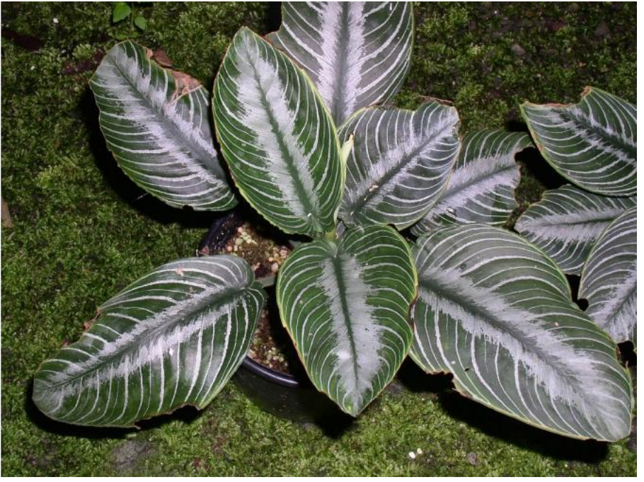
Figure 2: Culivated plant of Schismatoglottis pseudohatchii showing the numerous leaves that develop in cultivated plants.

However, this heavy Neotropical bias is not for want of exceptionally attractive and mostly easy to grow foliage plants in the Asian tropics. One such genus is Schismatoglottis ,