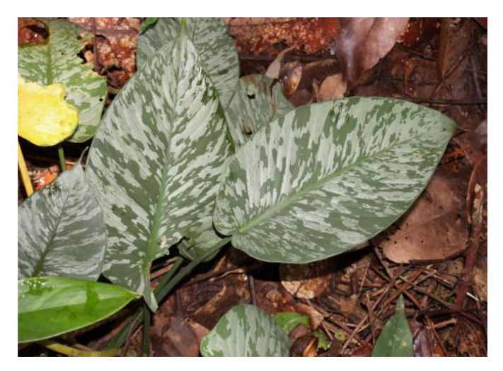
Figures 26–30: Schsimatoglottis motleyana in various leaf forms.