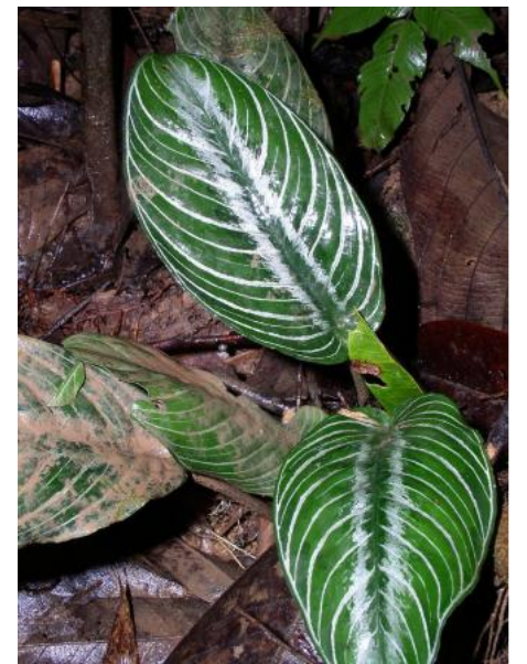
Figure 1: Schismatoglottis pseudohatchii in habitat with the adult leaf lamina banding clearly visible over the fish-bone markings.

the considerable Despite popularity of Alocasia and Colocasia, the list of horticulturally important aroid species is overwhelmingly comprised of aroids from the American tropics: Anthurium, Philodendron, Dieffenbachia, Spathiphyllum, Monstera and Caladium being pre-eminent. Paradoxically, aside from Alocasia, species from the oldworld tropics that command horticultural attention, and even there an attention not or hardly addressed by the wholesale commercial trade, tend to be those grown primarily for the inflorescence: notably Amorphophallus, Arisaema and Typhonium although this in no way implies that the foliage of these magnificent Asians is not noteworthy.