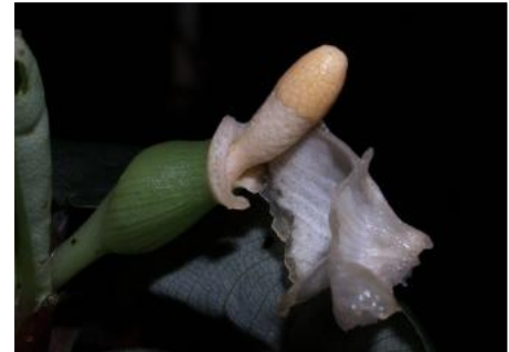
inflorescence at male anthesis, the spathe limb already more-or-less shed.