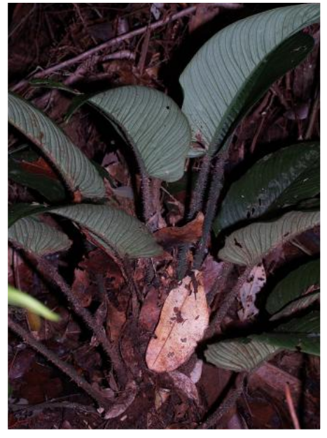
Figure 8: Schismatoglottis ciliata in habitat showing the erect leaves and the litter-trapping.