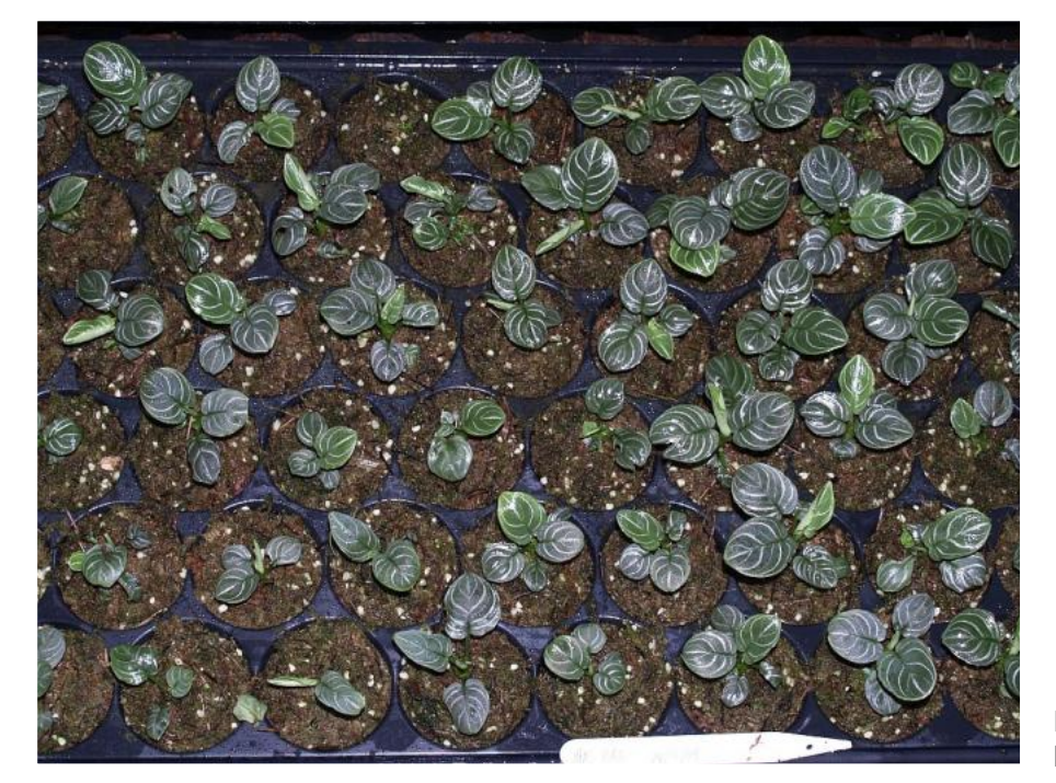
Figure 3: Young ex vitro plants of Schismatoglottis pseudohatchii with the leaf markings beginning to develop; the fish-bone veining is the first to appear.

Despite the considerable popularity of Alocasia and Colocasia, the list of horticulturally important aroid species is overwhelmingly comprised of aroids from the American tropics: Anthurium, Philodendron, Dieffenbachia, Spathiphyllum, Monstera and Caladium being pre-eminent. Paradoxically, aside from Alocasia, species from the oldworld tropics that command horticultural attention, and even there an attention not or addressed by the wholesale hardly commercial trade, tend to be those grown primarily for the inflorescence: notably Amorphophallus, Arisaema and Typhonium although this in no way implies that the foliage of these magnificent Asians is not noteworthy.