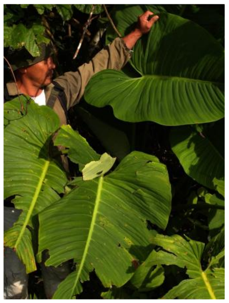
Figure 25: Schismatoglottis corneri in habitat in Sarawak. This is a small plant.