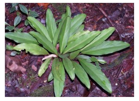
Figure 33: Schismatoglottis longifolia in a much rarer leaf form.

like leaves with a silver median band ( Fig. 32 ), or with the petiole strikingly contrasting in colour to the lamina ( Fig. 33 ), has the spathe limb barely opening and then persistent after anthesis before gradually degrading and falling while still clasping the spent parts of the spadix. The clustered, nodding inflorescences and cup-like infructescences are diagnostic for this species.