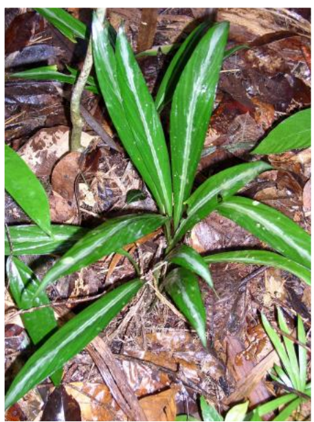
Figure 32: Schismatoglottis longifolia with strap-shaped leaves and a distinctive silver median band.