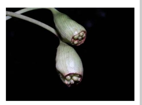
Figure 35: The cup-shaped fruiting spathes of S. longifolia are also diagnostic.

The widespread (one of only three Schismatoglottis species co-present in West Malaysia and Borneo) but never abundant S. longifolia ( Figs. 32 – 35 ) often has the strap-