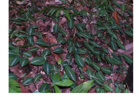
Figure 31: Colony-forming habit of Schismatoglottis motleyana .

shaped, and a pleasing combination of pale browns, green and deep mahogany and are produced in some numbers on mature plants. In common with many other species in the Multiflora Group, pollen is released in strings rather in the manner of toothpaste being squeezed from the tube.