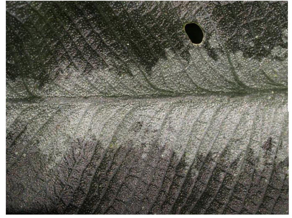
Figure 17: Schismatoglottis gamoandra leaf venation detail to show the chess-board-like raised veins.