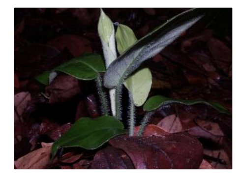
Figure 10: Schismatoglottis ferruginea in Sabah.

Schismatoglottis gamoandra (Figs. 15 – 19) is a rosette-forming dwarf species from central Sarawak with thin stiff leaves held flat on the ground on short petioles (Fig. 15). The leaf texture is like thin aluminium sheeting while the lamina colours continue the metallic theme in being pewter-grey with, in some clones, the middle of the leaf burnished into a dull silver band (Fig. 16). The whole leaf is made further striking by the raised chessboard venation (Fig. 17). For such a diminutive species the inflorescences are large and held almost erect in the middle of the leaves (Fig. 18). As can be seen from Fig. 19, the generic name Schismatoglottis is derived from the Greek schisma, schismatos (separating) and glôtta (tongue) and refers to the variously deciduous spathe limb that is a feature of S. gamoandra and most other species. Schismatoglottis gamoandra is also in tissue culture (Fig. 20).