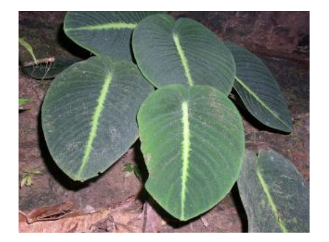
an Figure 4: The outstandingly attractive are Schismatoglottis mira in habitat.

The barbata complex differs from the asperata complex primarily in having the petioles and one or both surfaces of the leaf