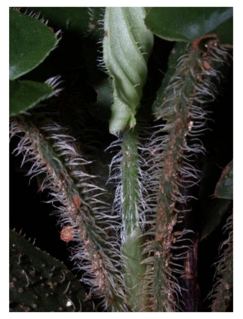
Figure 9: Detail of the petioles and newly emerging leaf in Schismatoglottis ciliata . Note the coarse nature of the 'hairs'.

Perhaps the most remarkable species in the barbata complex is S. pyrrhias (Figs. 12 – 14), a species from limestone in remote areas of central Sarawak. The deep green glossy leaves are carried on plum-purple