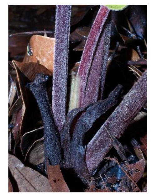
Figure 13: Schismatoglottis pyrrhias detail to show the plum-coloured petioles with the white 'hairs'.