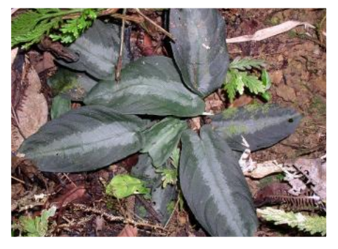
rigure 16: Schismatoglottis gamoandra in one of the variegated forms.