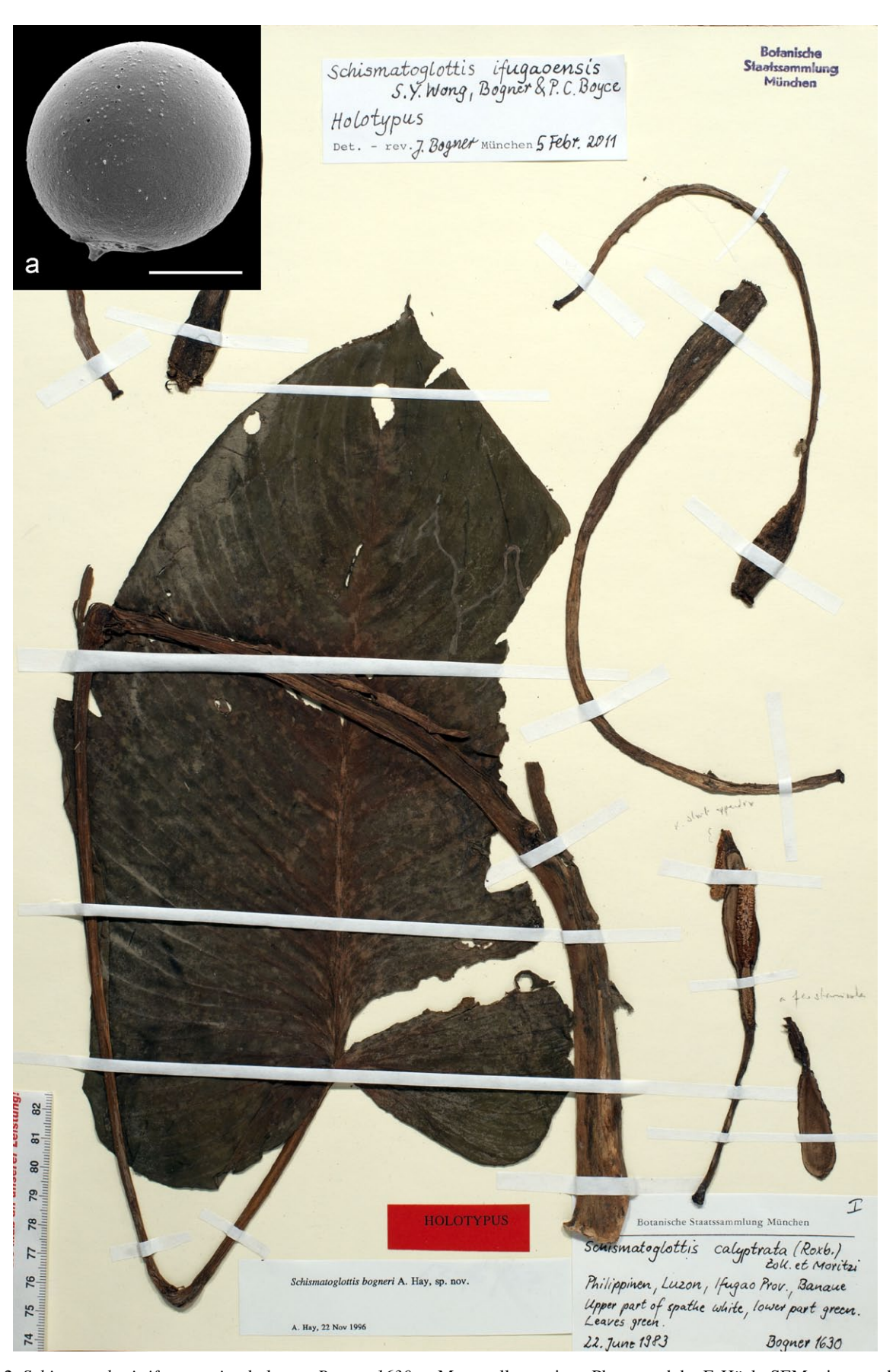
Fig. 2. Schismatoglottis ifugaoensis – holotype Bogner 1630 at M; a: pollen grain. SEM micrograph (a; scale bar = 10 \ \mu m )