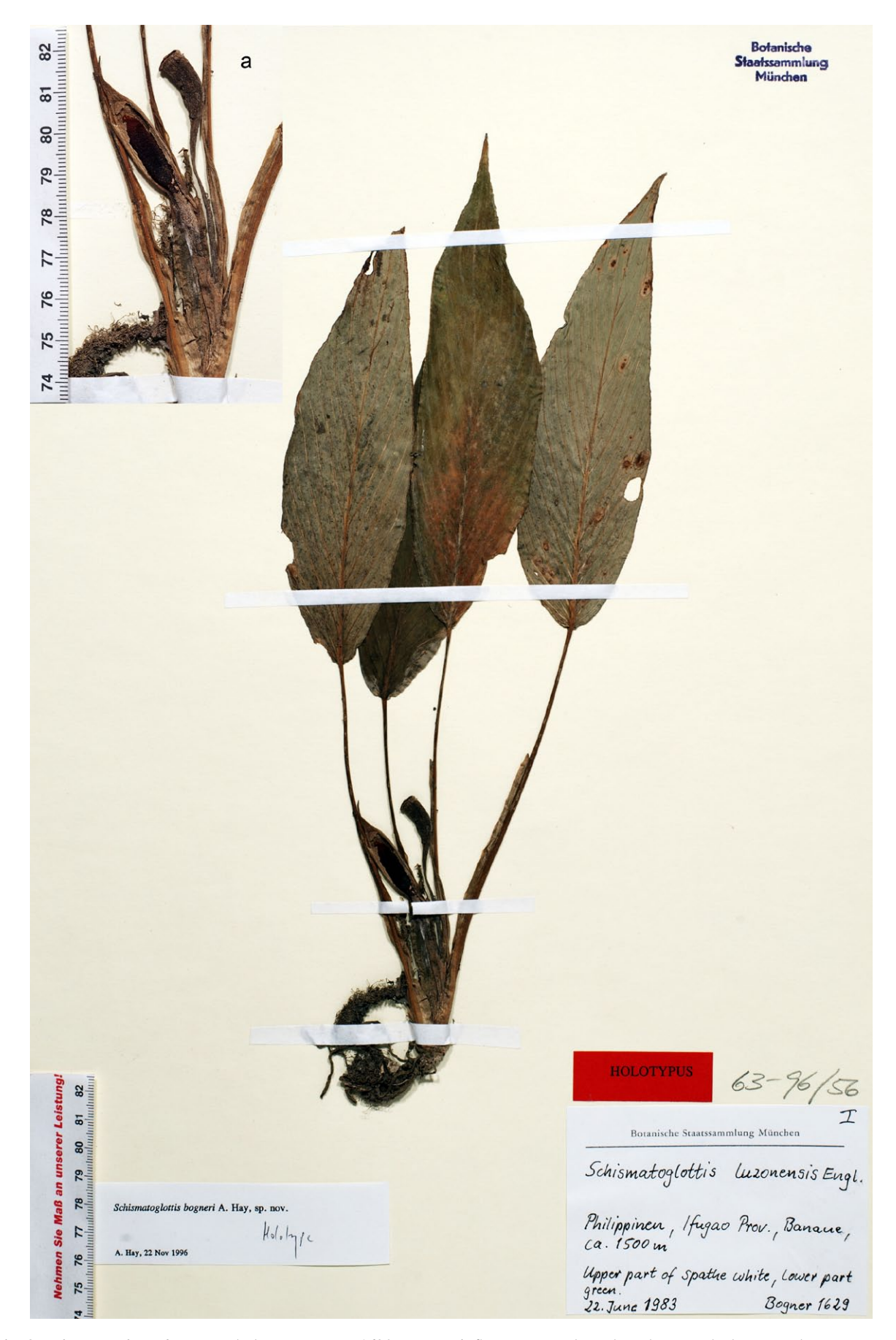
Fig. 3. Schismatoglottis bogneri – holotype Bogner 1629 at M; a: inflorescence enlarged.