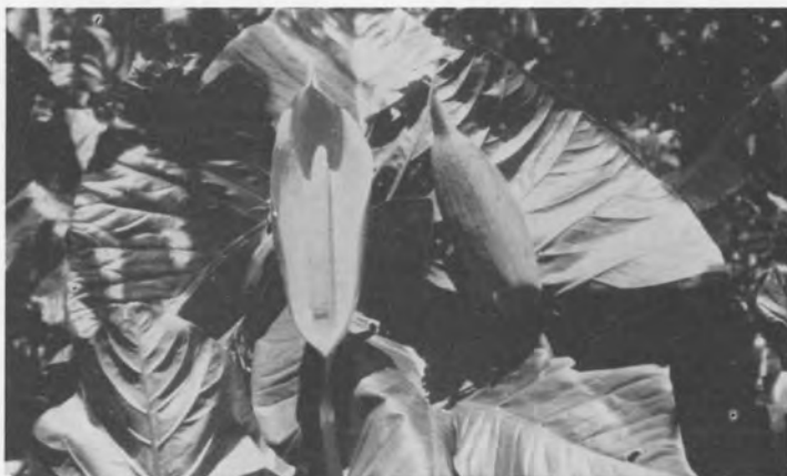
Fig. 28. Cyrtosperma merkusii (Hassk.) Schott. Philippines: Luzon: Camarines Norte: Bicol National Park, Croat 53048