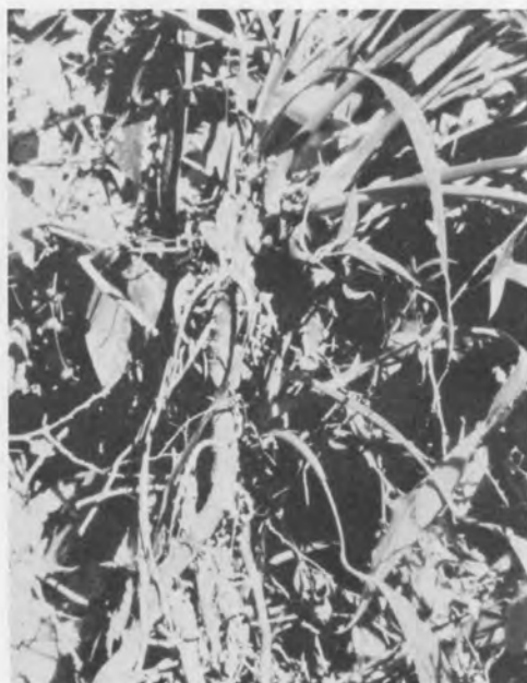
Fig. 16. Spathiphyllum communtatum Schott. Philippines: Luzon: Camarines Norte: Bicol National Park, Croat 53048.