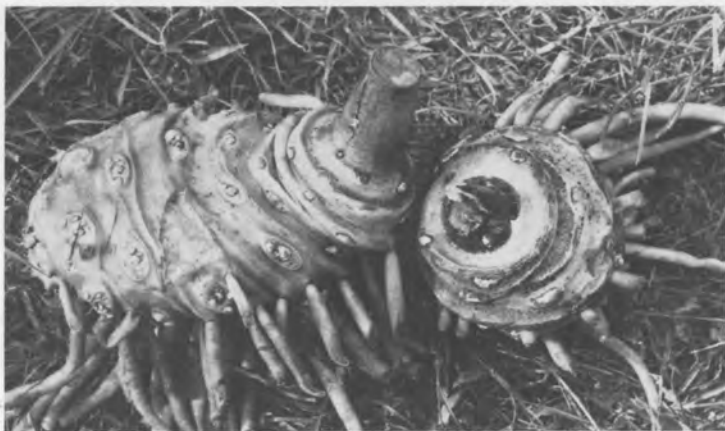
Fig. 32. Anchomanes difformis (Bl.) Engler. Nigeria: Ogun: Omo Forest