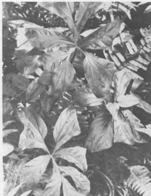
Fig. 23. Rhextophyllum mirabile N.E. Br. Nigeria: Ogun: Omo Forest Reserve. Croat 53495.