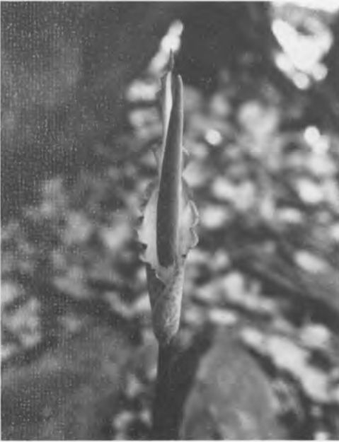
Fig. 1. Amorphophallus galbra F.M. Bailey; Kakadu National Park, Northern Territory; Australia; Croat 52418a.