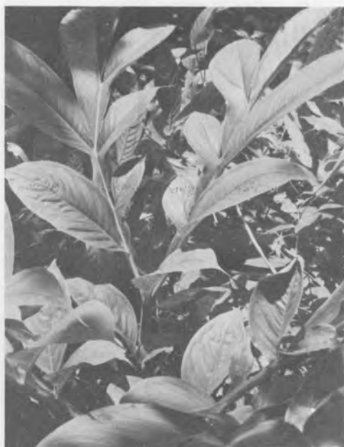
Fig. 10. Amorphophallus sp. Borneo: Malaysia: Sarawek; Road from Kuching to Padawan, Croat 53170.