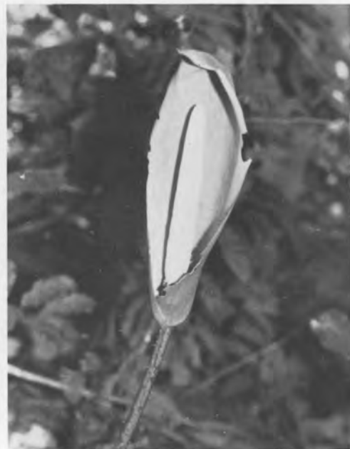
Fig. 24. Anchomanes difformis (Bl.) Engler. Nigeria: Ogun: Omo Forest Reserve. Croat 53493.