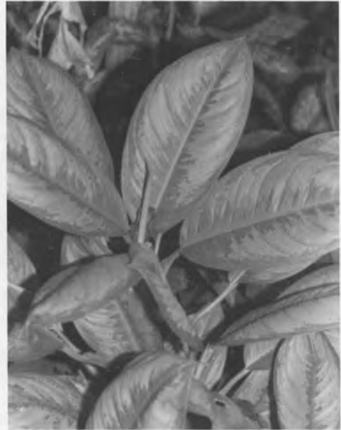
Fig. 4. Aglaonema crispum Papua New Guinea: Morobe: Lae Botanical Garden; Croat 52874