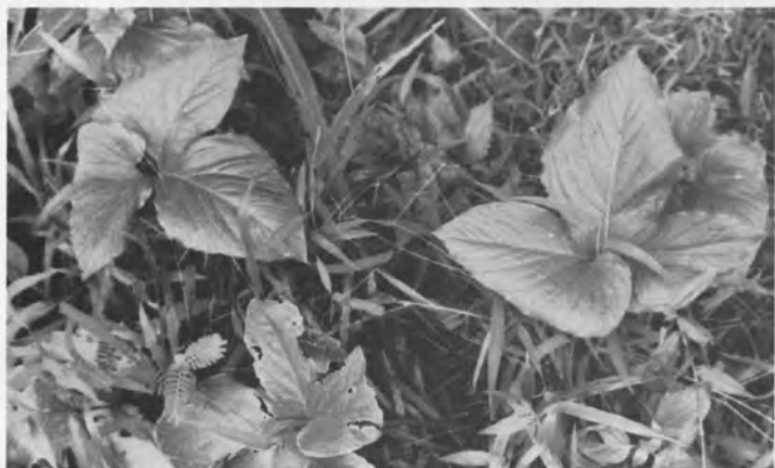
Fig. 31. Typhonium trilobatum (L.) Schott. W. Malaysia: Kuala