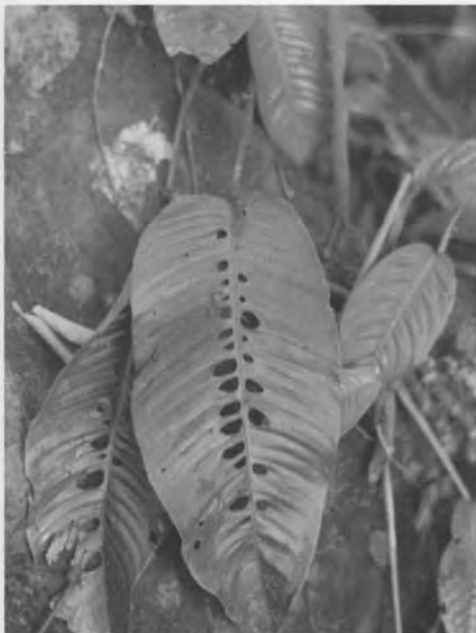
Fig. 5. Rhaphidophora sp. Borneo: Malaysia: Sabah; Kota-Kinabalu- Tambunan; Croat 53118