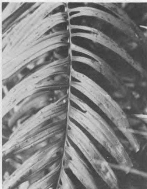
Fig. 14. Rhabdophora korthalsii Schott. Philippines: Luzon: Quezon: Quezon National Park, Croat 52993.