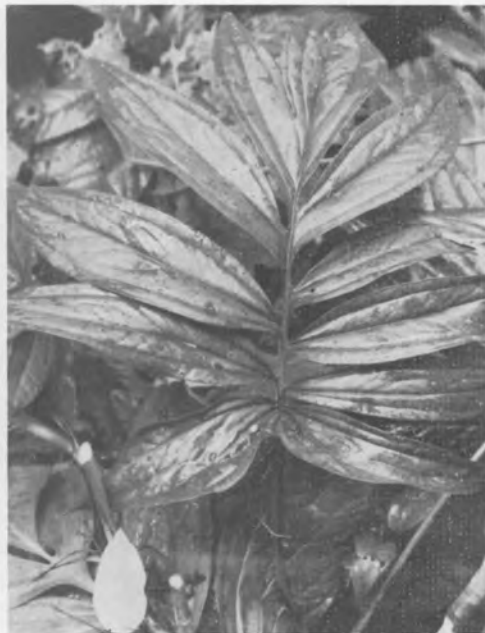
Fig. 6. Amydrium magnificum (Engler) Nicolson: Papua, New Guinea: Morobe: Road from Lae to Sankewep, Croat 52817