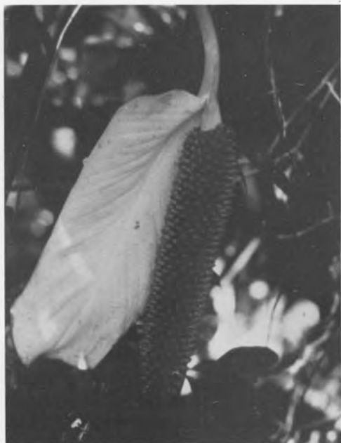
Fig. 17. Spathiphyllum commutatum Schott. Philippines: Luzon: Camarines Norte: Bicol National Park, Croat 53048.