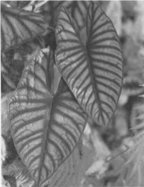
Fig. 3. Alocasia sp. Borneo: Malaysia: Sarawak; Kuching.