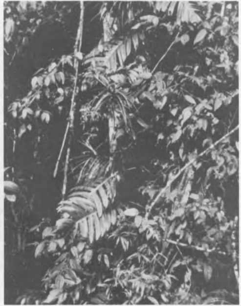
Fig. 2. Rhaphidophora pinnata Schott; Australia; Queensland, Lake Eachum Croat 52651.