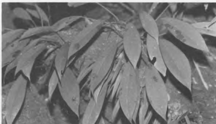
Fig. 30. Aridarum nicolsonii Bogner. Borneo: Malaysia: Sabah: Bako National Park, Croat 53211.