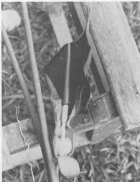
Fig. 21. Typhonium trilobatum (L.) Schott. W. Malaysia: Kuala Lumpur.