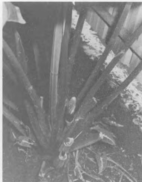
Fig. 7-8. Holochlamys beccarii Engler. Papua New Guinea; Morobe: Lae Botanical Garden.