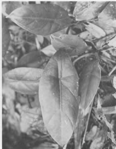
Fig. 22. Alocasia sp. W. Malaysia: Selangor: Genting Highlands. Croat 53338.