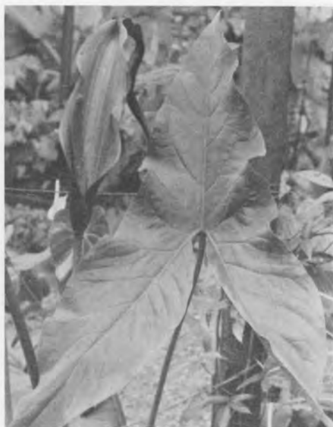
Fig. 12. Cyrtosperma johnstonii (Bull.) N.E. Br. Papua New Guinea: Morobe: Lae Botanical Gardens.