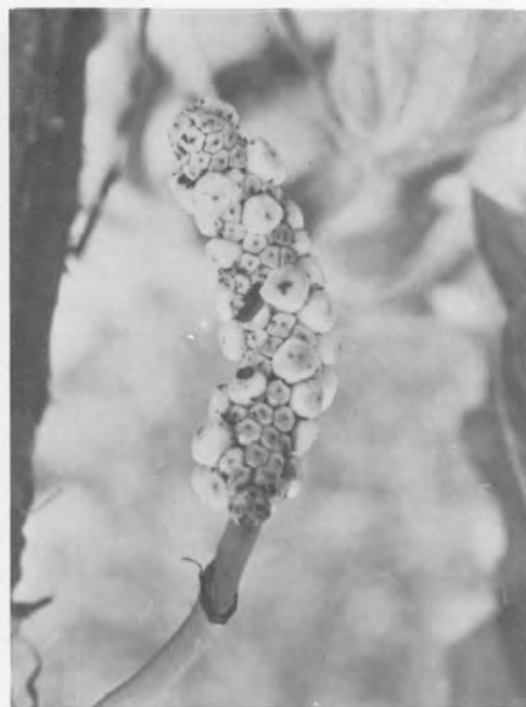
Fig. 19-20. Amydrium medium (Zoll. & Mori) Nicolson. Borneo: Sarawak: Kuching Botanical Research Center.