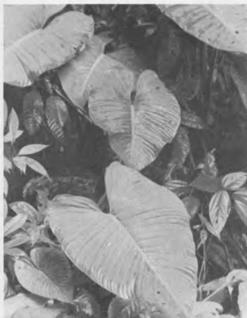
Fig. 13. Homalomena sp. Borneo: Malaysia: Sabah; Road from Kota Kinabalu to Tambunan, 460 meters elev., Croat 53104.