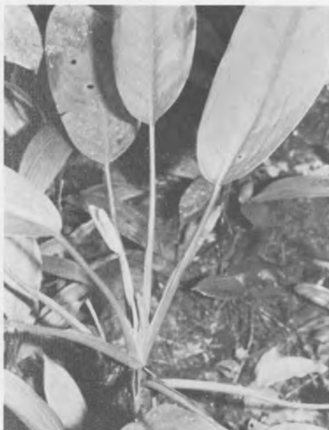
Fig. 9. Aglaonema marantifolium Blume. Papua New Guinea: Morobe: Busu River Valley, Croat 52844.