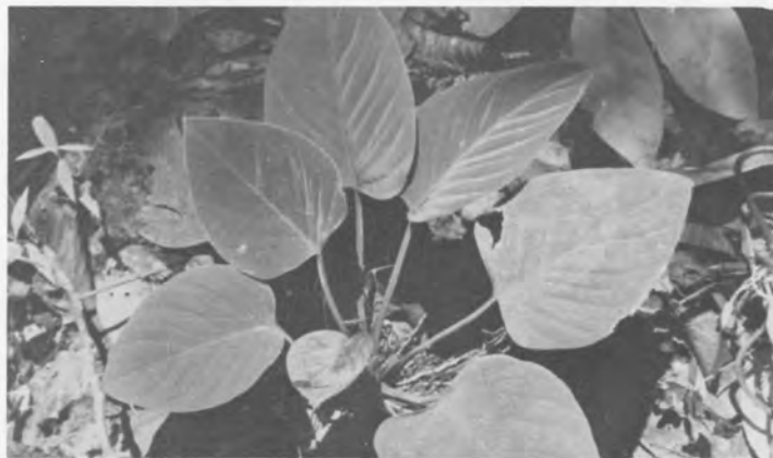
Fig. 26. Homalomena sp. Borneo: Sarawak: Road from Kuching to Padawan, Croat 53174.