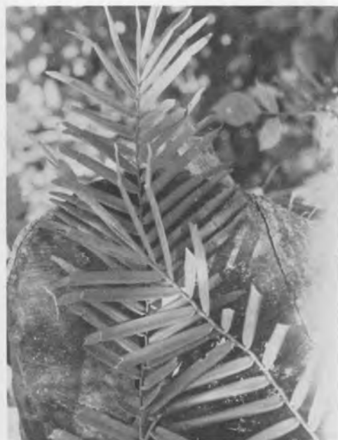
Fig. 15. Pothoidium lobbianum Schott. Philippines: Luzon: Quezon: Quezon National Park, Croat 53043.