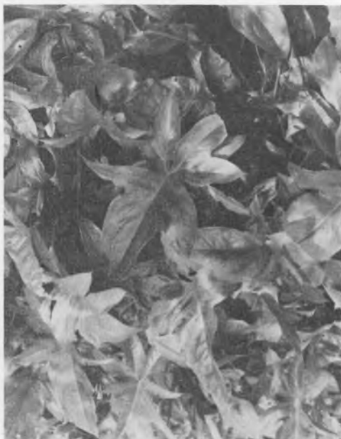
Fig. 11. Lasia spinosa (L.) Twaites. Papua New Guinea: Morobe: Lae Botanical Garden, Croat 52905.