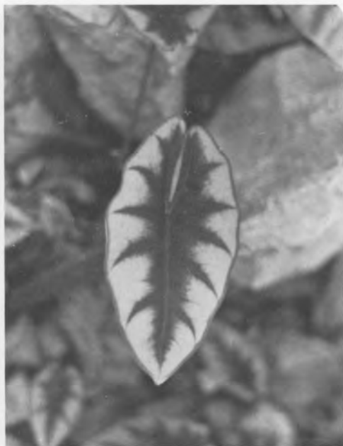
Fig. 18. Alocasia sp. Borneo: Sarawak: Road from Kuching to Padawan, Croat 53183.