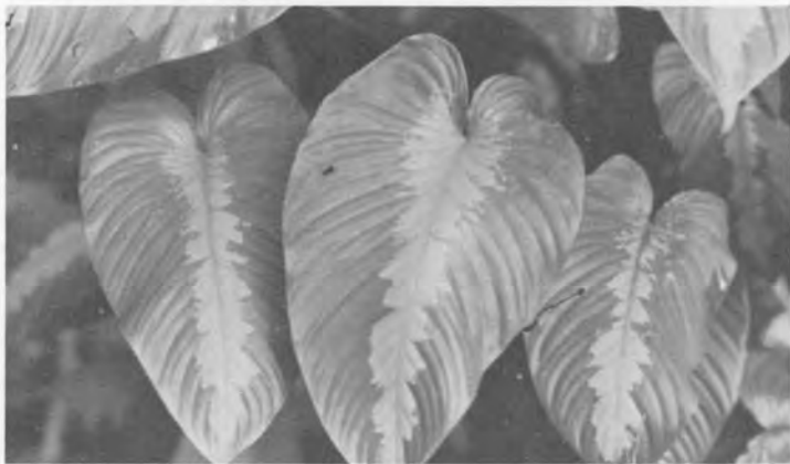
Fig. 25. Homalomena sp. Borneo: Sarawak: Road from Kuching to Padawan, Croat 53174.