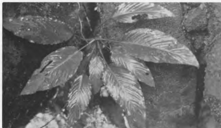
Fig. 29. Schizmatoglottis sp. Borneo: Malaysia: Sabah: Road from Kota Kinabalu to Tambunan, Croat 53110.