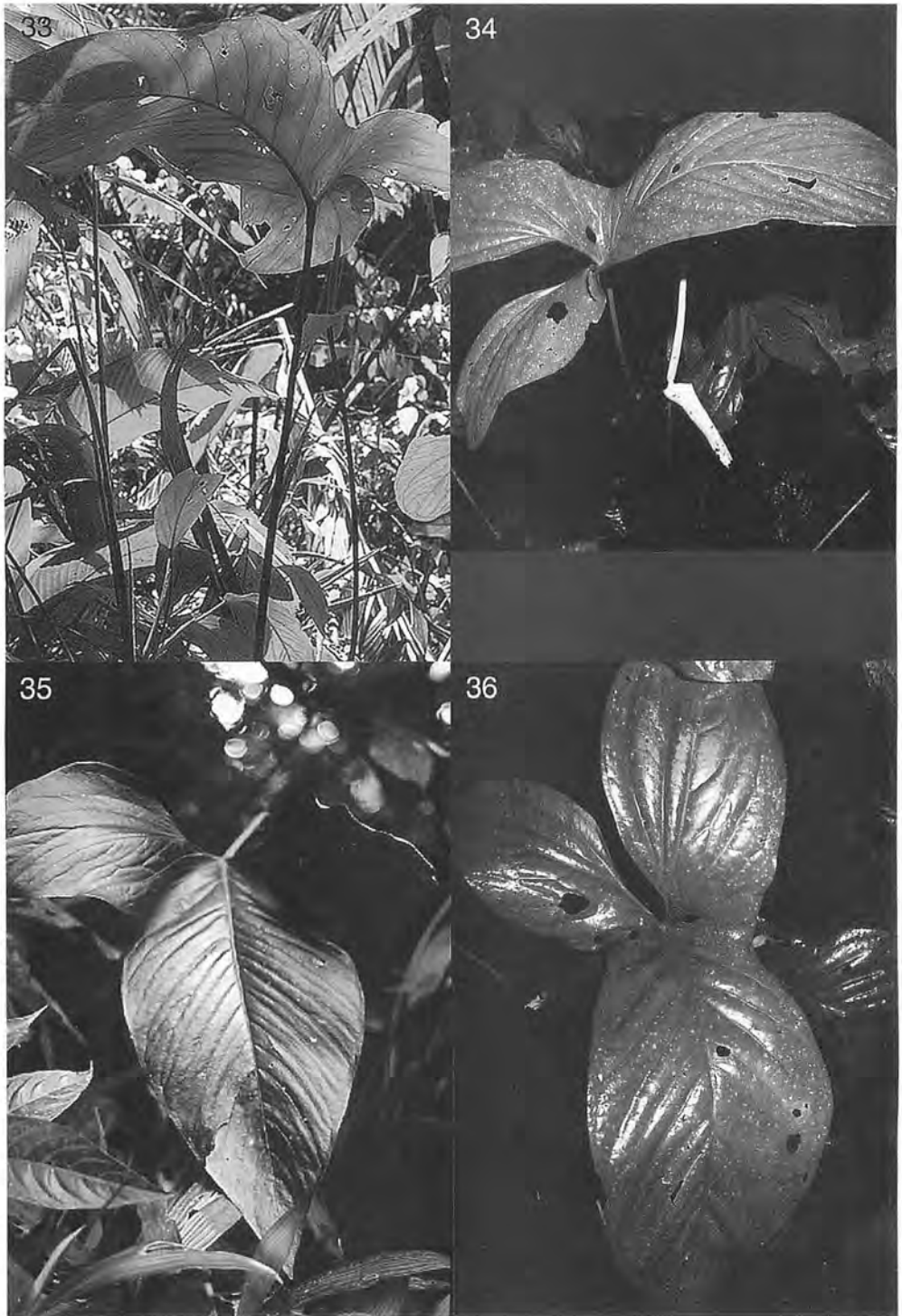
Figs. 33–36. Anthurium variilobum Croat & M. Mora (M. Mora & Croat 350). —33 (top L). Habit. —34 (top R). Flowering plant. —35 (bottom L). Blade adaxial surface. —36 (bottom R). Blade showing deeply 3-lobed blade.