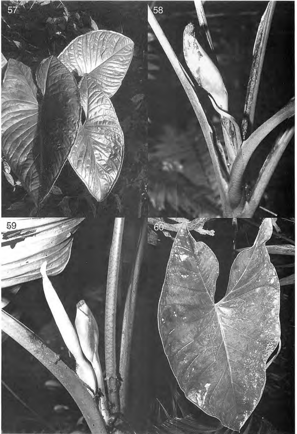
R). Inflorescence at anthesis. —59 (bottom L). Petiole bases with inflorescence and in-fructescence. —60 (bottom R). Xanthosoma daguense Engl. var. daguense . Leaf blade adaxial surface.