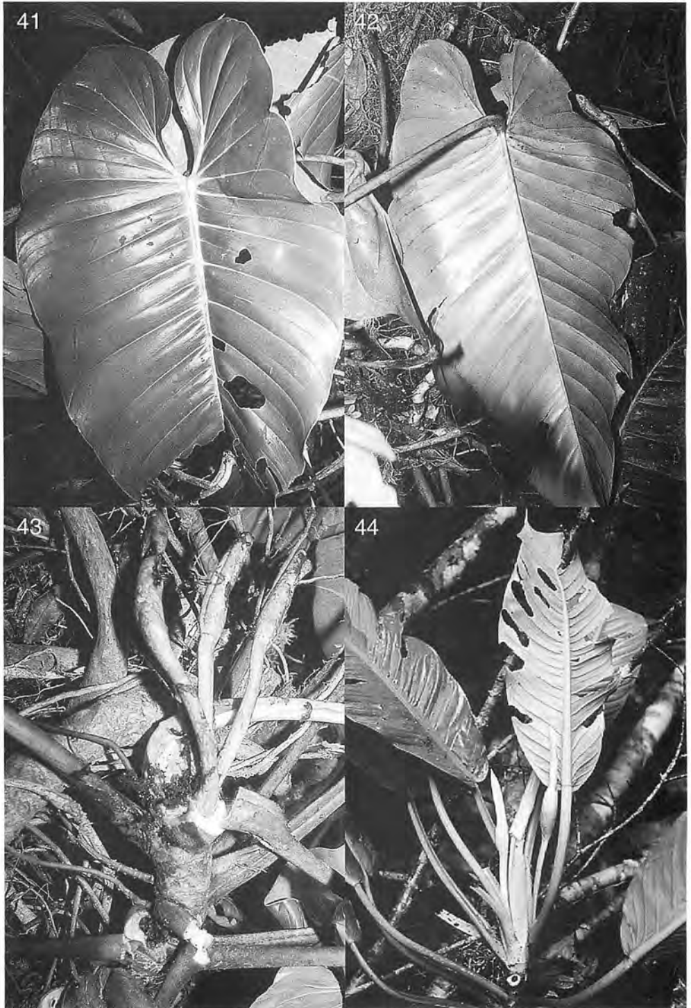
Figs. 41–44. —41, —42, —43. Philodendron amargalense Croat & M. Mora ( Mora & Croat 379 ) —41 (top L). Leaf blade adaxial surface. —42 (top R). Leaf blade abaxial