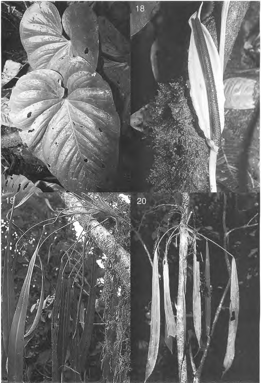
Figs. 17–20. —17, —18 (top L, top R). Antburium galeanoae Croat & M. Mora (M. Mora & Croat 329). —17 (top L). Leaf blades adaxial surface. —18 (top R). Close-up of inflo-