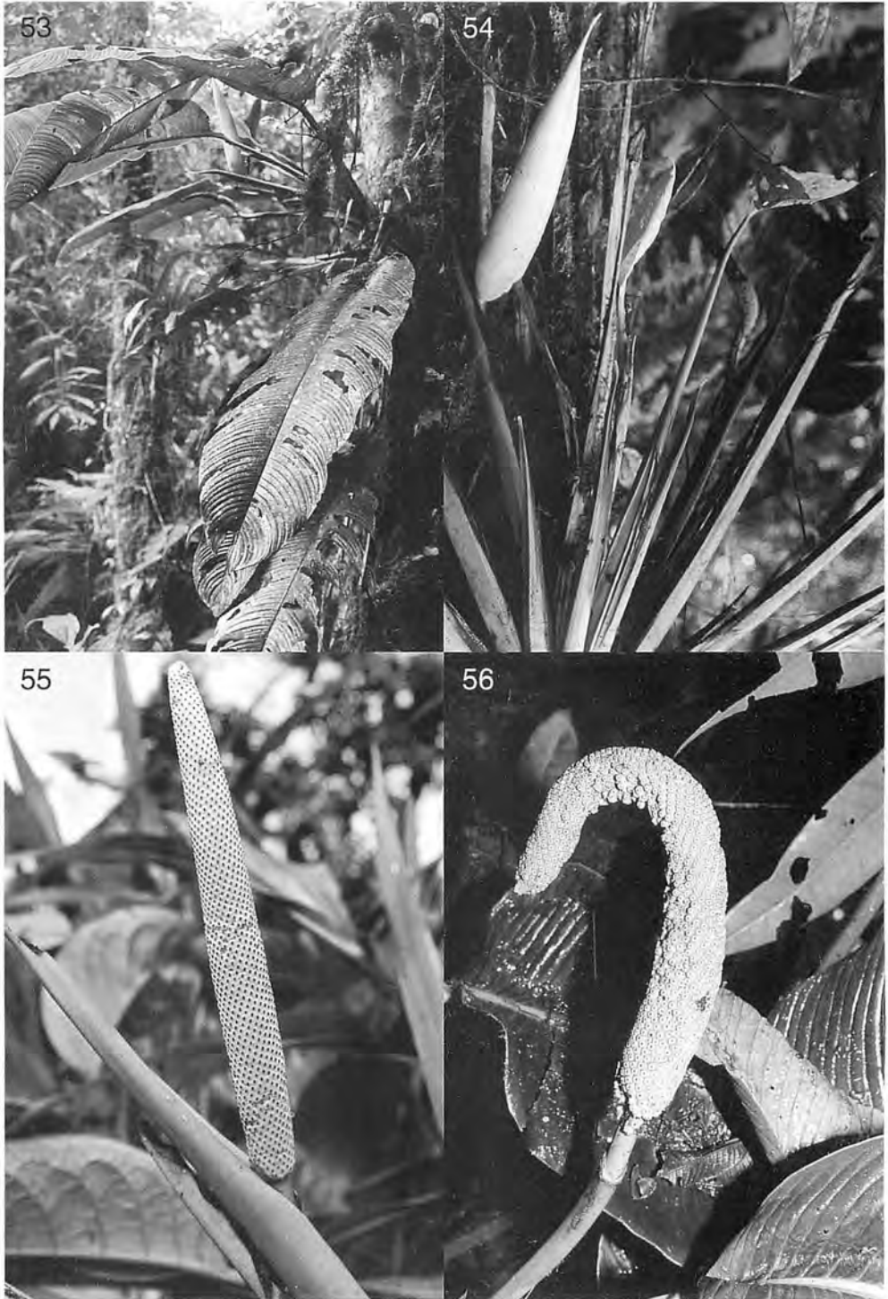
Figs. 53–56. Rhodospatha monsalvae Croat & Bay. (Croat 72400). —53 (top L). Habit. —54 (top R). Petioles and inflorescence near anthesis. —55 (bottom L). Close-up of inflorescence with spathe fallen. —56 (bottom R). Infructescence in early fruit.