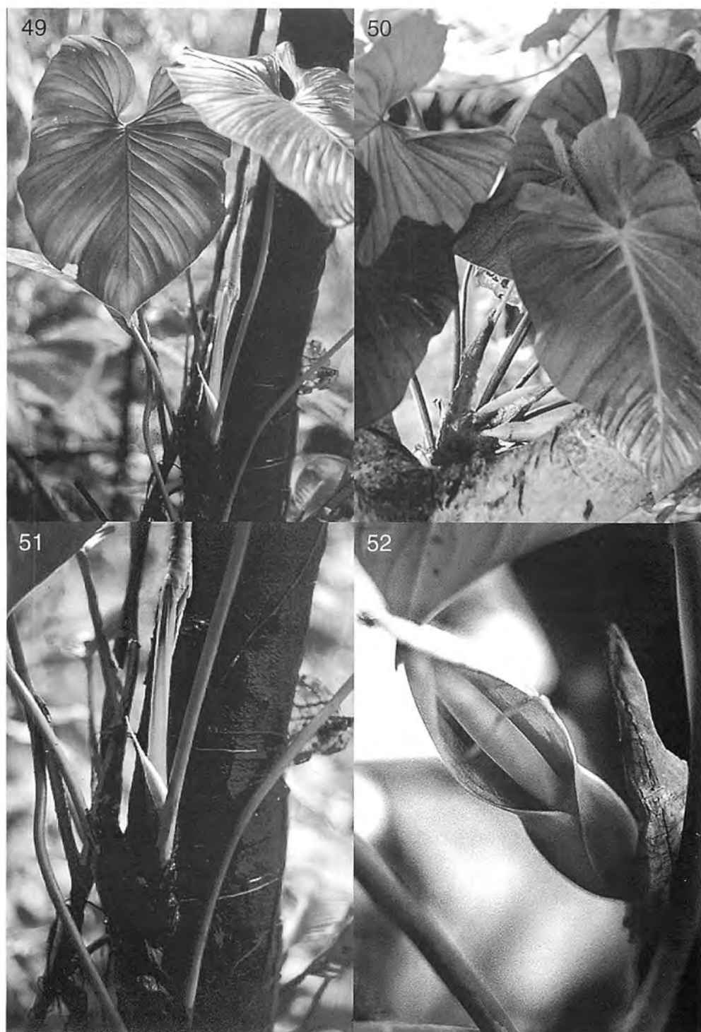
Figs. 49–52. Philodendron roseocataphyllum Croat & M. Mora. ( M. Mora & Croat 384). —49 (top L). Habit. —50 (top R). Habit. —51 (bottom L). Petiole bases and inflorescence. —52 (bottom R). Inflorescence at anthesis.