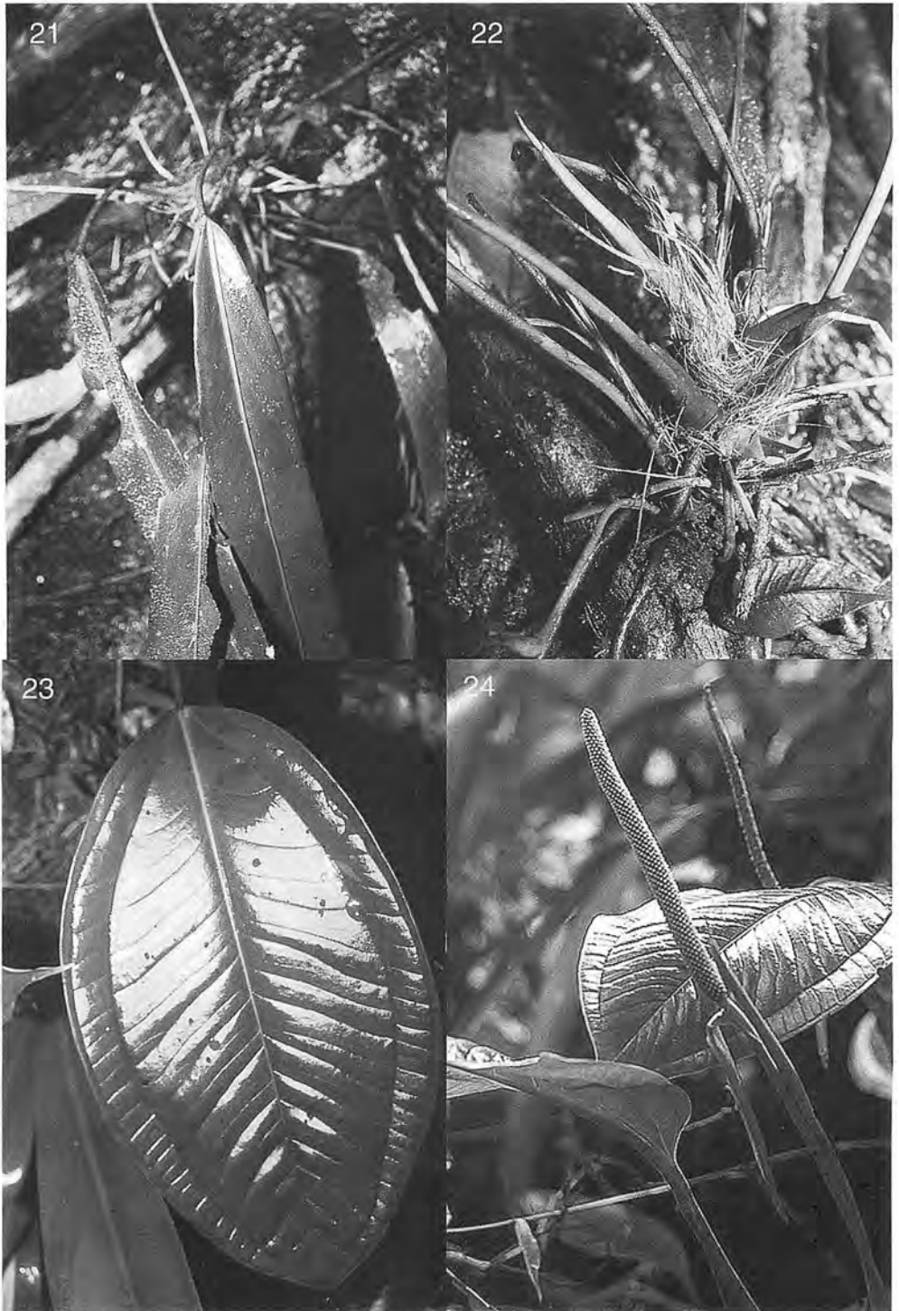
Figs. 21–24. —21, —22 (top L, top R). Anthurium grandicataphyllum Croat & M. Mora (M. Mora & Croat 376) —21 (top L). Habit. —22 (top R). Close-up of stem showing