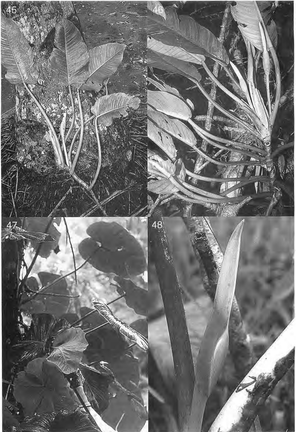
Figs. 45–48. —45, —46 (top L, top R). Philodendron laticiferum Croat & M. Mora. ( M. Mora & Croat 337 ) —45 (top L). Flowering plant on ground. —46 (top R). Flowering