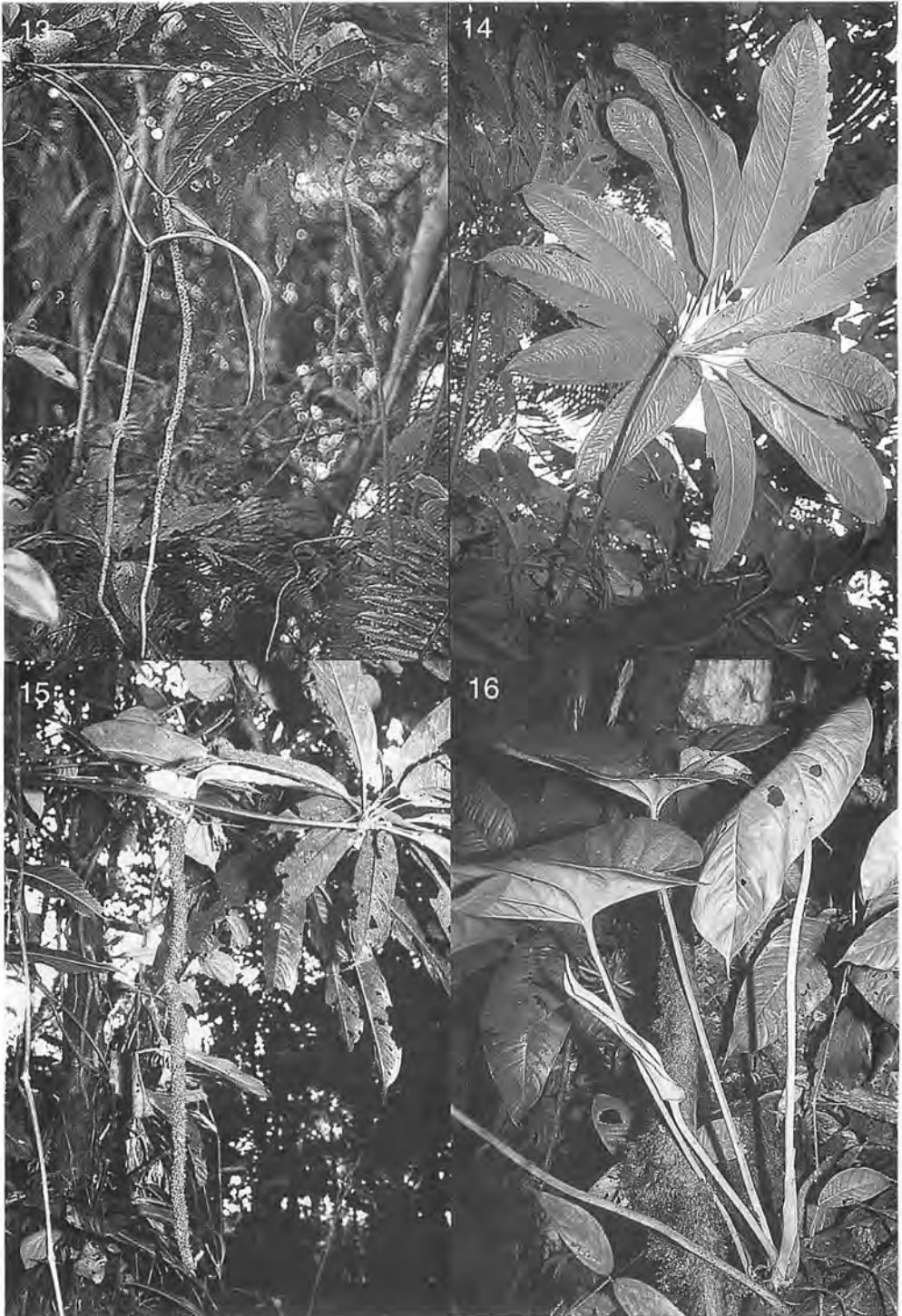
Figs. 13–16. —13, —14, —15 (top L, top R, bottom L). Anthurium eminens ssp. longispadix Croat & M. Mora. (M. Mora & Croat 331) —13 (top L). Habit with inflorescence