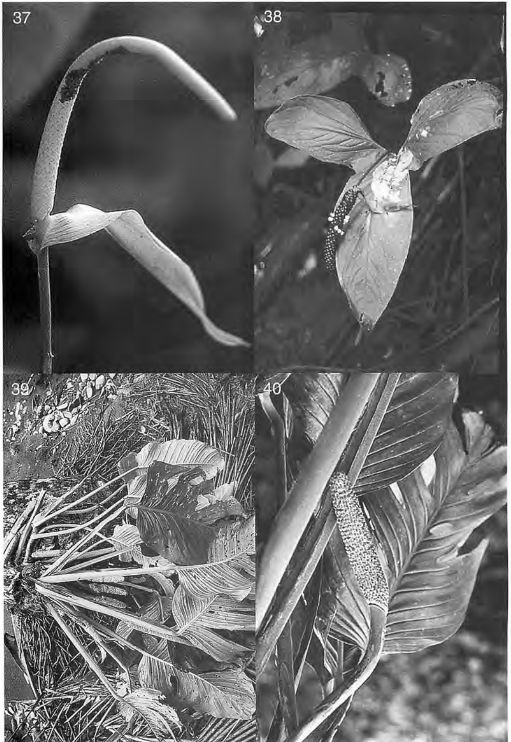
Figs. 37–40. —37, 38 (top L, top R). Antburium variilobum Croat & M. Mora (M. Mora & Croat 350) —37 (top L). Close-up of inflorescence. —38 (top R). Leaf with infructescence.