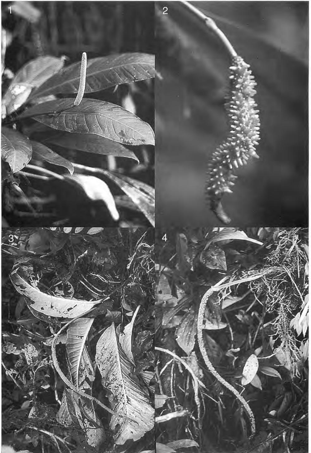
Figs. 1–4. —1, —2, (top L & R). Anthurium acutibacca Croat & M. Mora ( M. Mora & Croat 363 ). —1 (top L). Habit of flowering plant. —2 (top R). Inflorescence showing