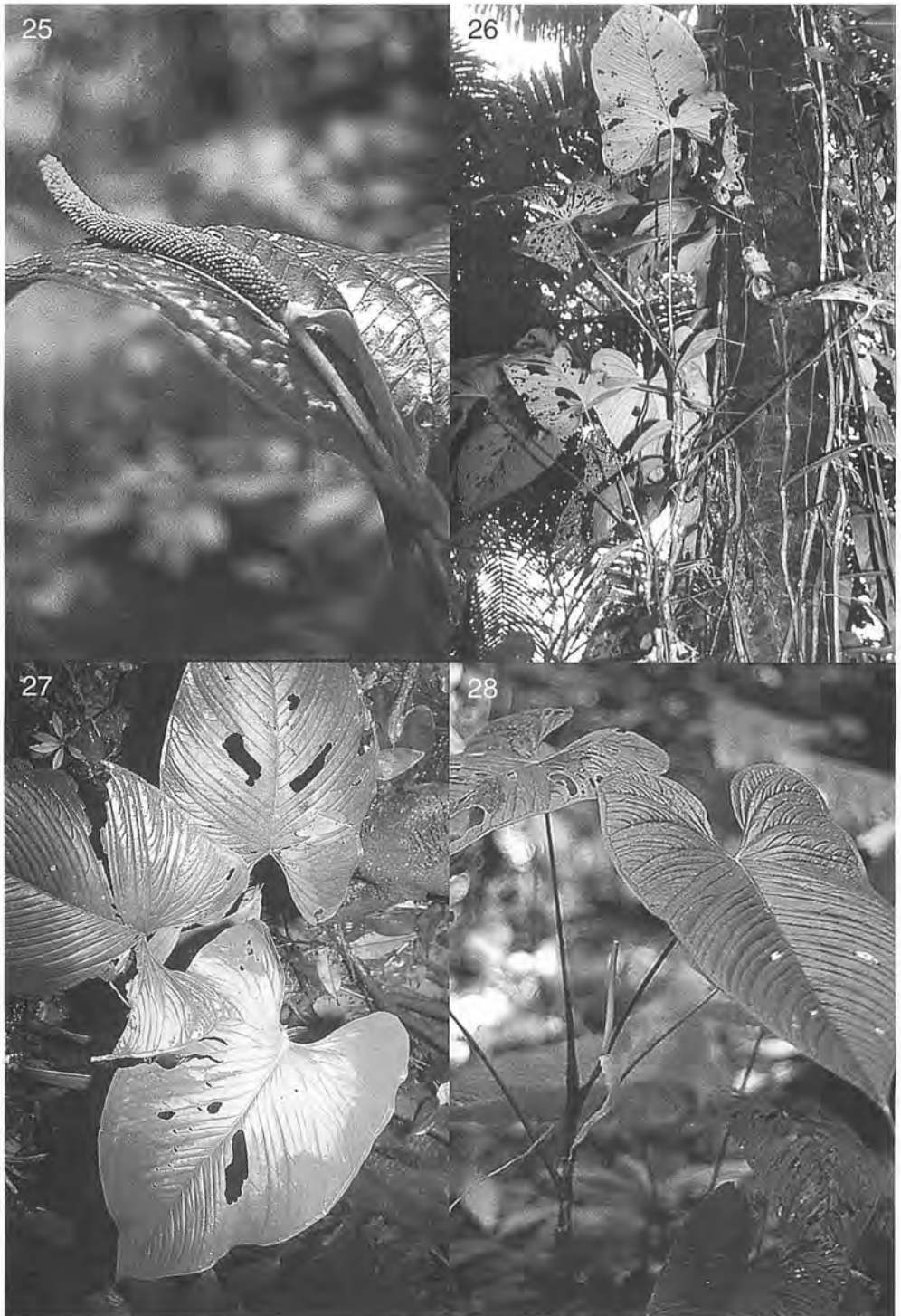
Figs. 25–28. —25 (top L). Anthurium morae Croat ( M. Mora & Croat 331). Leaf with young inflorescence. —26, —27, —28 (top R, top R, bottom L). Anthurium pallidicau-