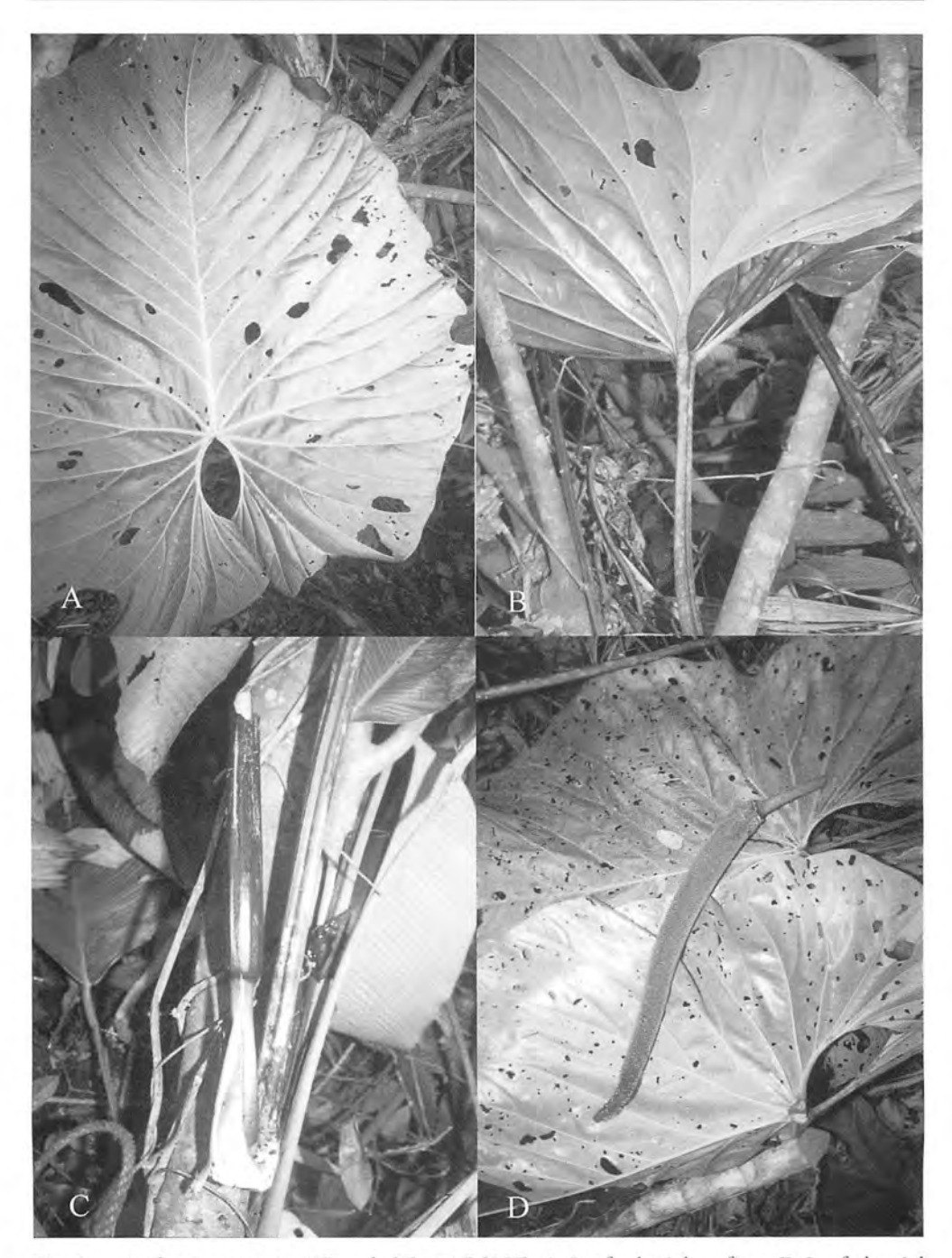
Fig. 1. Antburium gustavii Regel. ( Croat 84137 ). A. Leaf adaxial surface. B. Leaf abaxial surface and petiole. C. Petiole and petiole sheath. D. Leaf with inflorescence.