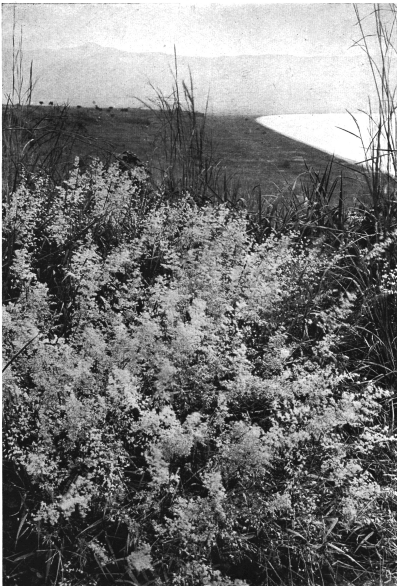
NATAL GRASS AS IT GROWS ON THE SHORES OF LAKE TANGANYIKA, AFRICA. (TRICHOLOAENA ROSEA NEES; S. P. I. NO. 50038.)