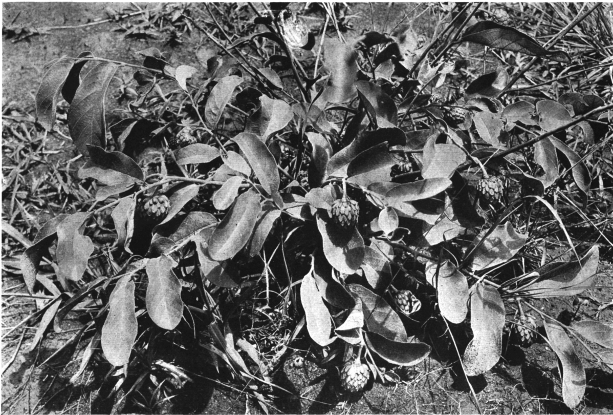
THE ABO, AN AFRICAN ANONA. ( ANNONA SENEGALENSIS PERS.; S. P. I. NO. 49843.)

This species is said to vary remarkably, some forms being low shrubs not more than 2 or 3 feet in height, like the one shown above, and others trees 30 feet tall. The yellowish or orange-colored fruits, about the size of small apples (2 to 2½ inches across), have a delicious flavor, which makes them very popular with travelers in tropical Africa. If this shrub will bear in southern Florida or California it may become a valuable winter fruit in those regions. (, Kafue, Northern Rhodesia, November 21, 1919; P36765FS.)