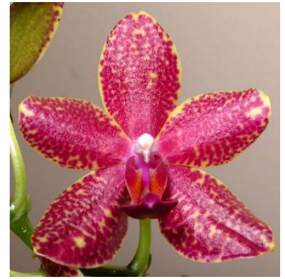
Phalaenopsis Mary Polliard

White – Neostylis Lou Sneary - Ramborger