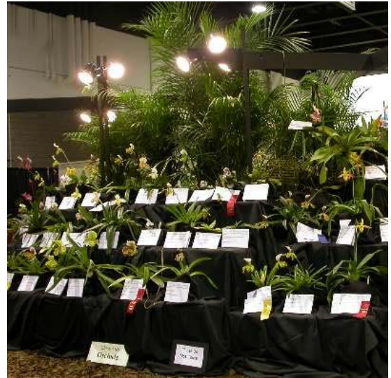
The orchid display at last year's Flower Show.

As many of you know, the Southeastern Flower Show has a special exhibit for orchids with most of the entries coming from the Atlanta Orchid Society and the South Metro Orchid Society. People who enter orchids in the Horticulture Division get a non-transferable single-day free admission to the show. We also have several opportunities for volunteering at the show to help promote orchid growing and our society. Volunteers get free admission on the day they are working at the show. Please read the information below if you plan to enter plants or would like to volunteer at the show. You also will hear more about this at the January society meeting. The web site for the Show is www.flowershow.org . We need as many people as possible to bring plants for the display. If you won't be able to get down to the World Congress Center that Monday, contact me in advance and maybe we can work out a way to get your plants to the show. If you haven't exhibited before, we encourage you to bring some plants this year.