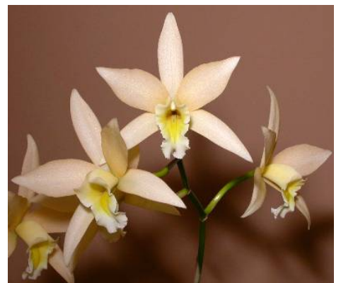
Laelia Canariensis ‘Golden Glow’

Hybrids - Blue- Laelia Canariensis ‘Golden Glow’ HCC/AOS – Collier/Reinke : Laelia Canariensis is a charming ‘antique’ hybrid originally registered 100 years ago. It is a cross between Laelia anceps from Mexico, and Laelia harpophylla from Brazil. In the ‘Golden Glow’ clone, the dominance of L. anceps for flower form, flower count, and strong upright stems is apparent. Only a hint of the other species is evident in the elongated and somewhat recurved lip, and the pale yellow-apricot color. Although Laelia Canariensis possesses many good qualities, only two registered hybrids have been made from it. This may be due to a degree of sterility that seems to be a problem in many L. anceps hybrids, cutting short what may otherwise be very promising breeding lines.