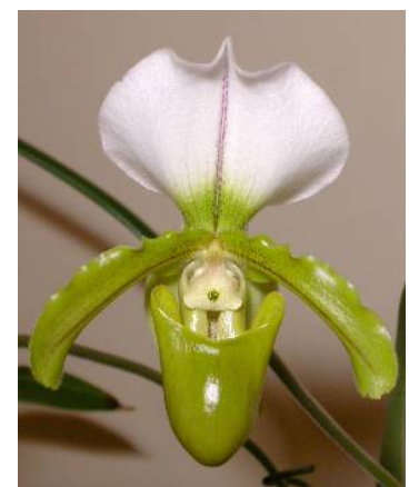
Paphiopedilum Hamana Spice