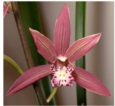
Cymbidium Miss Taipei Unveiled