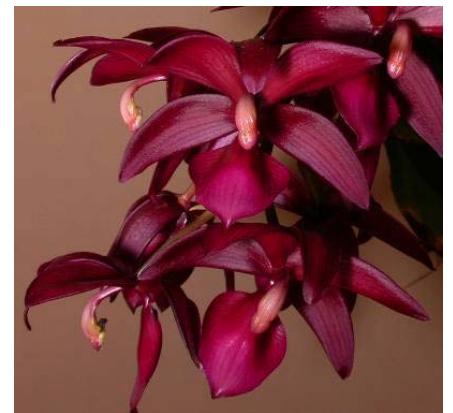
Cycnodes Wine Delight ‘J.E.M.’