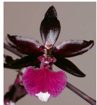
Oncidium Black Beauty ‘Ken’