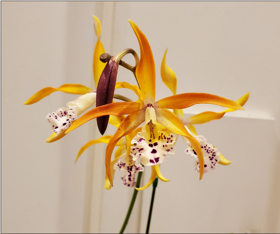
Myrmecatavola Tiger Lily 'MBF'