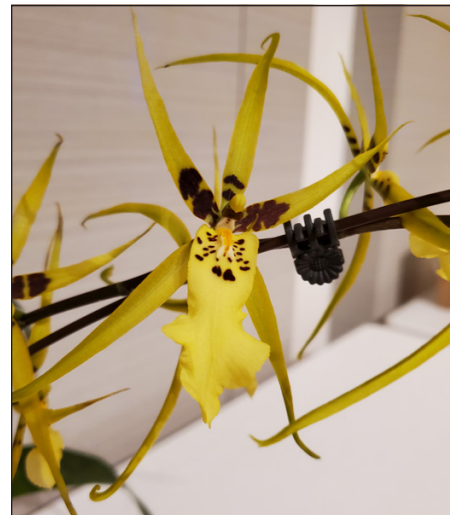
Aliceara Pacific Nova 'Okika' AM/AOS