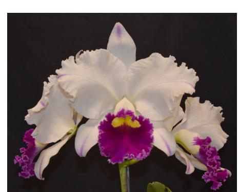
C. Log Cabin 'Chasus' AM/AOS