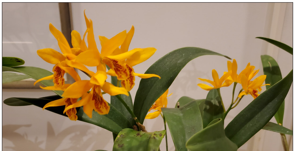
Enanthleya Magic Wand

and bright light. I believe the mother plant was put in a basket, but the plant has completely covered it to the point where you can no longer see any of the material, even after a number of divisions were removed from it. I made several attempts to remake this cross using a Mcp. tibicinis obtained from H&R and a tetraploid Bc. Richard Mueller and was finally successful in producing fertile seed.