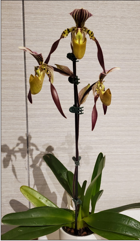
Paphiopedilum Lebaudy anum