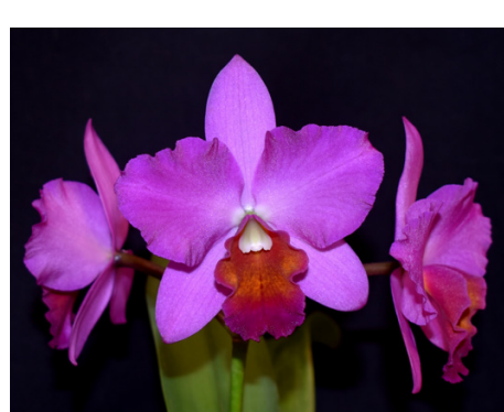
Rth. Life's Charm 'Chasus' AM/AOS