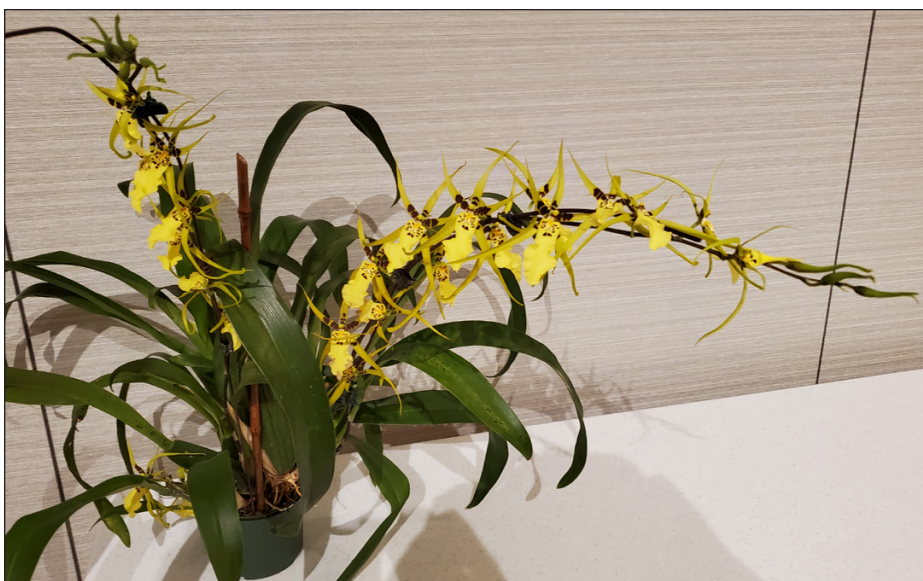
Aliceara Pacific Nova 'Okika' AM/AOS

They also do well with a little brighter light and a more open mix. If this one does have a fault it is that the space between growths is fairly great, causing it to outgrow its container more quickly. To keep the foliage from becoming too marred with spots, water should be fairly frequent, with only allow the plant to just dry before reapplying. Good air movement is also beneficial. There is a beautiful peloric mutation of this orchid with the clonal name 'Hilo Stars.' If you find one you have a real treasure.