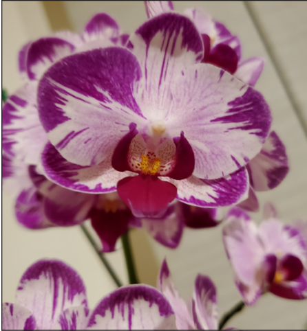
Phalaenopsis Little Gem Stripes