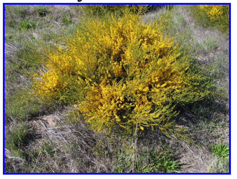
Acacia rhetinocarpa or Neat Wattle

Yorke Peninsula is one of the richest agricultural areas in South Australia, and those who work the land can be justly proud of the way that such fine harvests can be gleaned from this rich environment.